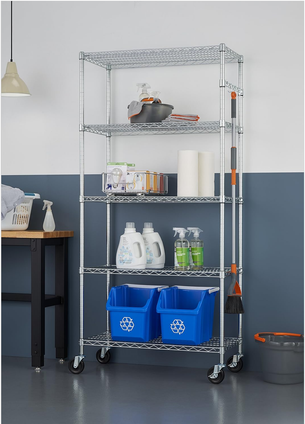
Image: Fully assembled TRINITY EcoStorage 5-Tier Wire Shelving Unit in a garage, showcasing its storage capacity and mobility with wheels.