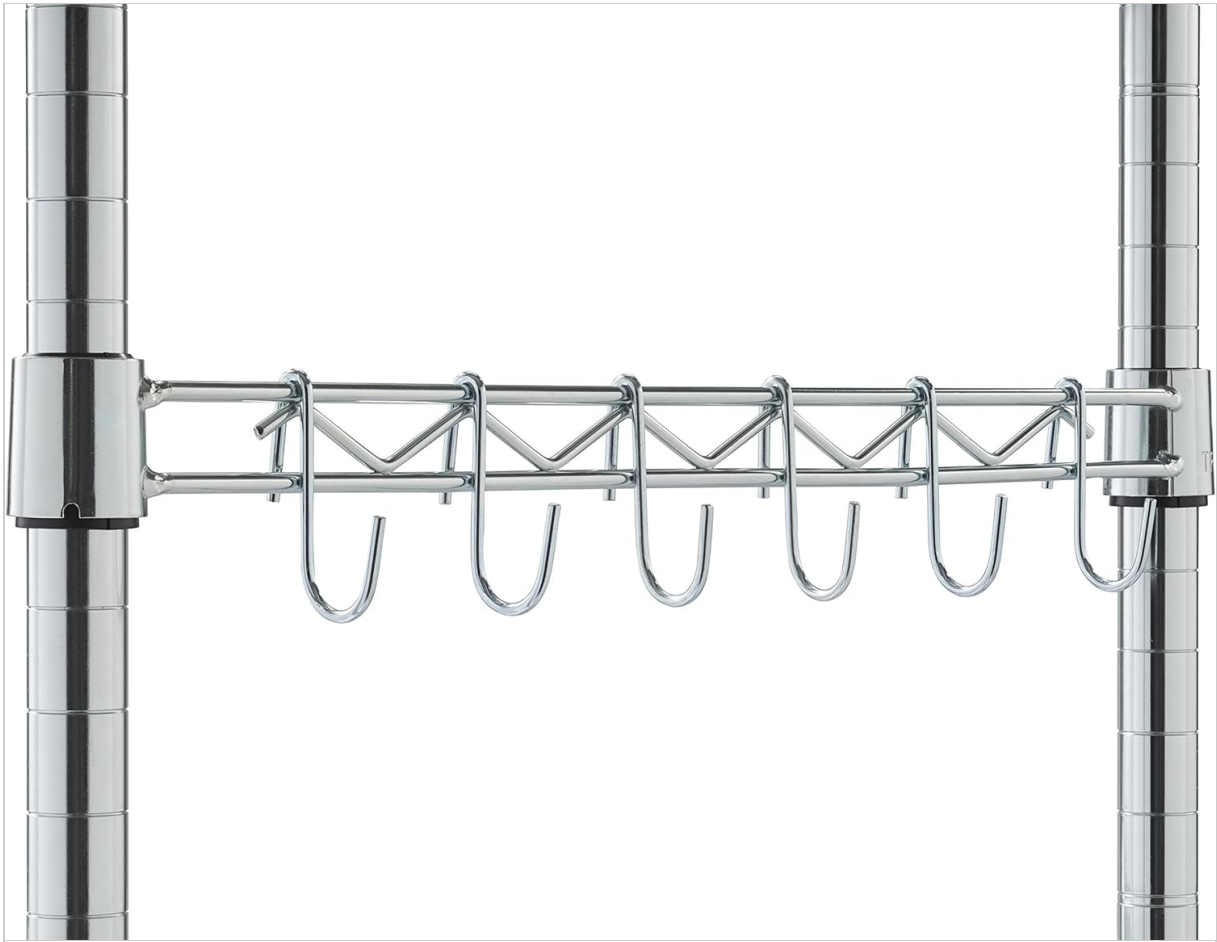
Image: Close-up view of the integrated sidebar with six hooks, demonstrating its utility for hanging various items.