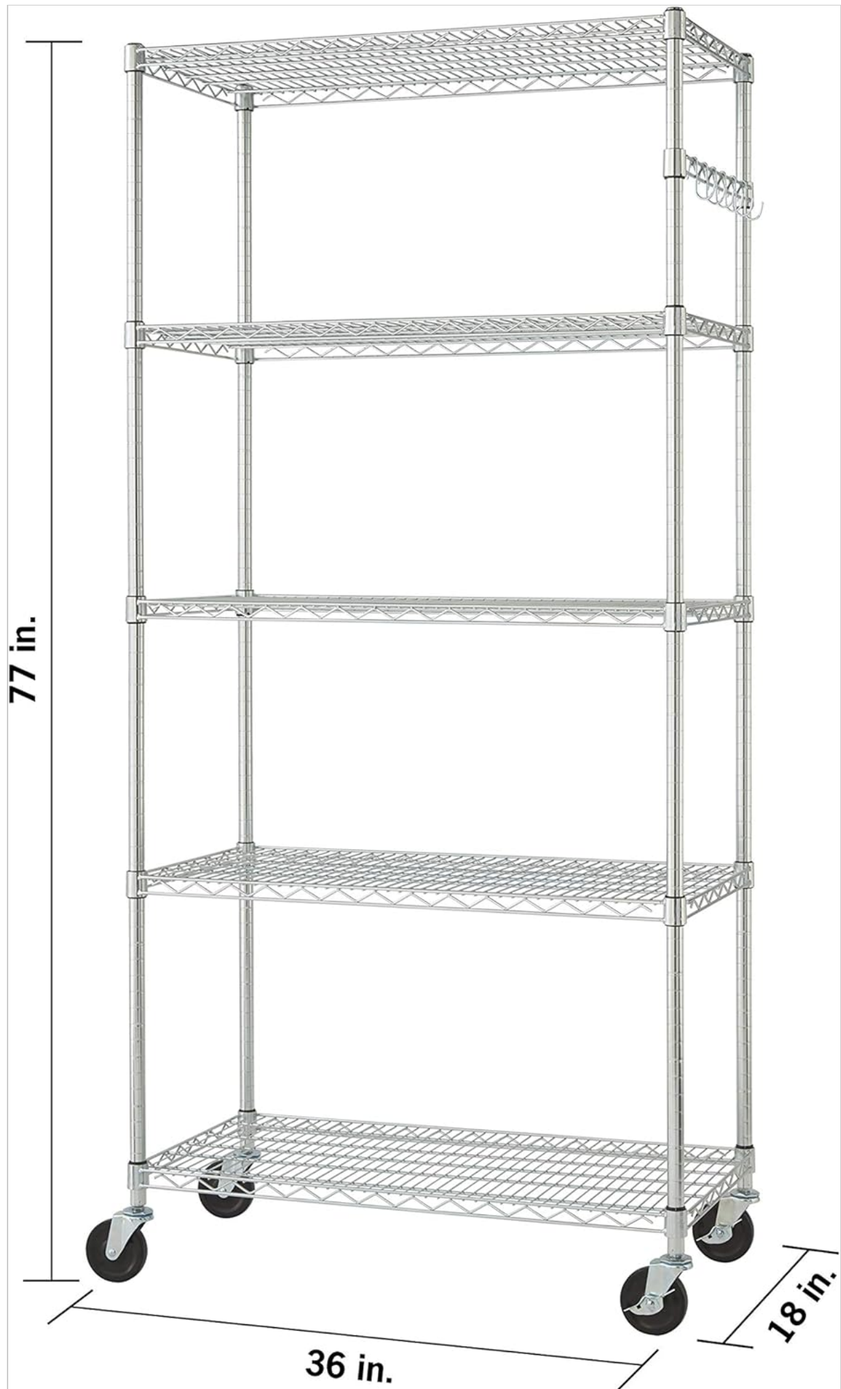
Image: Detailed diagram indicating the overall dimensions of the shelving unit: 36 inches wide, 18 inches deep, and 77