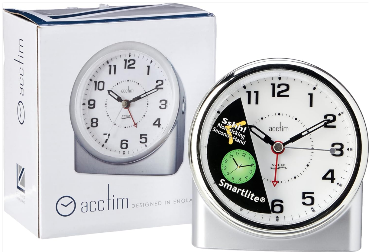
Figure 6.2: The Acctim clock alongside its packaging, with an overlay illustrating the Smartlite feature illuminating the dial in low light conditions.

The Acctim Bedside Alarm Clock features Smartlite technology. This innovative function automatically illuminates the clock's dial in low-light conditions, making it easy to read the time at night without needing to press any buttons. The illumination level adjusts based on ambient light.