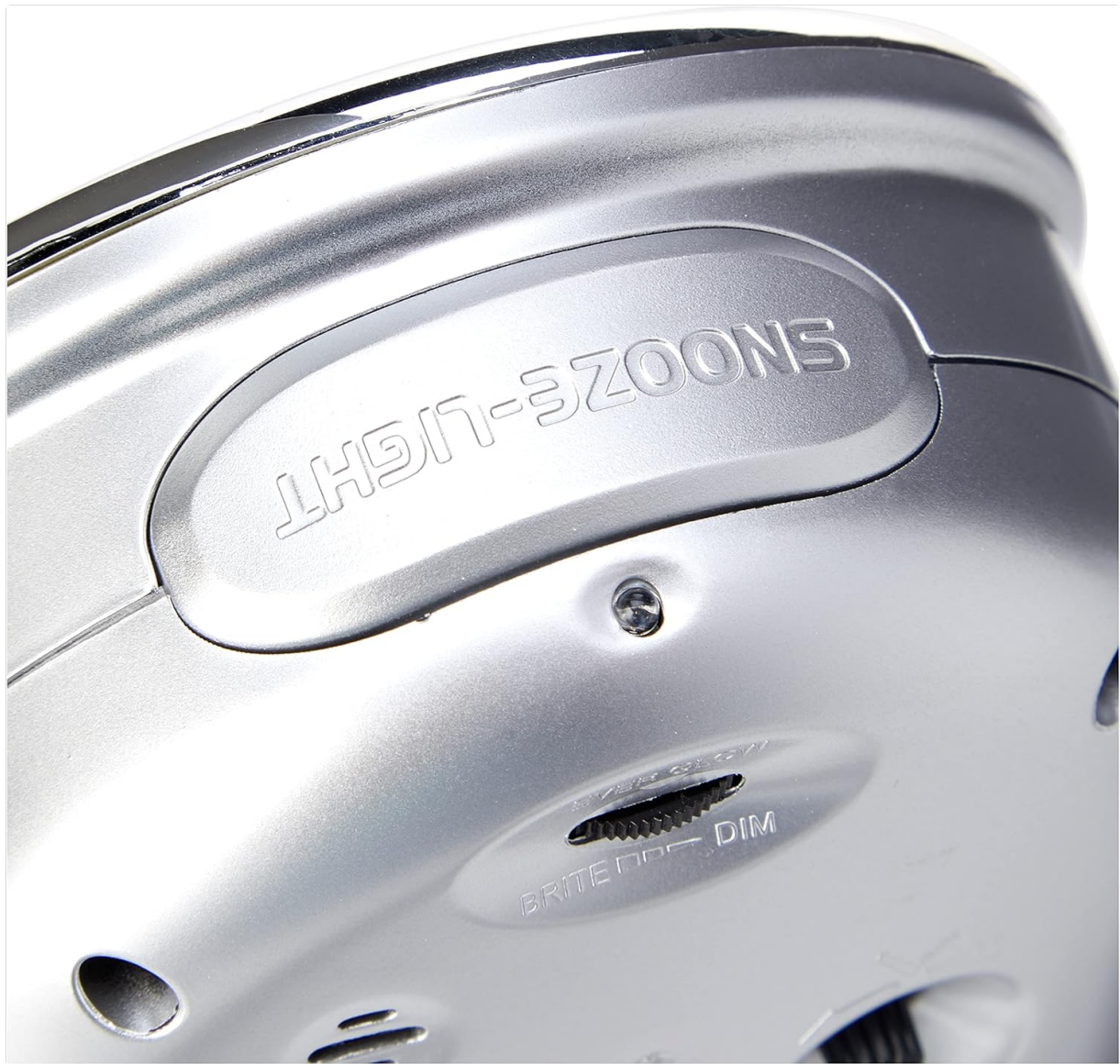
Figure 6.1: Close-up view of the top of the clock, showing the large 'SNOOZE-LIGHT' button and the 'BRITE-DIM' Everglow switch.

When the alarm sounds, press the large 'SNOOZE-LIGHT' button located on the top of the clock (refer to Figure 6.1). This will temporarily silence the alarm for approximately 5 minutes. The alarm will sound again after the snooze period. Pressing this button also activates the backlight for a few seconds for easy viewing in the dark.