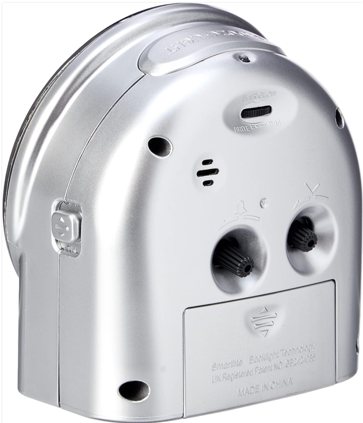
Figure 4.2: Rear view of the Acctim Bedside Alarm Clock, displaying the battery compartment, time setting knob, alarm setting knob, and Smartlite/Everglow controls.