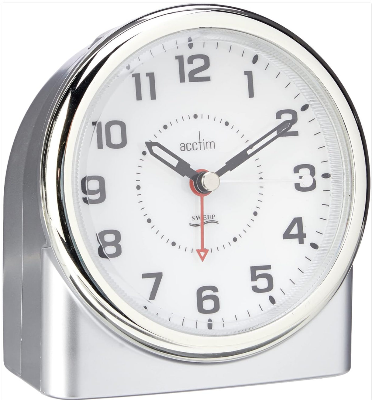
Figure 4.1: Front view of the Acctim Bedside Alarm Clock, showing the silver casing, white analog dial with black numbers, and hands.