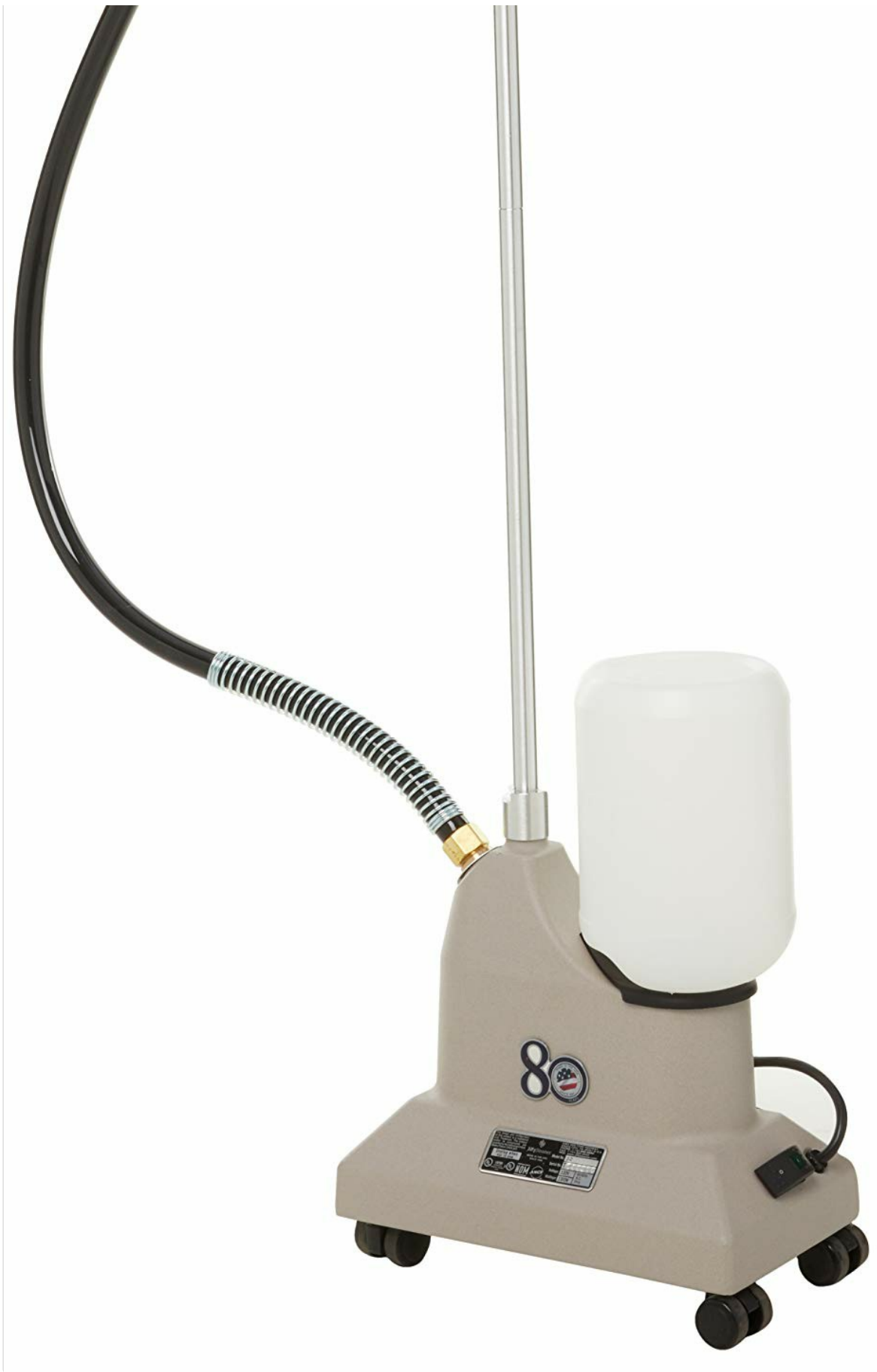
Figure 1: Fully assembled Jiffy Steamer J-2 with plastic steam head.