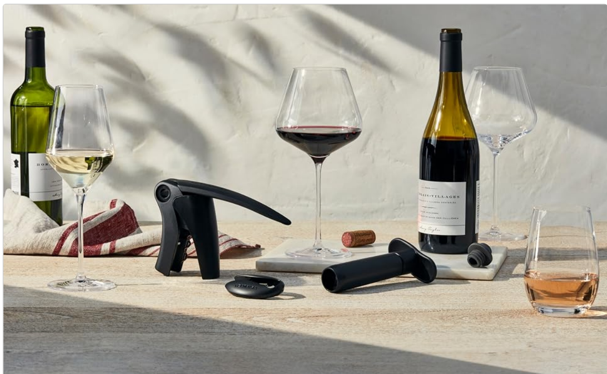
Image: A collection of Le Creuset wine tools, featuring a vertical lever corkscrew similar to those compatible with the replacement screw.