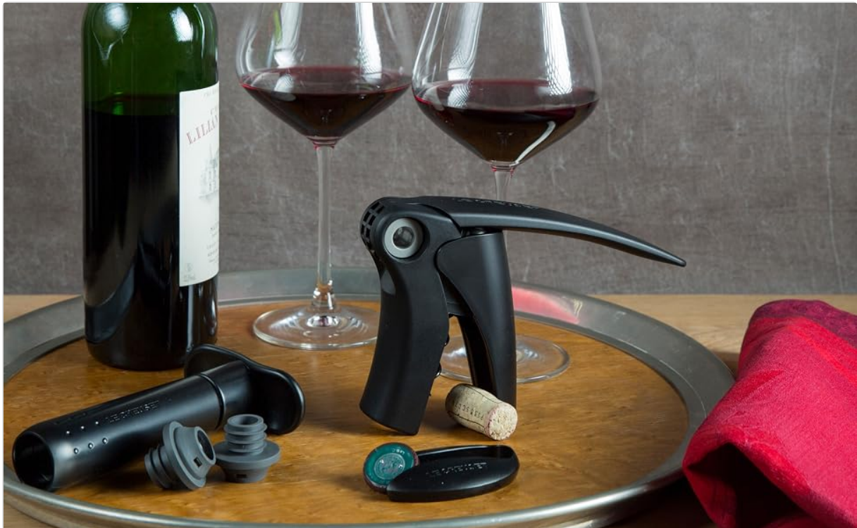
Image: Le Creuset wine tools, including a vertical lever corkscrew, ready for use.