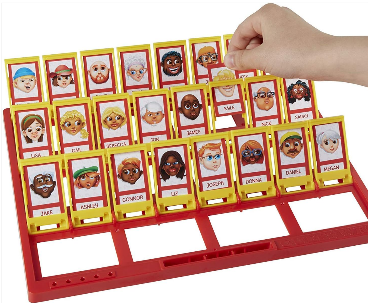
Image: A detailed view of the red game board with character cards properly inserted into their frames.