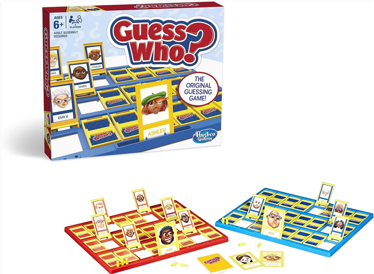
Image: The Guess Who game components laid out, showing the two game boards and the various cards ready for assembly.