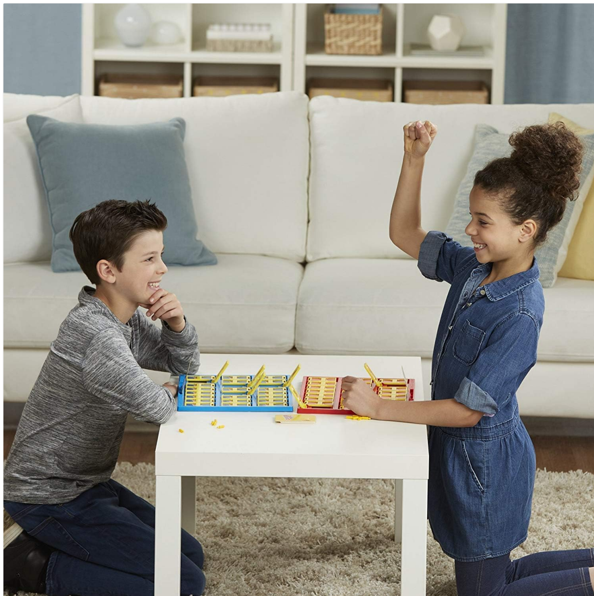
Image: Two children engaged in a game of Guess Who, demonstrating typical gameplay.

round. Use the score keepers to track wins.