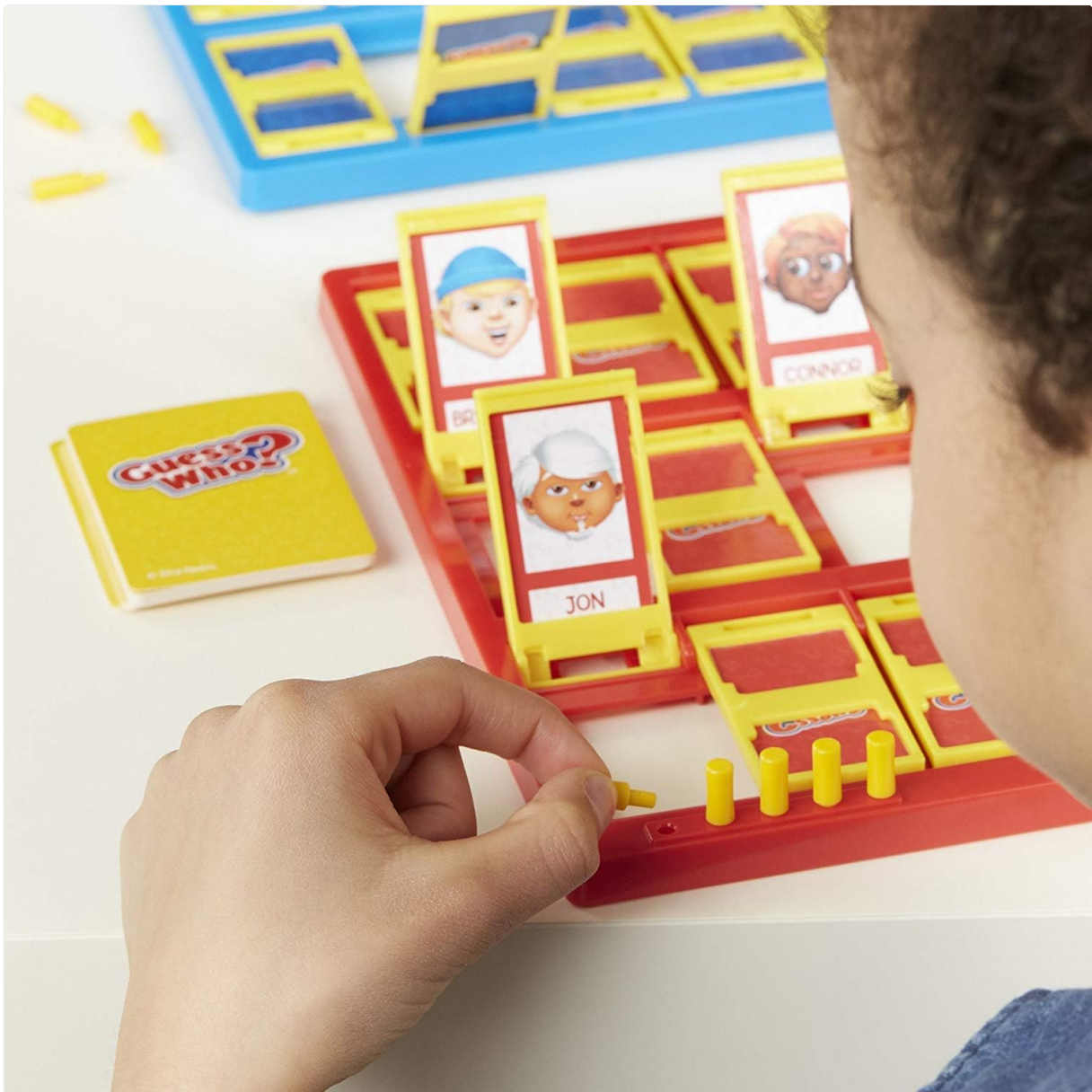
Image: A close-up of a hand placing a yellow peg into the score tracker on the game board, indicating a point scored.