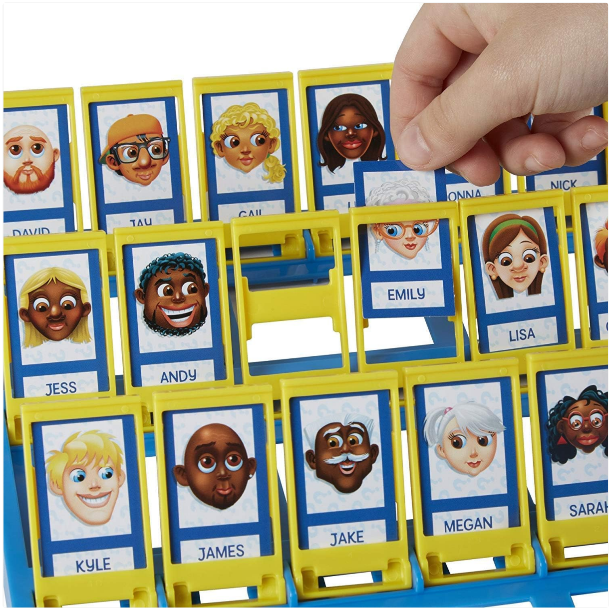
Image: A detailed view of the blue game board with character cards properly inserted into their frames.