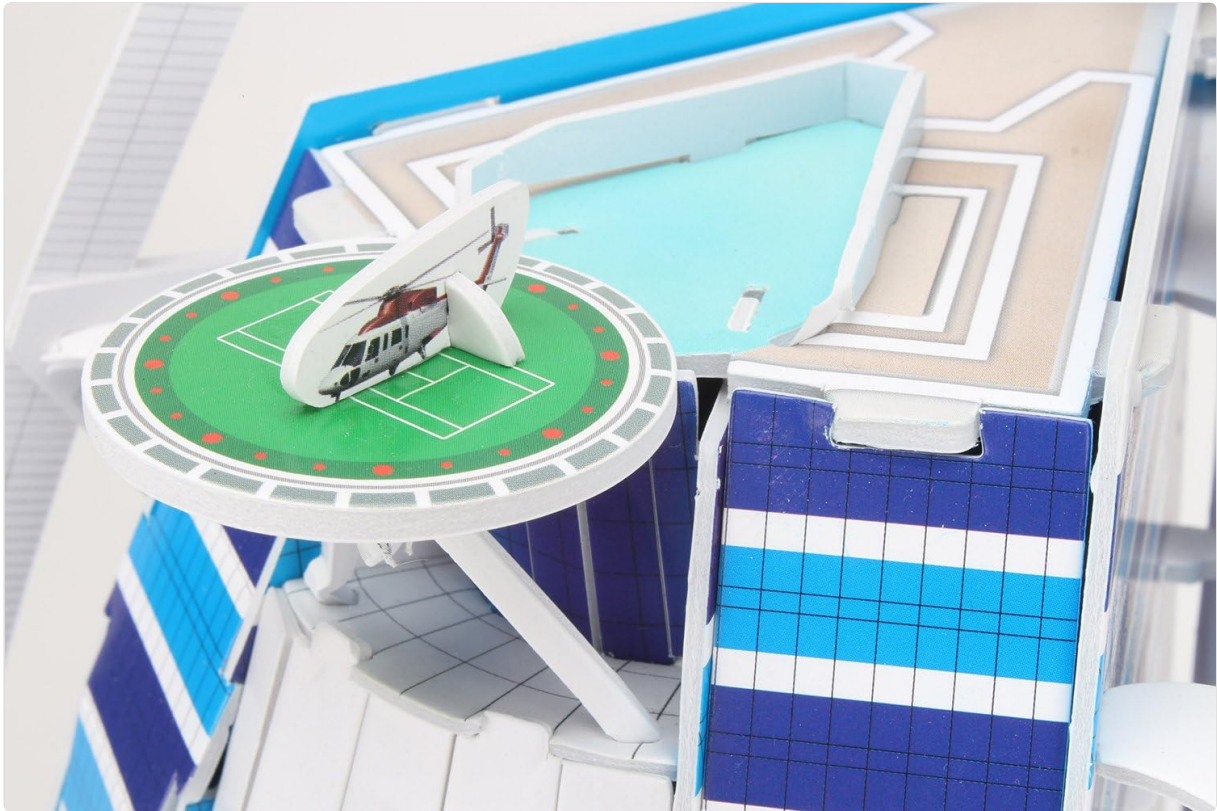
Image: A detailed view of the helipad and the upper sections of the assembled Burj Al Arab 3D puzzle, highlighting the intricate design elements.