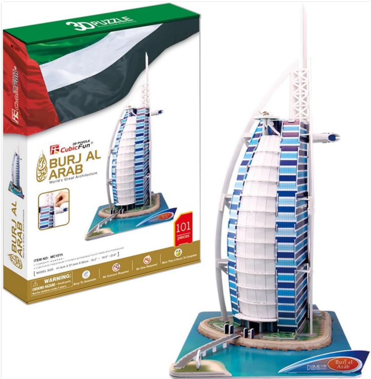
Image: The CubicFun MC101H Dubai Burj Al Arab 3D Puzzle packaging and the fully assembled model, showcasing its intricate design and scale.