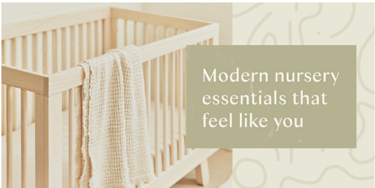
Image: The Babyletto Hudson 3-in-1 Convertible Crib, highlighting its award-winning design, sustainable sourcing, and safety certifications.