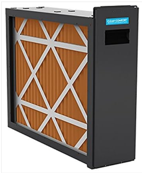
Figure 1: Clean Comfort Whole Home Media Air Cleaner. This image shows the main view of the air cleaner unit, highlighting its robust construction and the pleated MERV 11 filter media.