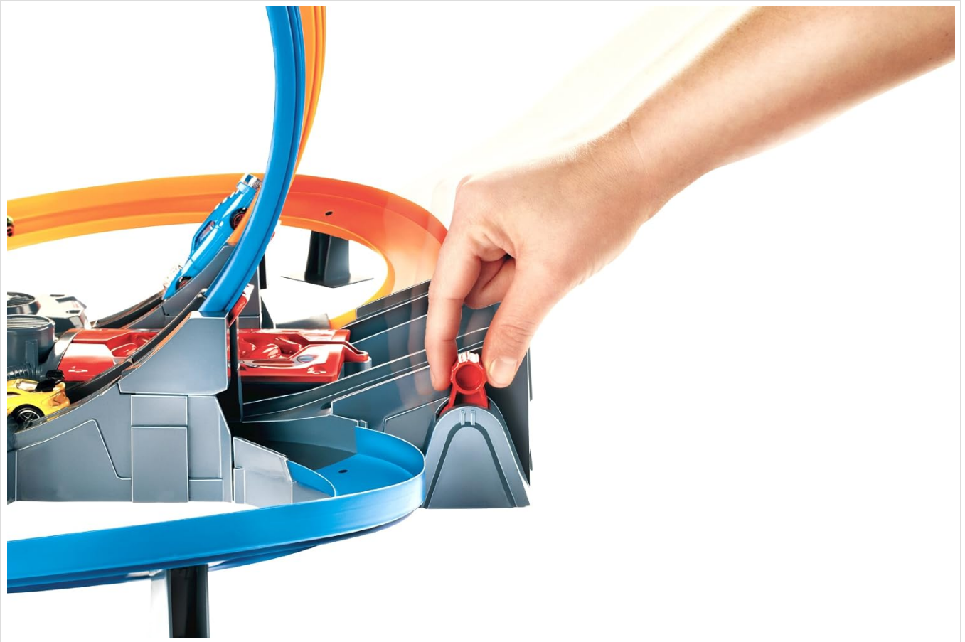
Image: A hand engaging one of the red release levers to send a car onto the track.

The trackset is designed to accommodate up to six cars racing simultaneously for dynamic action.