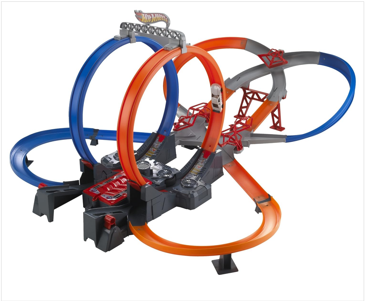
Image: An alternative view of the assembled Hot Wheels Mega Loop Mayhem Trackset, highlighting the interconnected track sections and support structures.