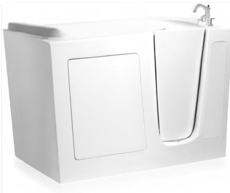
Figure 2: Exterior view of the Ariel EZWT-2651-SOAKER-R Walk-In Bathtub, highlighting its compact and functional design.