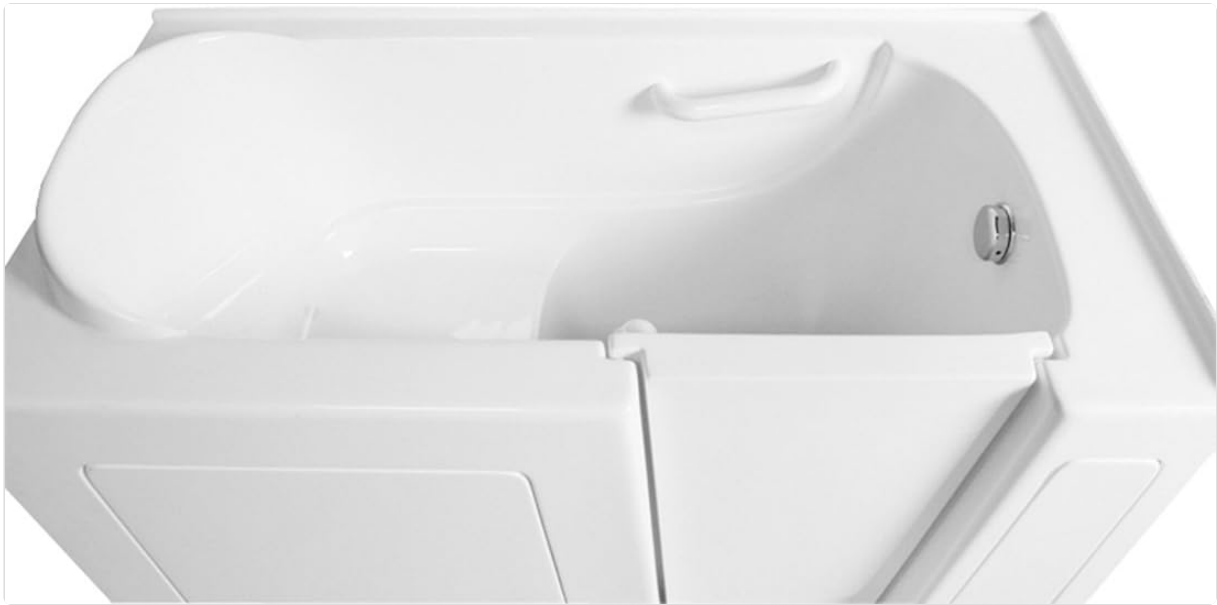
Figure 4: Top-down view of the bathtub, illustrating the door mechanism and interior seating area.