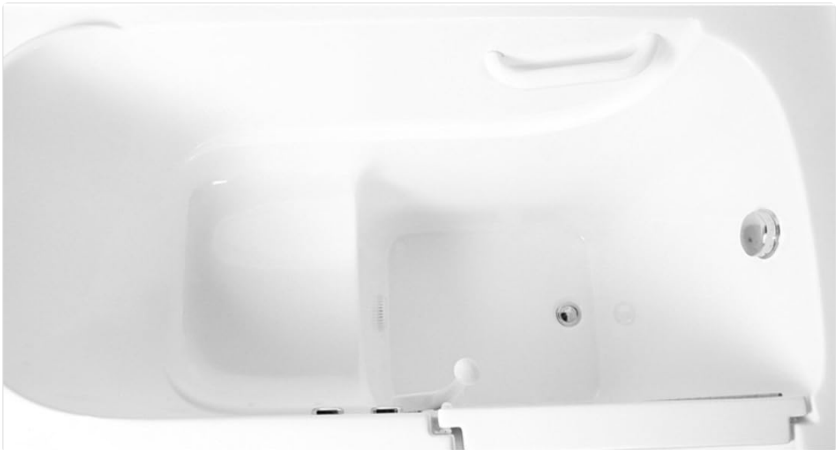
Figure 5: Interior view of the bathtub, showing the seating area, drain, and grab bar.