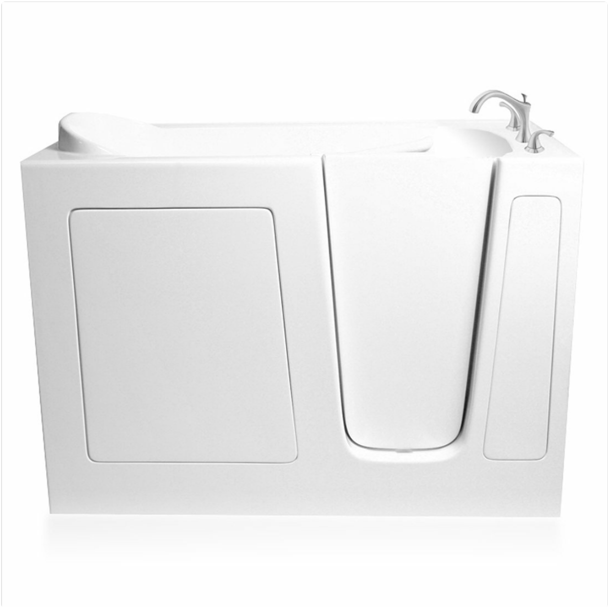
Figure 1: General view of the Ariel EZWT-2651-SOAKER-R Walk-In Bathtub. This image shows the overall design and white finish of the bathtub.