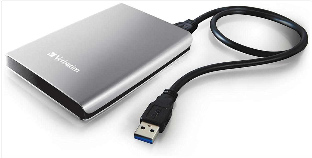
Figure 2: The Verbatim hard drive connected via its USB 3.0 cable.