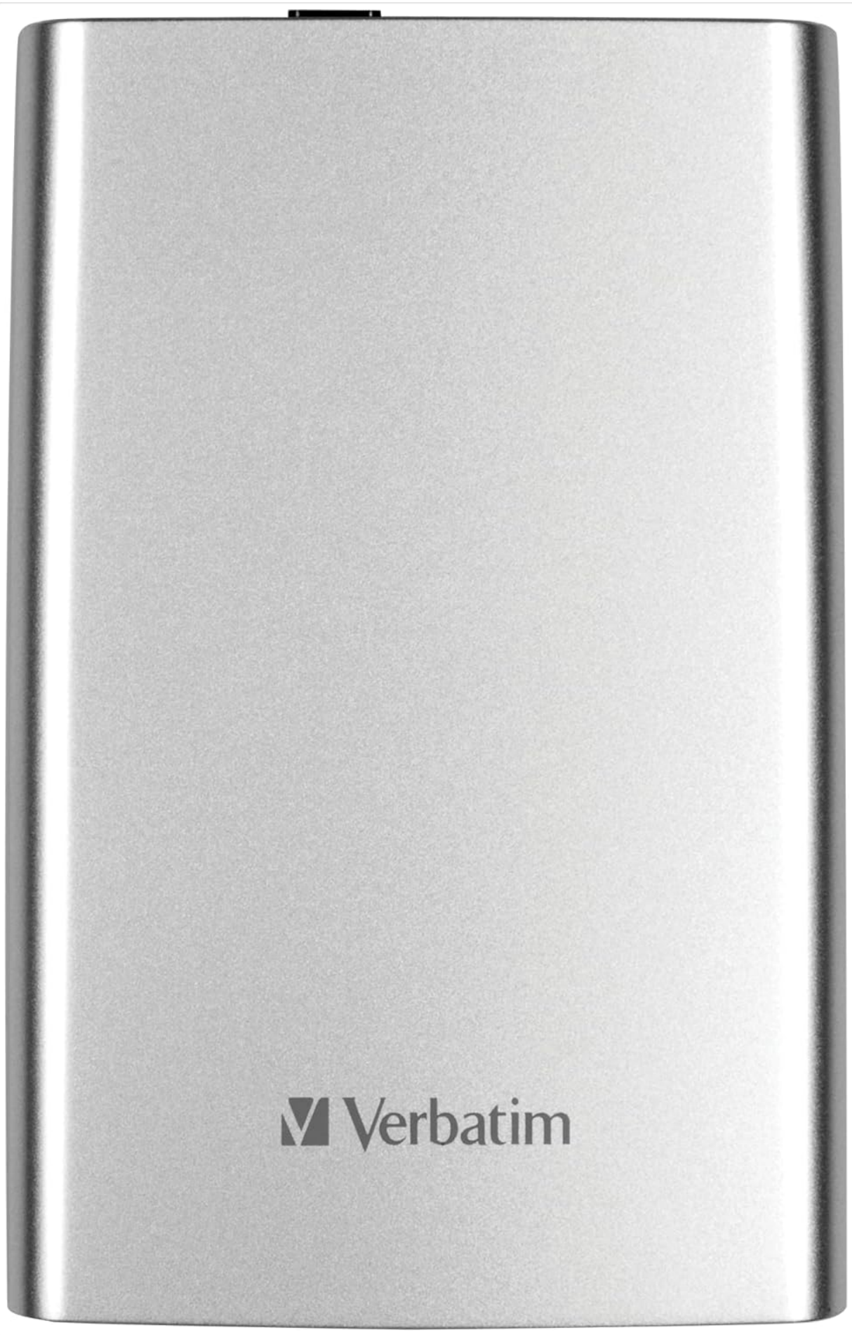
Figure 1: Front view of the Verbatim Store 'n' Go 1TB External Hard Drive in silver.