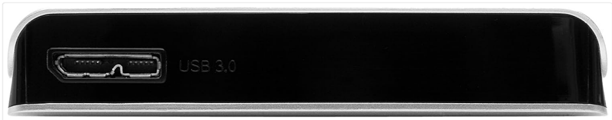
Figure 3: Detail of the USB 3.0 port on the drive.