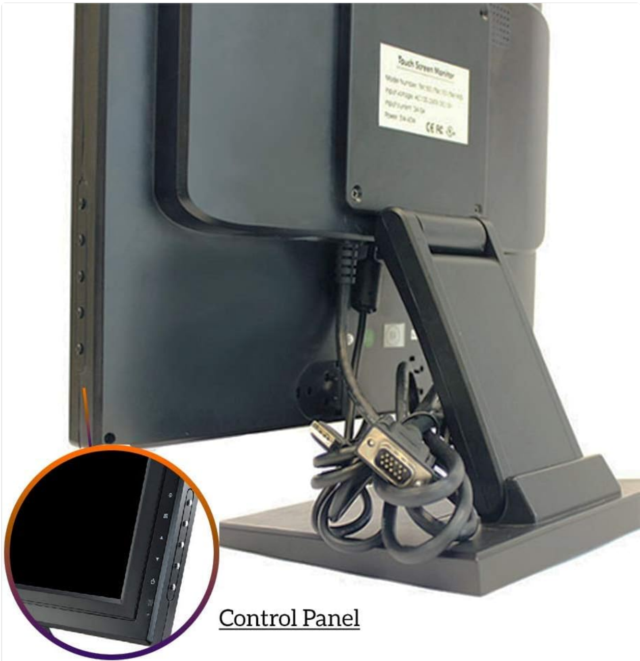
Figure 5.2: Control Panel