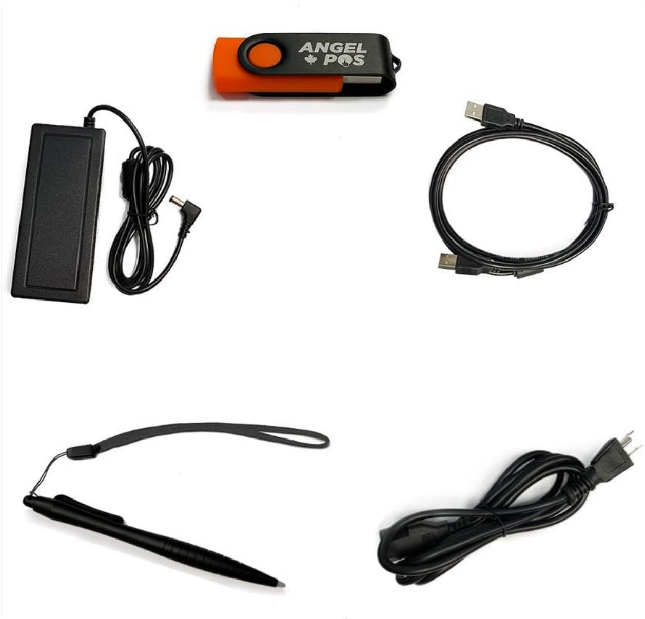
Figure 3.1: Included Accessories