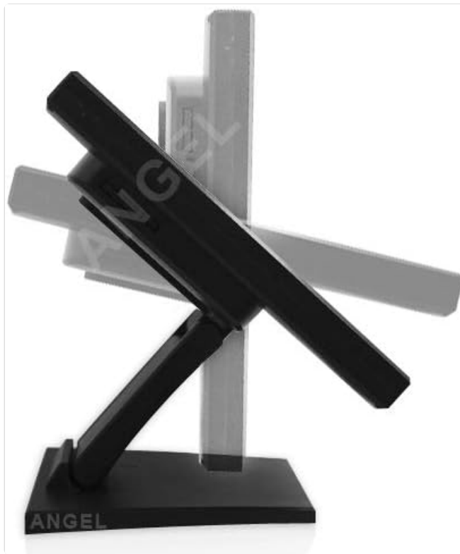
Figure 5.3: Tilt Adjustment