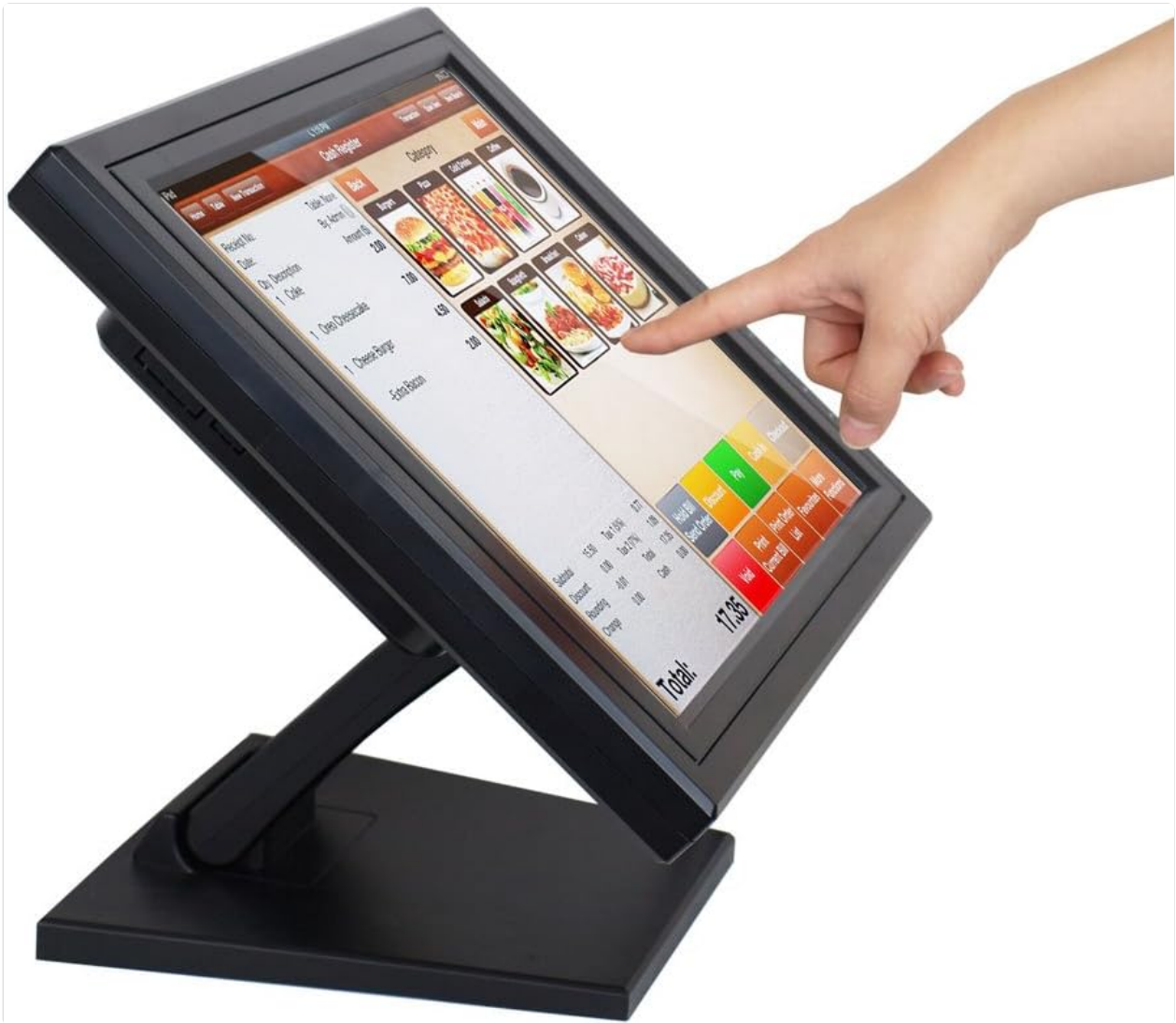
Figure 5.1: Touch Screen in Use

Once the drivers are installed, the monitor will function as a touch input device. You can interact with the screen directly using your finger or the provided stylus pen.