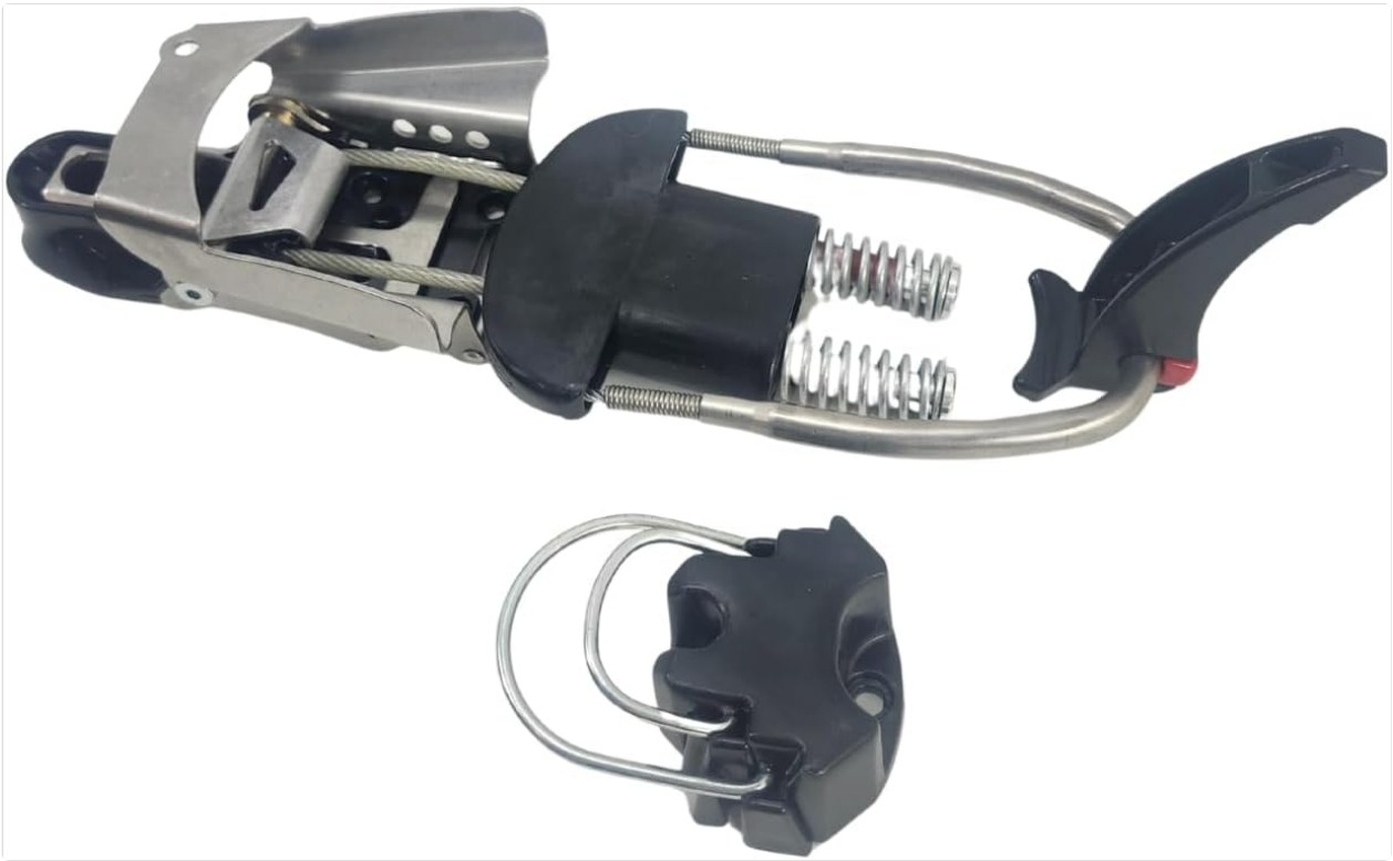
Image: The 22 Designs Axl Telemark Binding disassembled, displaying the main toe and cable unit alongside the separate heel piece. This illustrates the primary components involved in mounting.