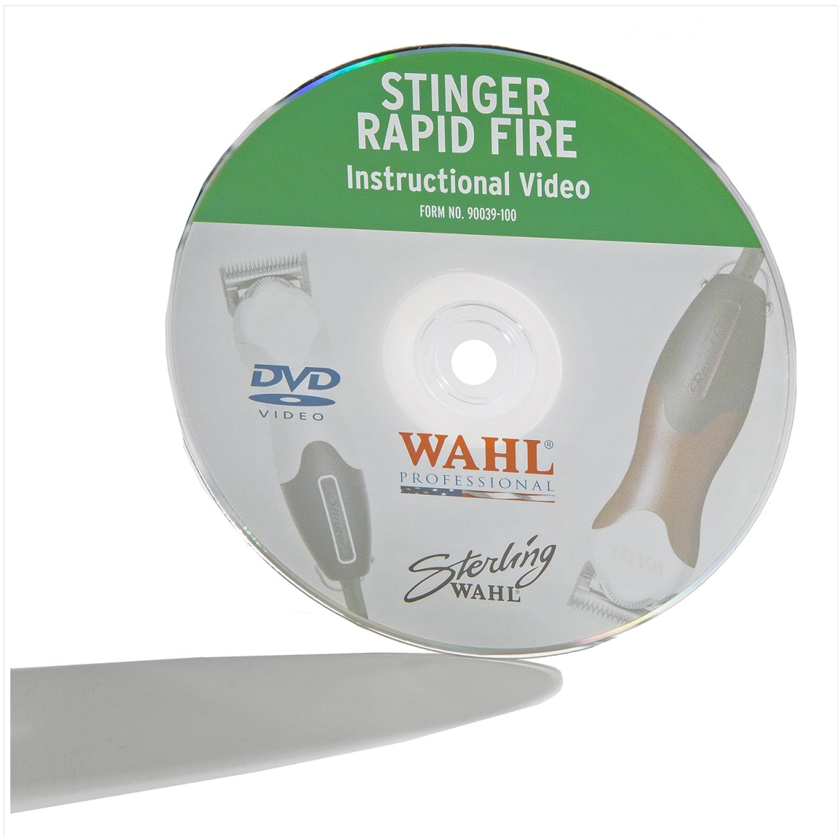
Figure 7: The instructional DVD included with the clipper, offering comprehensive guidance on its use and maintenance.