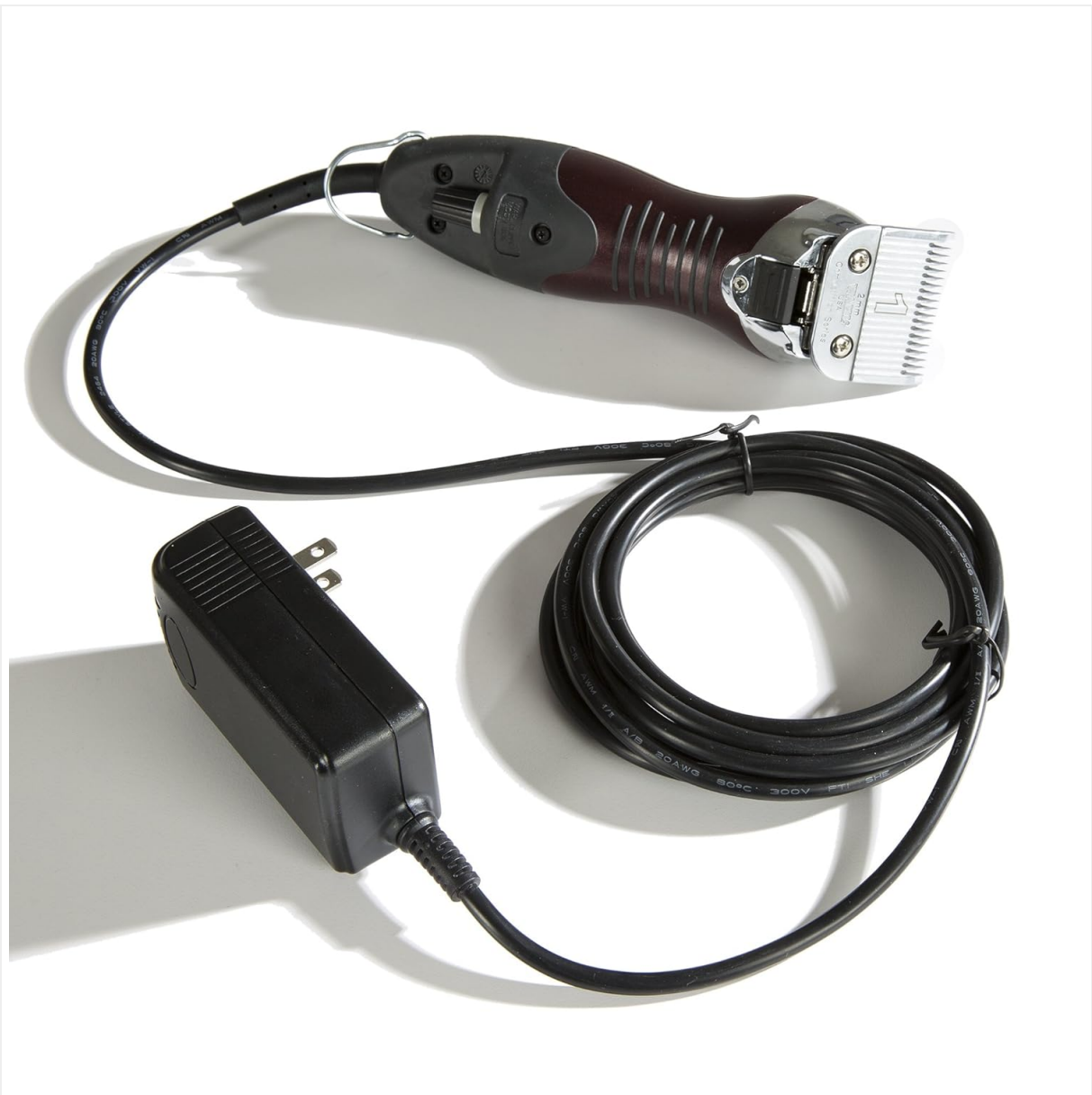
Figure 4: The Wahl 5 Star Rapid Fire Clipper shown with its power adapter, ready for connection to an electrical outlet.