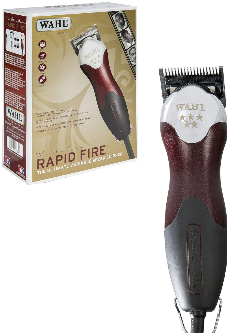
Figure 1: Wahl 5 Star Rapid Fire Clipper and its retail packaging, showcasing the product's design and branding.