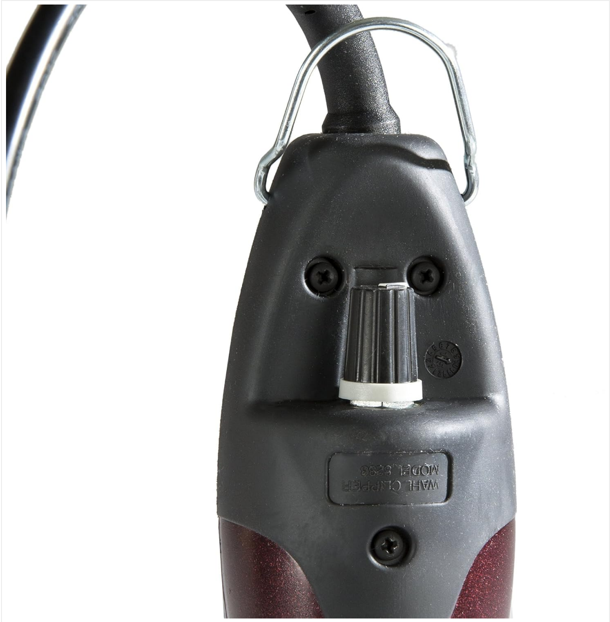
Figure 6: A detailed view of the variable speed dial, allowing users to adjust the motor speed between 1800 and 4600 RPM.