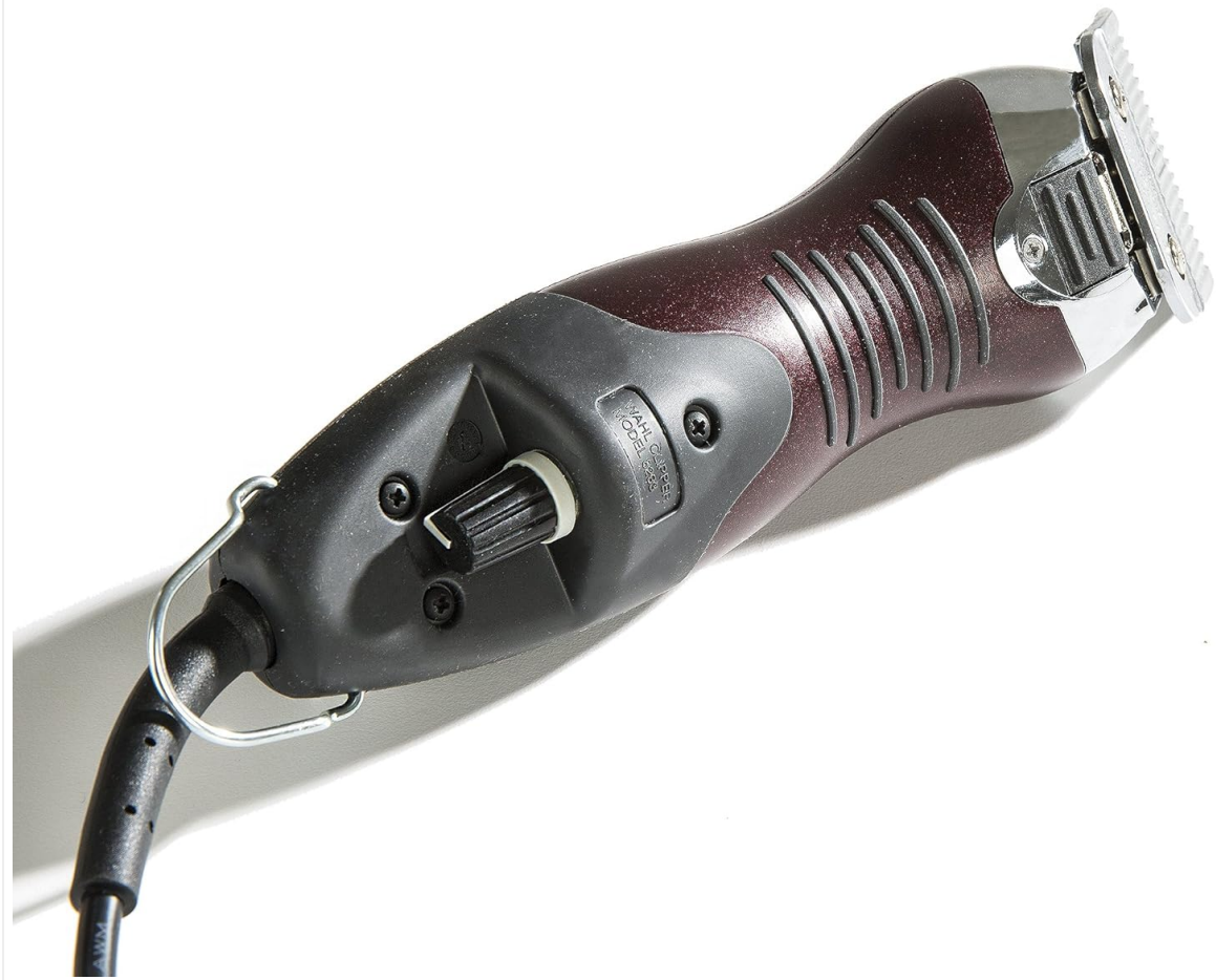
Figure 5: Side view of the clipper, highlighting the ergonomic design and the variable speed dial for precise control.