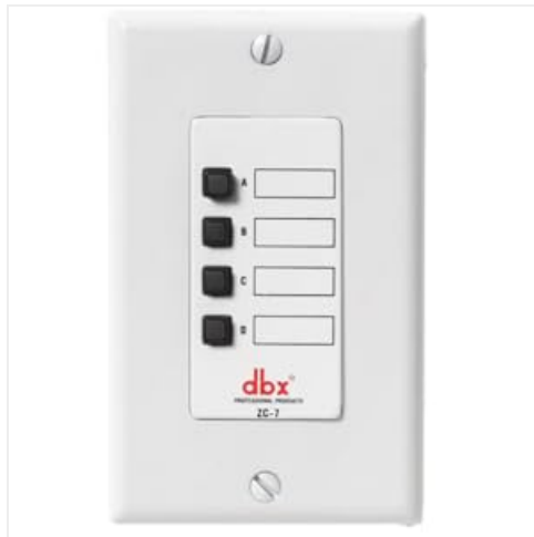
Figure 1: Front view of the dbx ZC-7 Wall-Mounted Zone Controller. This image shows the faceplate with four push buttons and a small LED indicator next to each, designed for page assignment.

this purpose. Ensure the cable run does not exceed 1000 feet to maintain signal integrity.