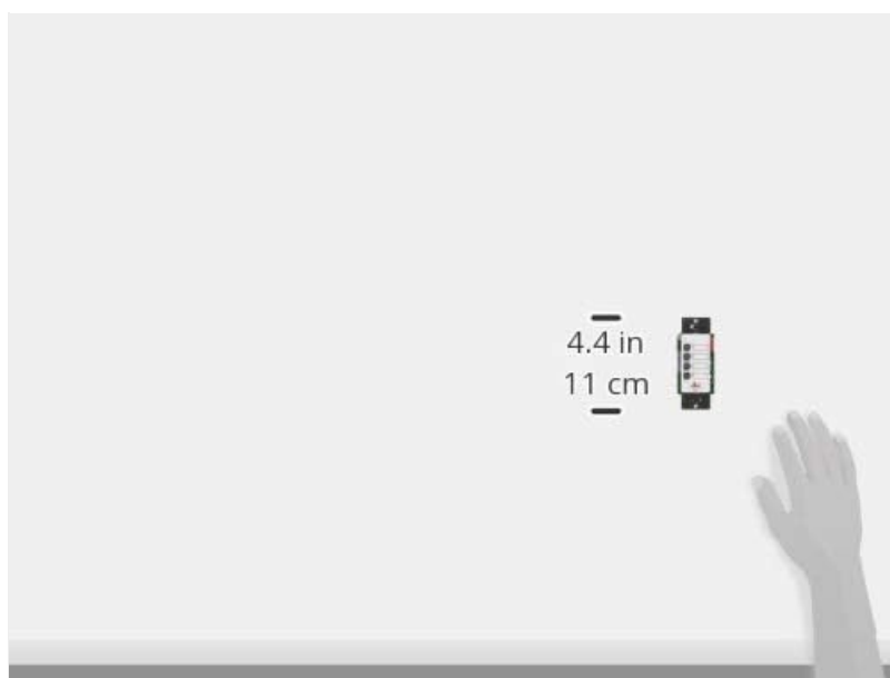
Figure 3: An illustration showing the dimensions of a dbx zone controller, indicating a width of 4.4 inches (11 cm).