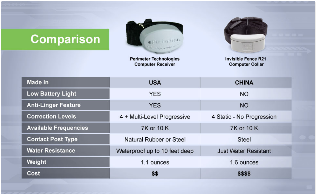
A comparison table detailing features and compatibility between Perimeter Technologies and Invisible Fence R21 collars.