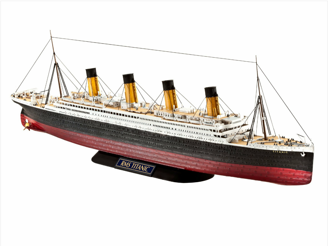
Image: A fully assembled Revell RMS Titanic model, viewed from an elevated side angle, highlighting the overall structure and details.