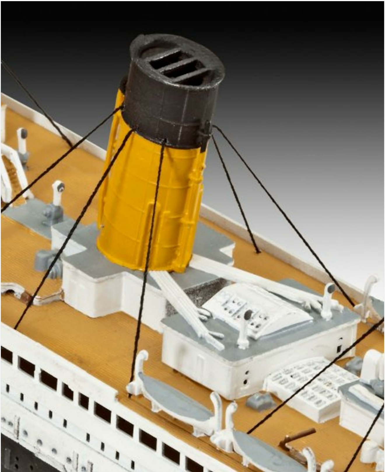
Image: A close-up view of one of the golden-topped funnels on the Revell RMS Titanic model, with rigging lines attached, illustrating the detail.