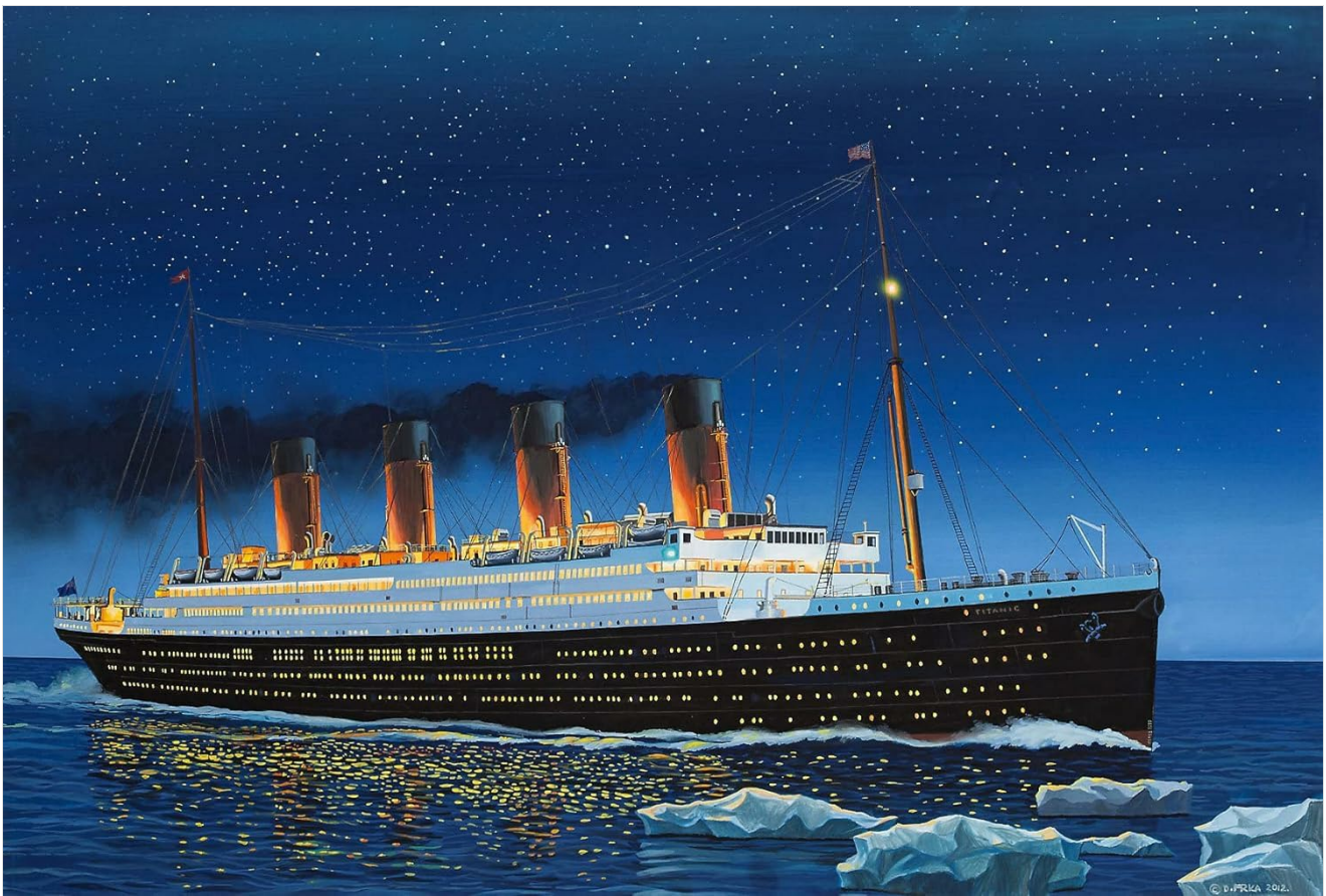
Image: A detailed illustration of the RMS Titanic sailing at night, with icebergs in the foreground, providing a visual reference for the model's appearance.