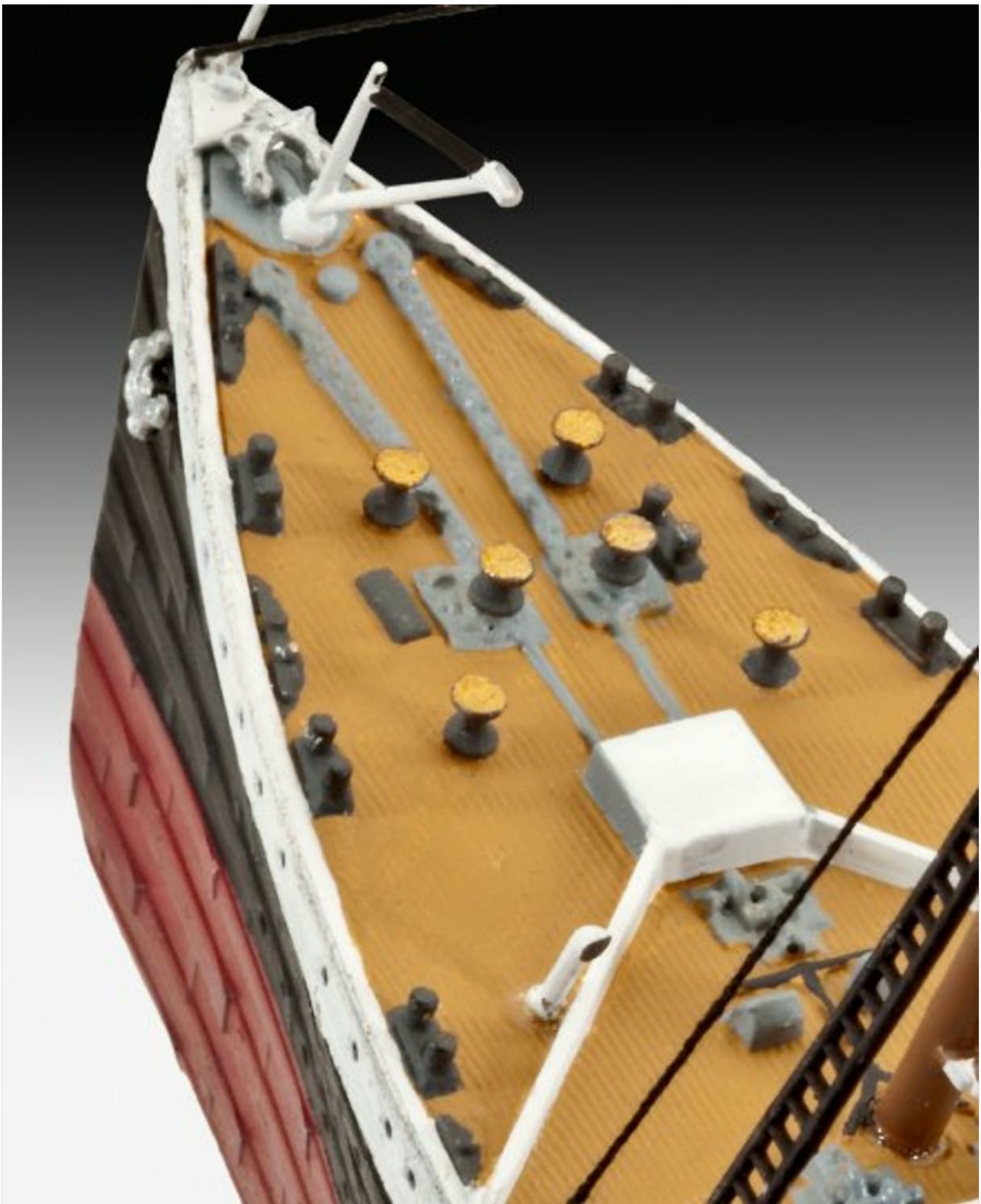
Image: A detailed close-up of the deck of the Revell RMS Titanic model, showing the intricate planking texture and various deck fittings.