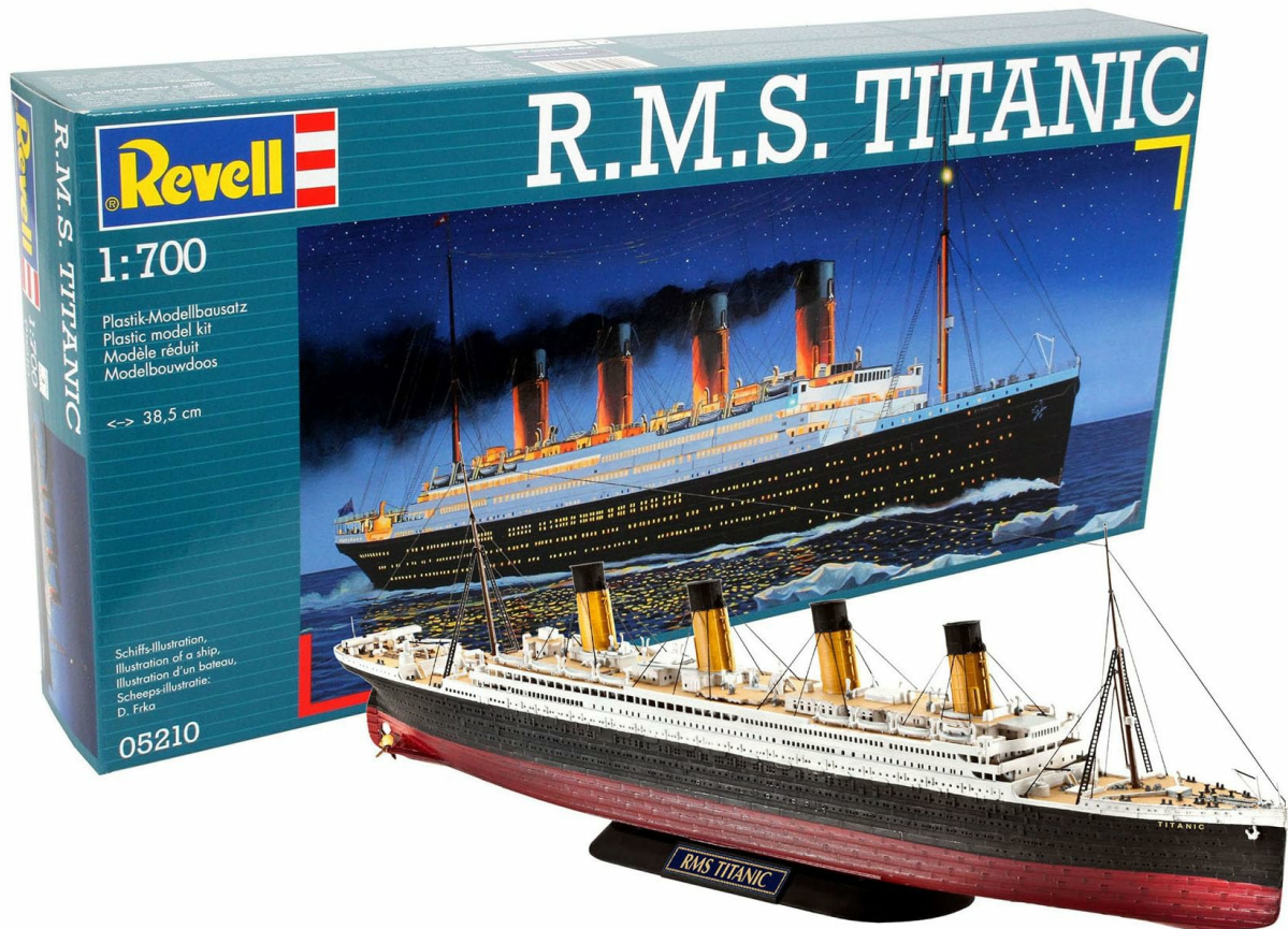
Image: The Revell RMS Titanic Plastic Model Kit box alongside a fully assembled and painted model, showcasing the kit's contents and final appearance.