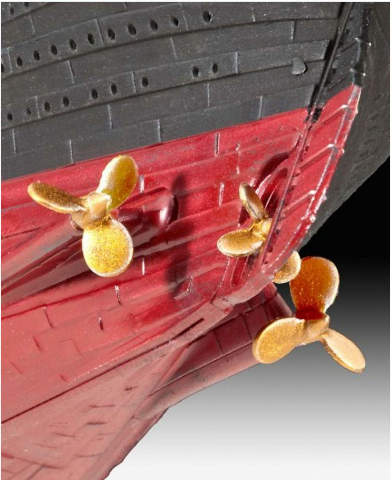
Image: A close-up view of the three golden propellers attached to the stern of the Revell RMS Titanic model, showing their detailed design.