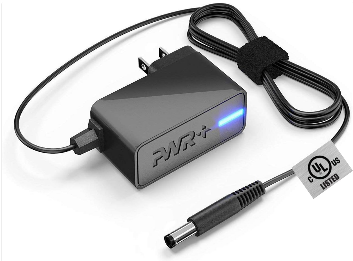
Figure 1: The PWR+ AC power adapter with its coiled cord and blue LED indicator. This adapter is designed for various Yamaha keyboard models.