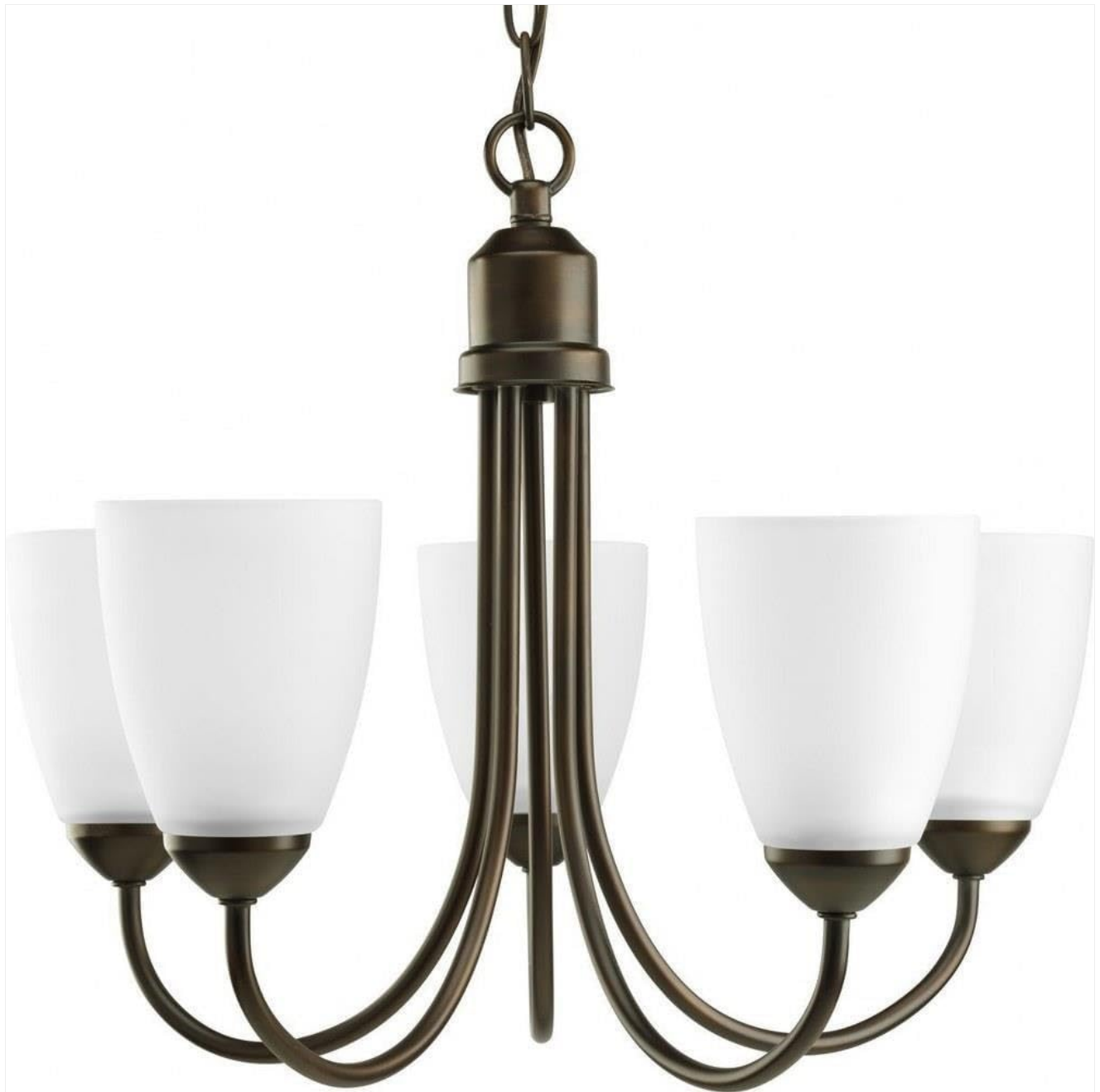
Figure 1: Progress Lighting P4441-20 Gather Chandelier, Antique Bronze. This image displays the chandelier's five-light design with antique bronze finish and white etched glass shades.