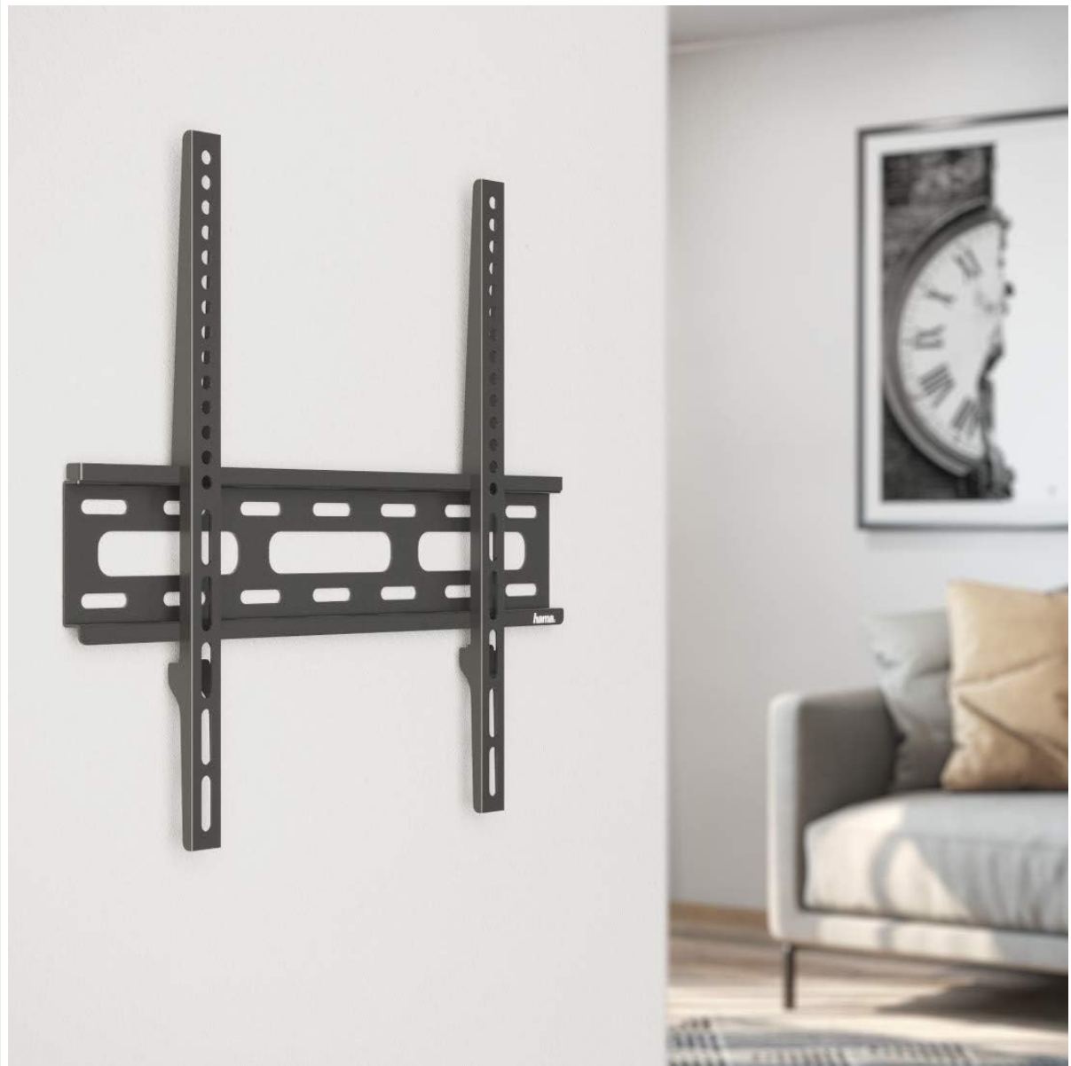
Figure 4.1: The wall plate securely mounted to the wall, ready for the TV. Note the slim profile of the mount.