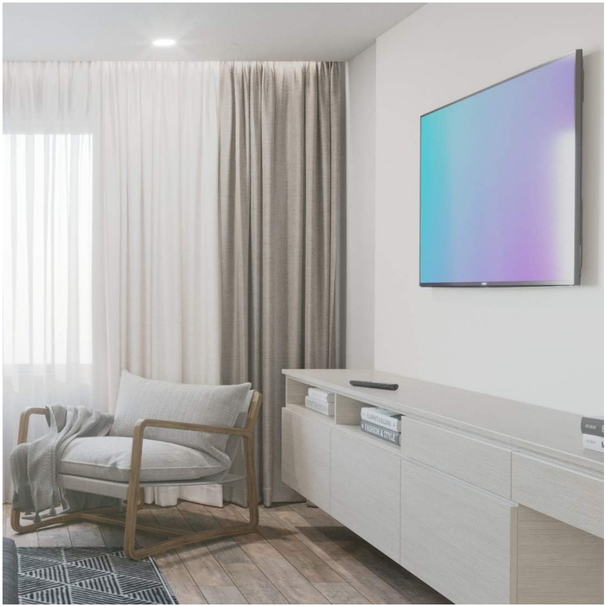
Figure 4.2: A television successfully mounted on the wall using the Hama fixed wall mount, viewed from the front.