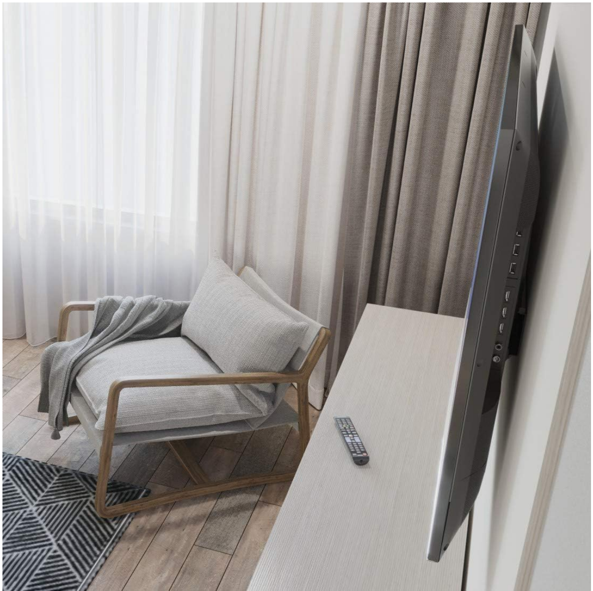
Figure 4.3: Side view illustrating the minimal distance between the TV and the wall, highlighting the slim design of the Hama fixed mount.