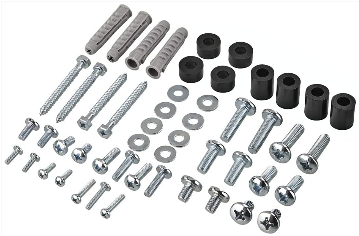
Figure 3.1: Included mounting hardware kit. This kit contains various screws, washers, spacers, and wall anchors suitable for different TV models and wall types.