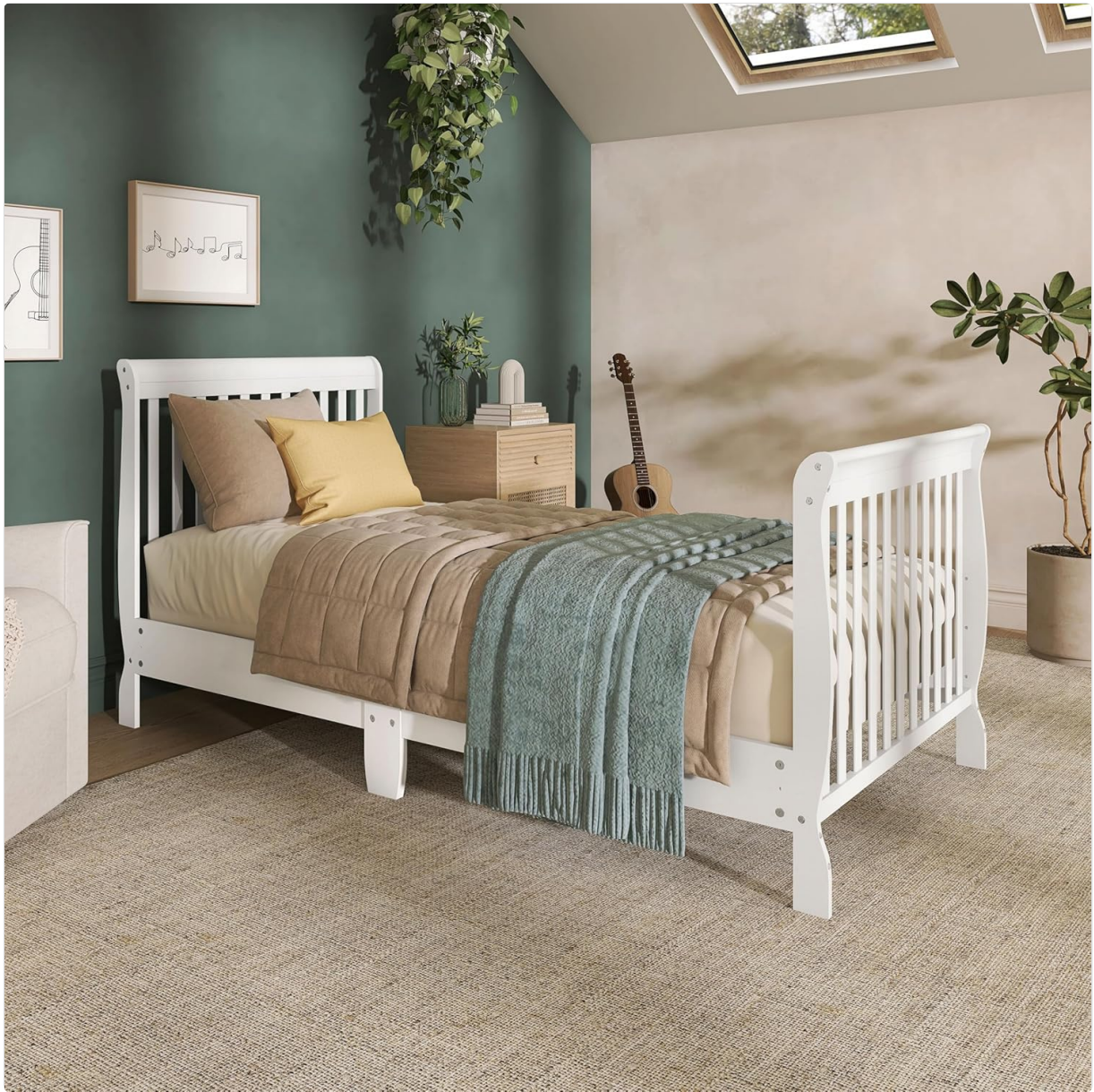
Image: The Dream On Me Aden Mini Crib converted into a twin-size bed, complete with mattress, pillows, and blankets.