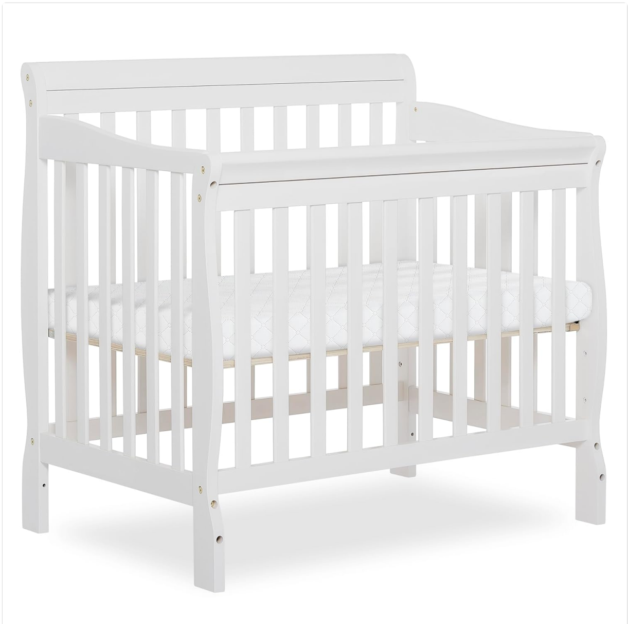
Image: The Dream On Me Aden 4-in-1 Convertible Mini Baby Crib, fully assembled in white.