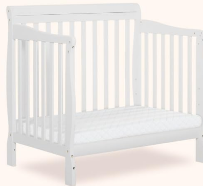
Daybed/ kids sofa