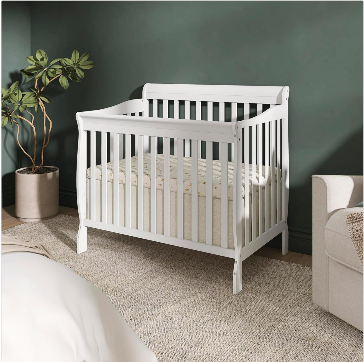
Image: The Dream On Me Aden Mini Crib in a white finish, positioned in a nursery with a plant and armchair.

This is the primary mode for infants. The compact design is suitable for smaller spaces such as apartments, condos, or shared rooms.