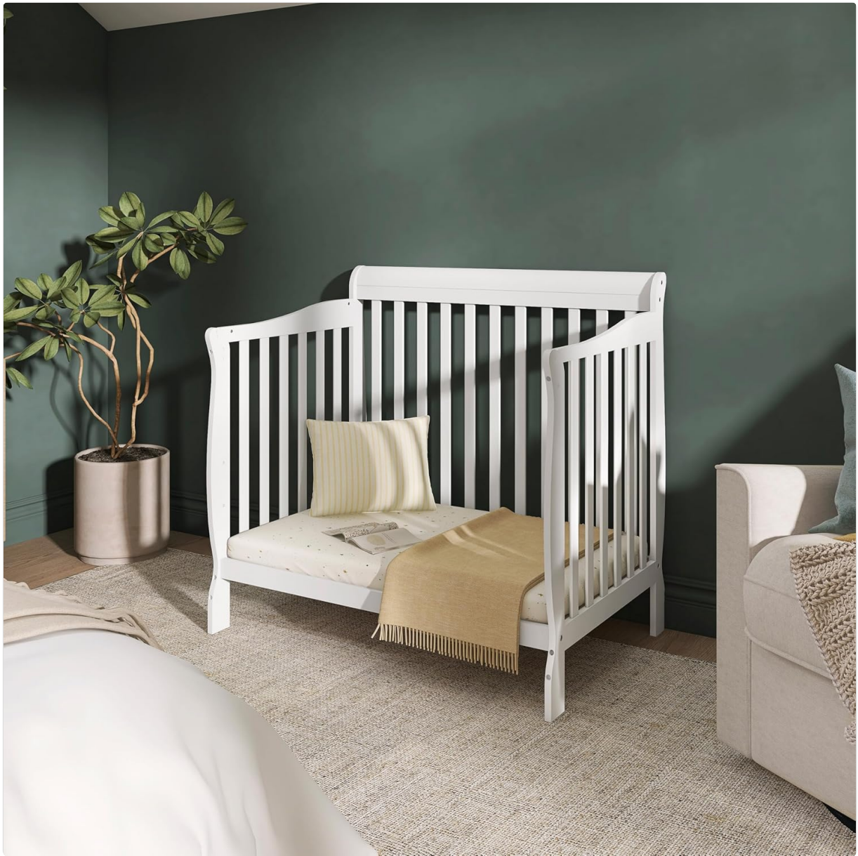
Image: The Dream On Me Aden Mini Crib converted into a mini daybed, with one side removed and a pillow and blanket inside.