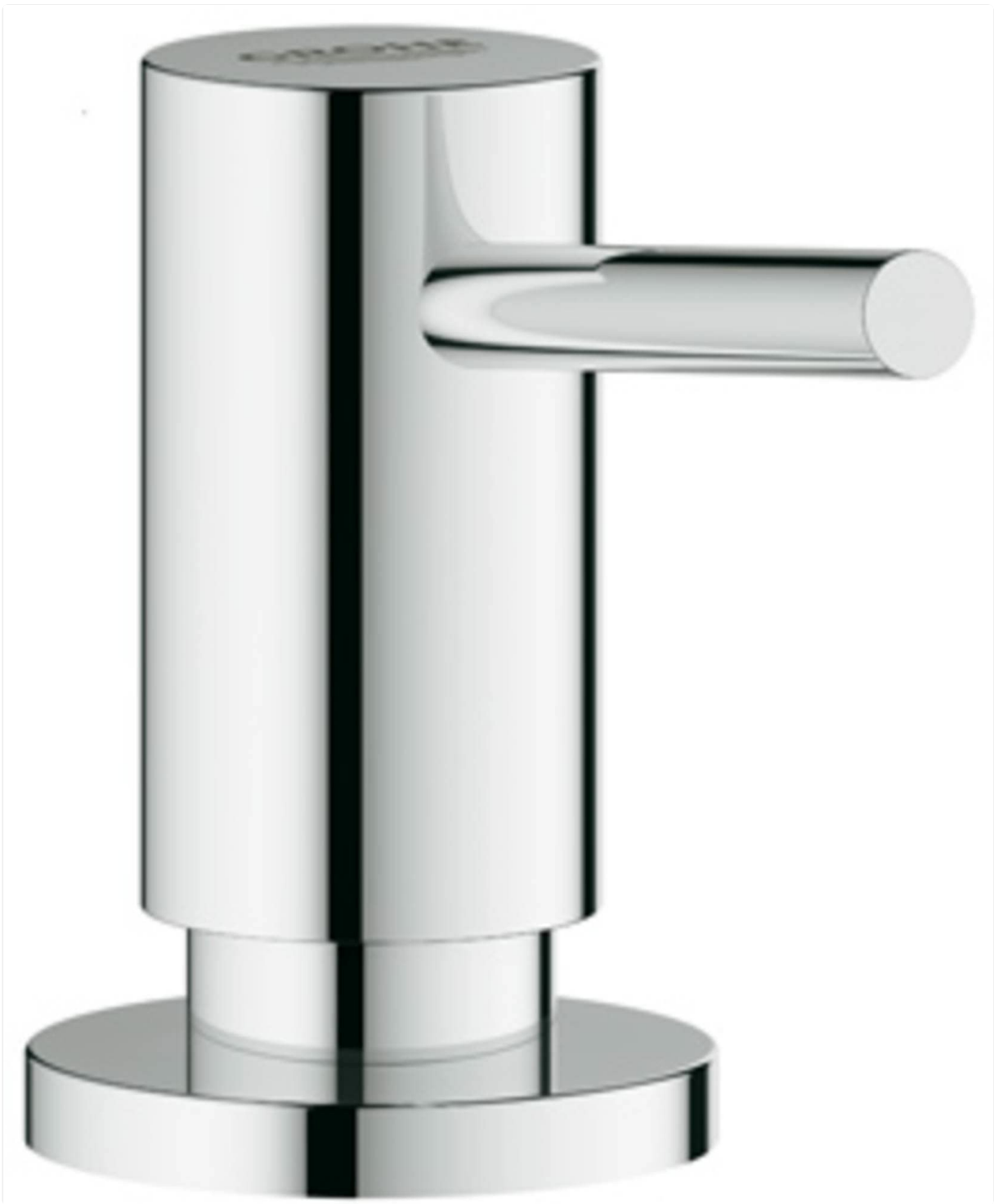
Image: The GROHE Cosmopolitan Soap/Lotion Dispenser in Starlight Chrome, showcasing its sleek design.