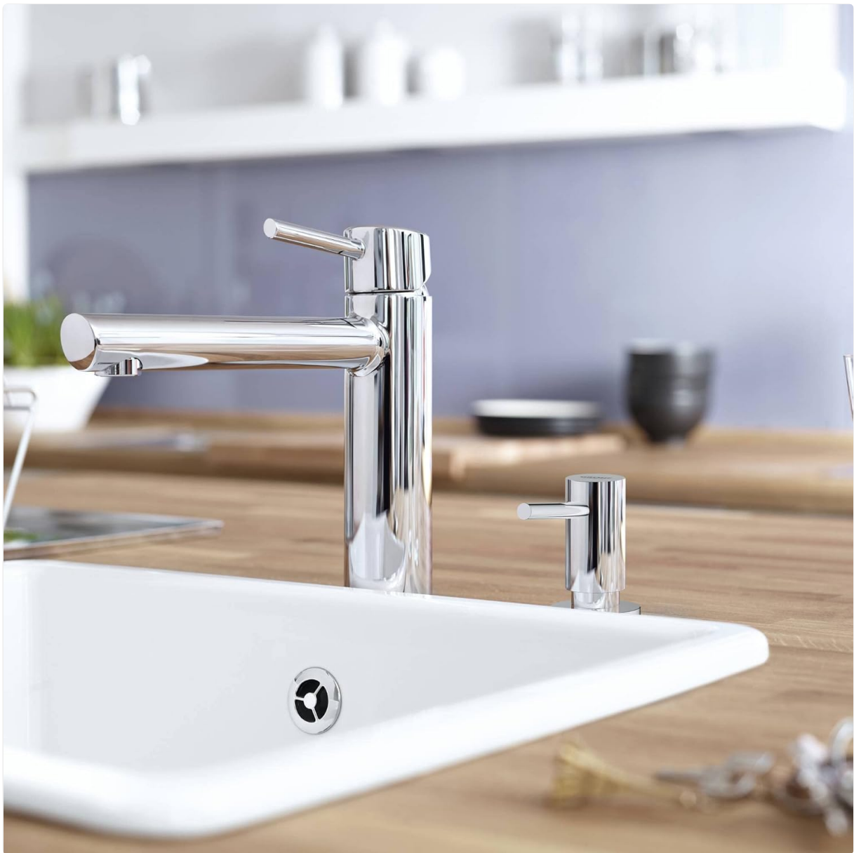
Image: The dispenser shown installed on a kitchen countertop next to a matching faucet, demonstrating typical placement.