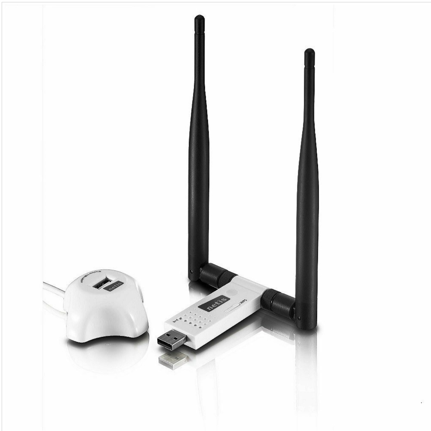
Figure 4.1: Netis WF-2116 USB Adapter, antennas, and USB cradle.

The Netis WF-2116 is a high-gain wireless USB adapter designed to improve your computer's Wi-Fi reception. It features two external 5dBi antennas for extended range and a USB 2.0 cradle for flexible placement.