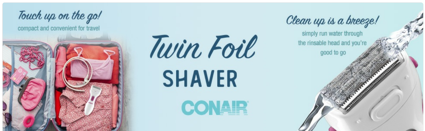
Image: Demonstrates the ease of cleaning the shaver by rinsing the head under water, and its compact size suitable for travel.