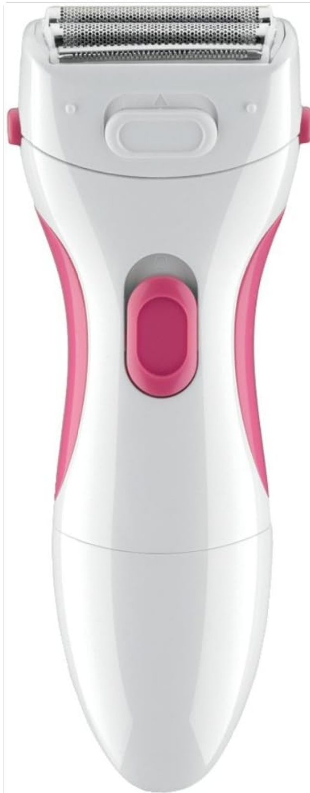
Image: Front view of the Conair Satiny Smooth Ladies Twin Foil Shaver, highlighting its white and pink design with the dual foil head.