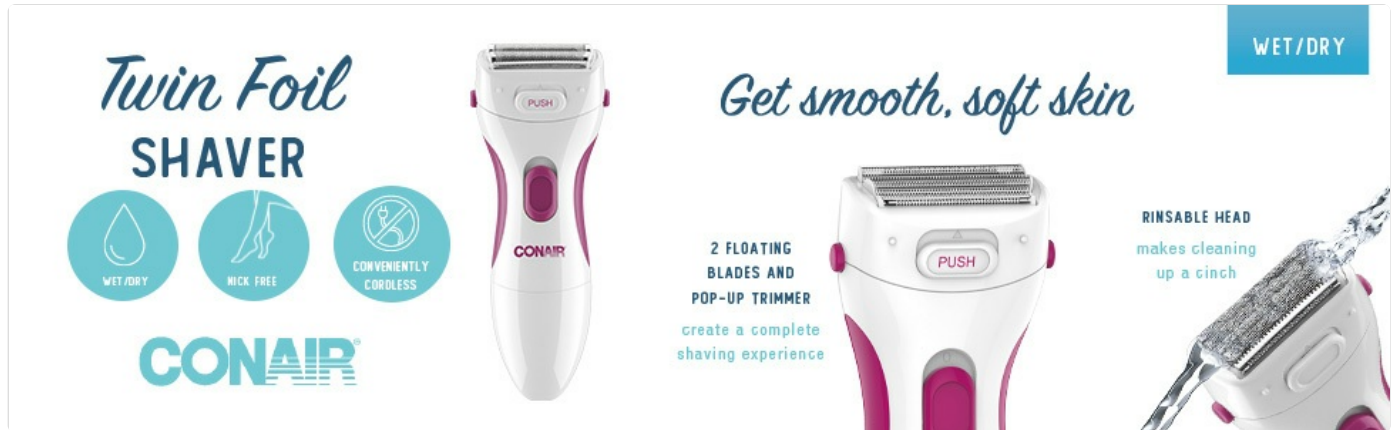
Image: Illustration of the shaver's features, including the two floating blades for a complete shaving experience and the rinseable head for easy cleaning.