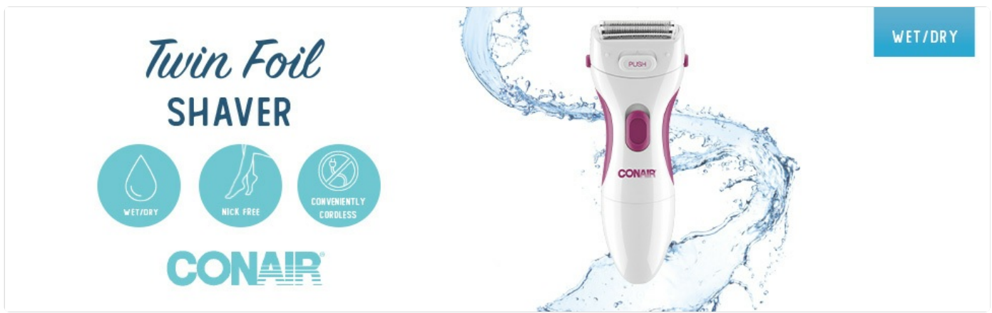
Image: Graphic illustrating key features of the Twin Foil Shaver: Wet/Dry capability, Nick-Free shaving, and Conveniently Cordless operation.