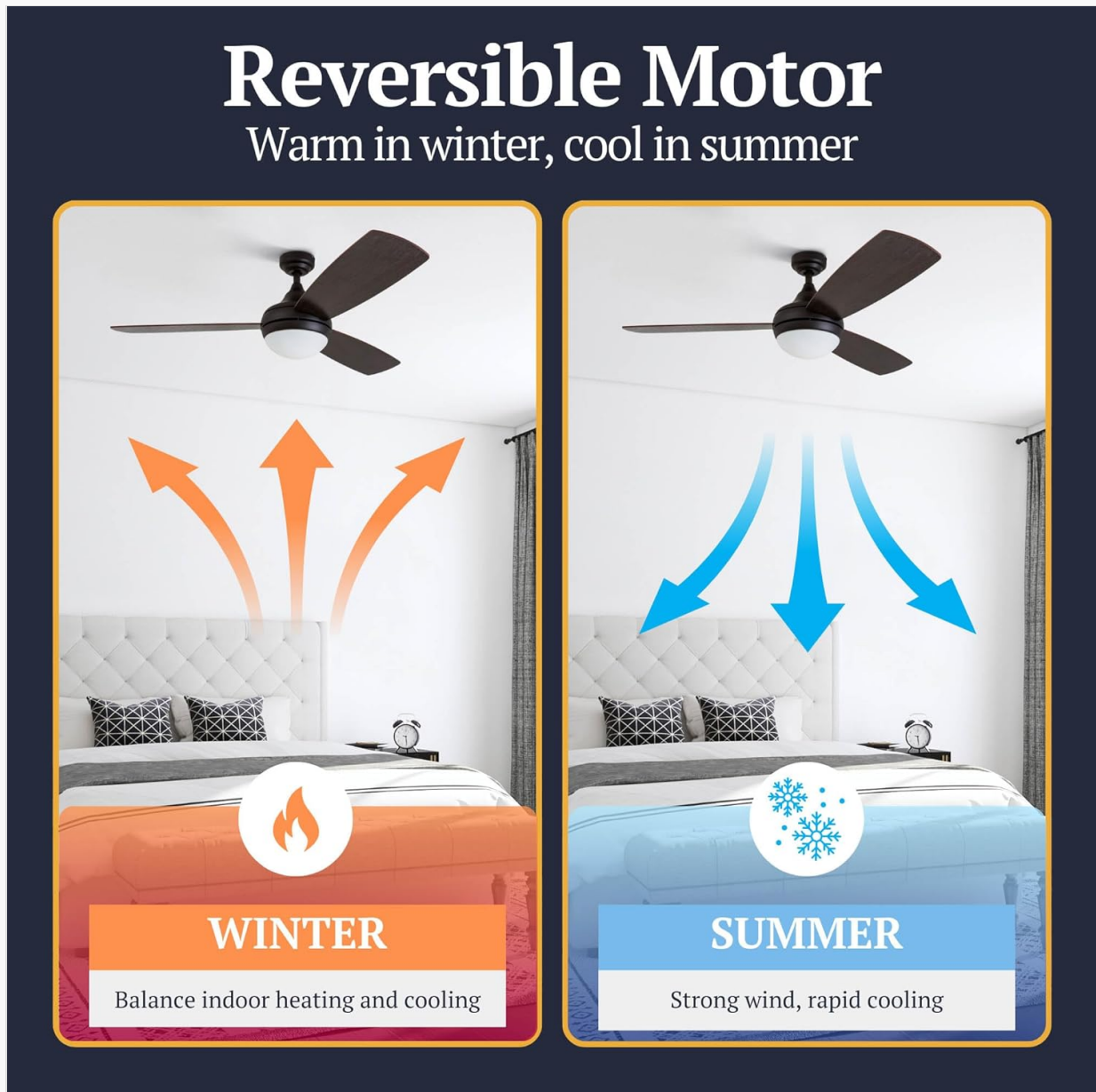
Image: Illustration of the reversible motor function, demonstrating how the fan circulates air upwards in winter to balance heating and downwards in summer for rapid cooling.

To reverse the motor direction, locate the reverse switch on the fan motor housing (usually above the light kit) and slide it to the desired position. Ensure the fan is off before changing the direction.