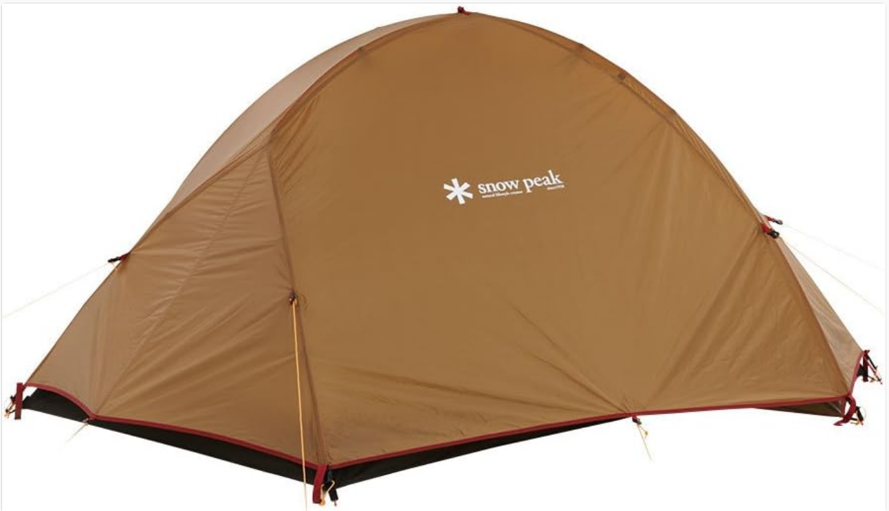
Image: Fully assembled tent with flysheet.