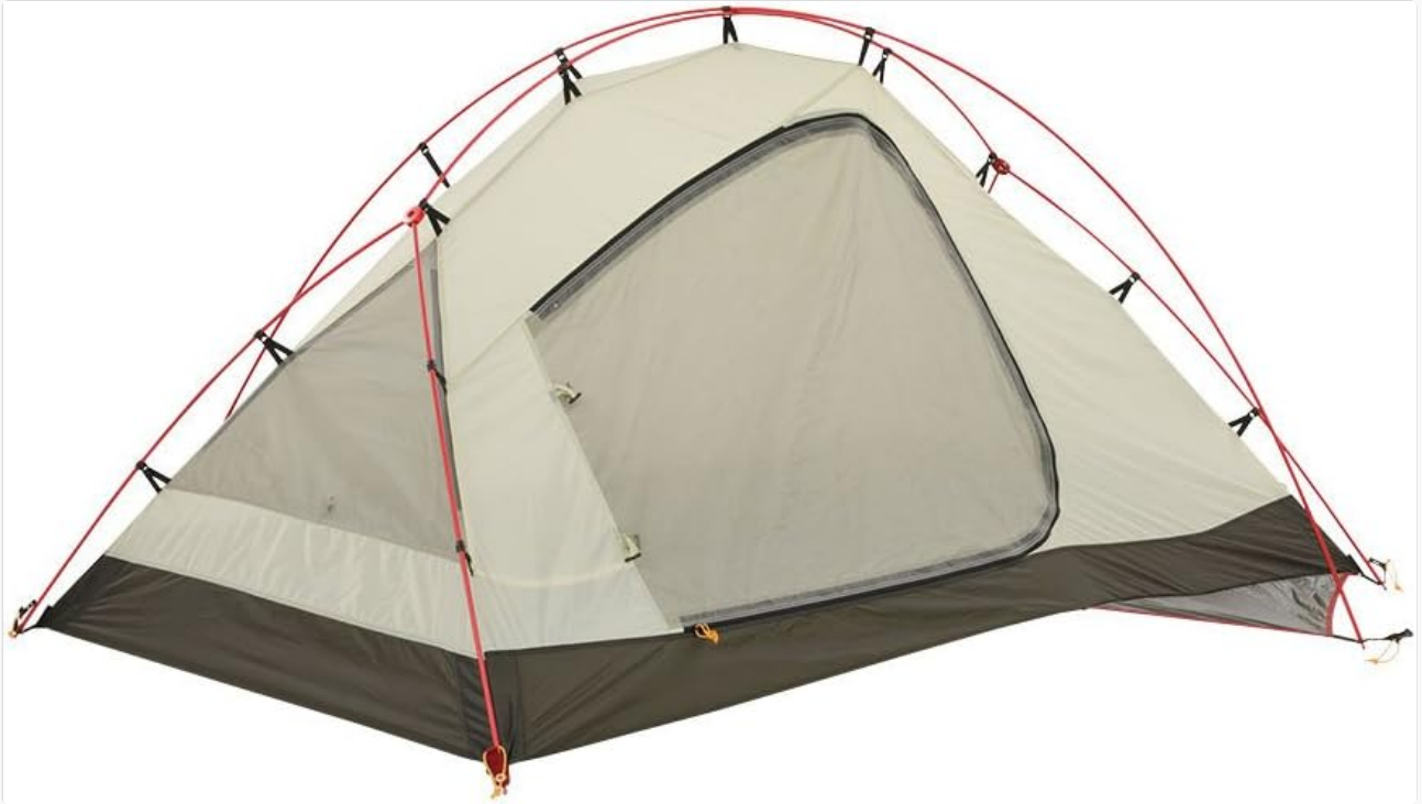
Image: Inner tent with poles partially assembled.