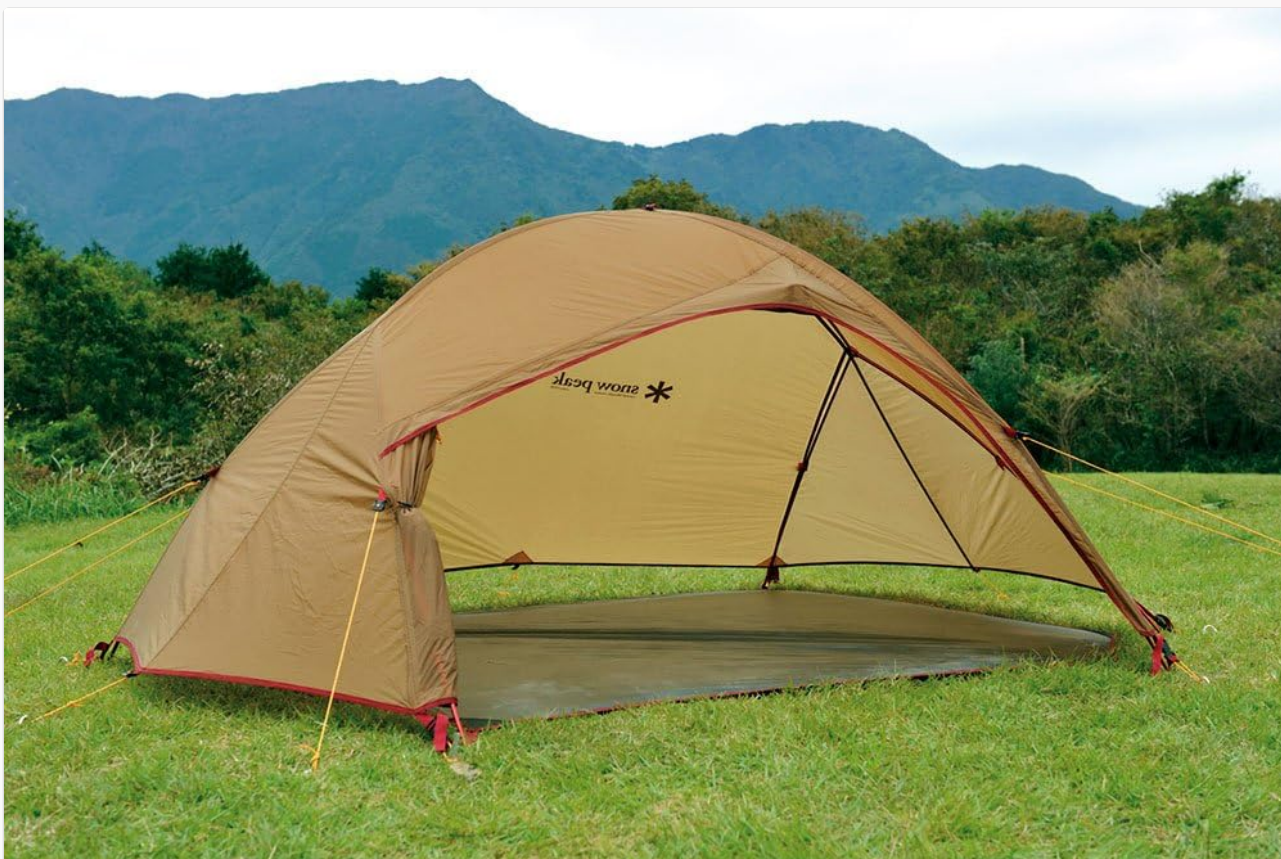
Image: Tent configured as a shelter, without the inner tent.