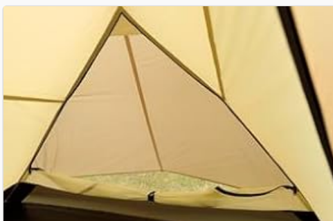
Image: Detail of the tent's mesh panel for ventilation.