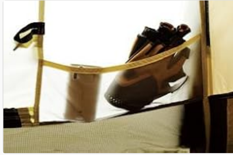
Image: Convenient mesh pocket inside the inner tent.