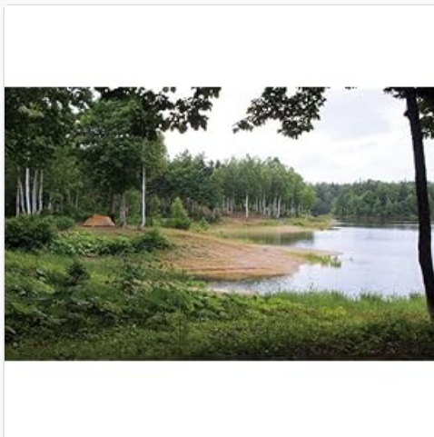
Image: The Snow Peak Landbreeze Duo Tent, representing the brand's tent heritage.

The most distinctive feature is its freestanding capability with just the frame and ground sheet. Even without the inner tent, covering it with the flysheet creates a compact and charming mini-shelter. It is sure to be useful in various scenarios, such as day camps, outdoor festivals when shade is needed, or beach outings. An all-rounder you'll find yourself choosing repeatedly.