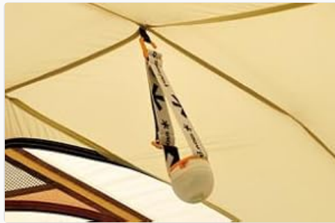
Image: Loop for hanging a lantern inside the tent.