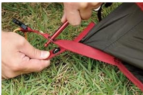
Image: Detail of grommet fixing for tent poles.