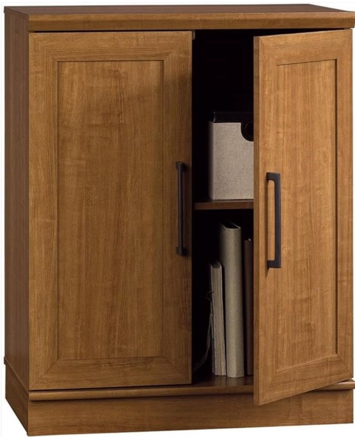
Figure 2: Interior view of the cabinet with an adjustable shelf.