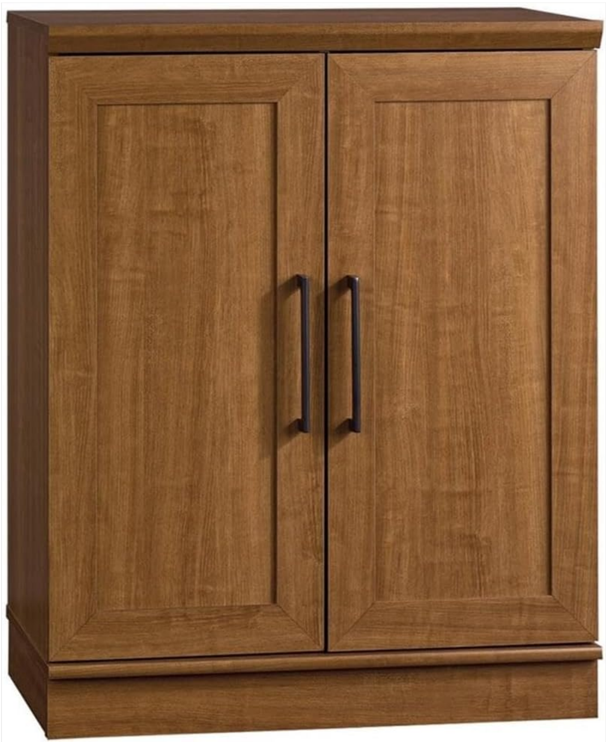
Figure 1: Front view of the Sauder HomePlus Base Cabinet.