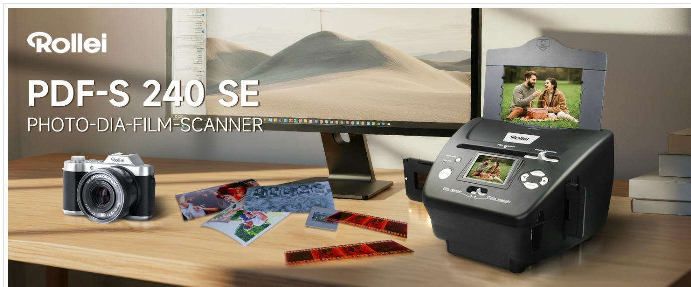
Illustration of the scanner's 4-in-1 capabilities, including 135 film, 35mm slides, name cards, and postcards.