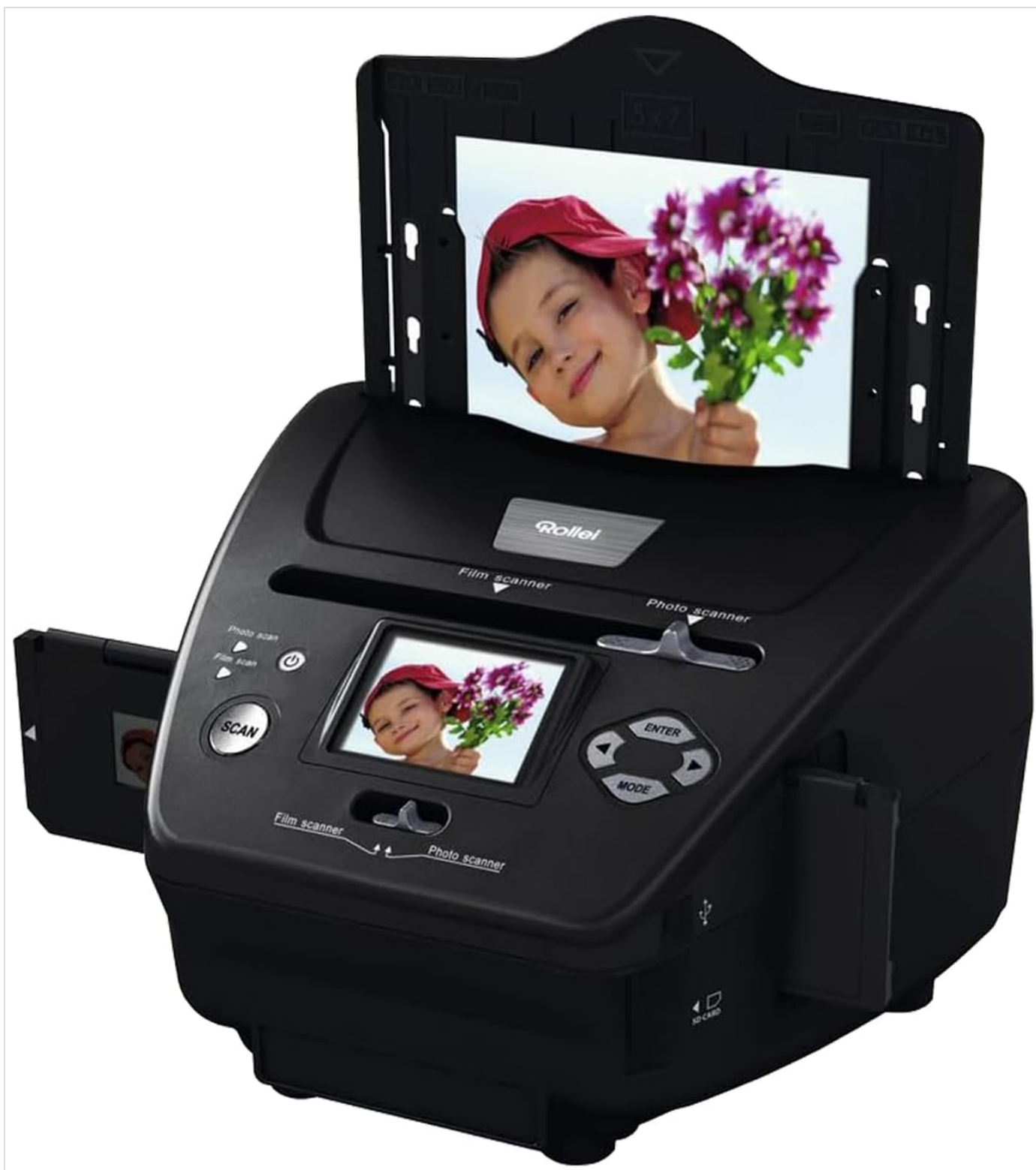
The Rollei PDF S 240 SE Multiscanner, a compact device for digitizing various media.