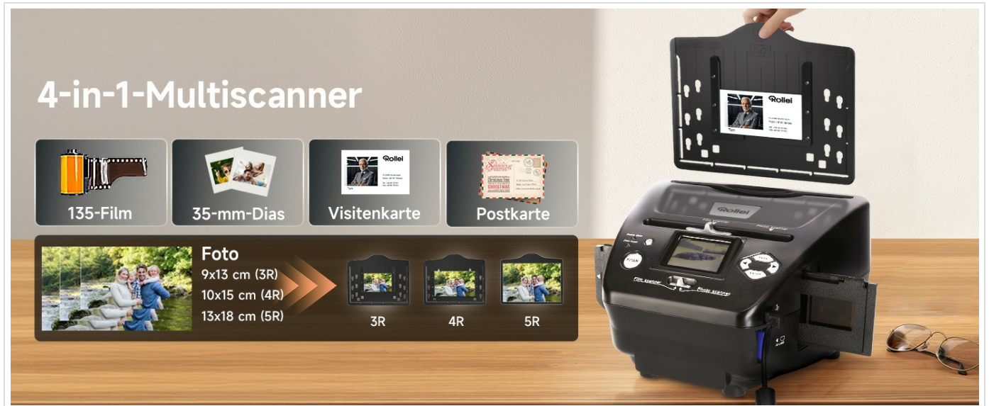
Visual guide for film scanning, showing the negative and slide holders and their insertion into the scanner.