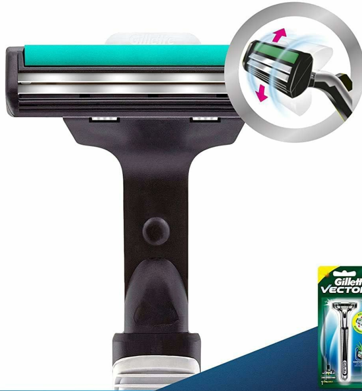
Figure 1: The automatic pivoting head of the Gillette Vector Plus Razor adjusts to facial contours for a safe shave.