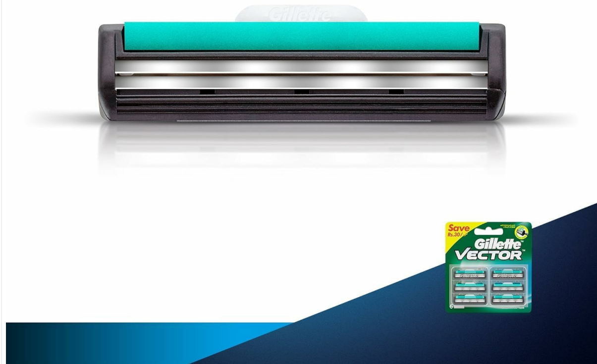
Figure 5: The twin blades are designed to shave efficiently with each stroke.