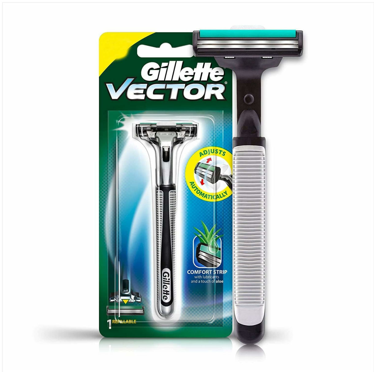
Figure 4: Packaging detail illustrating the easy blade replacement process. The barcode 4902430692489 is visible on the packaging.