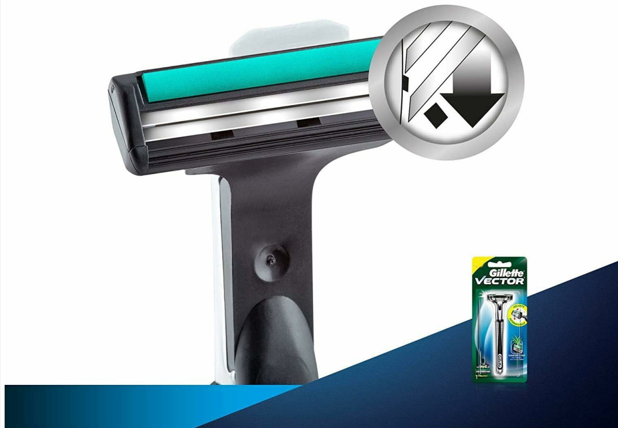
Figure 2: The twin blades of the Gillette Vector Plus Razor are engineered for a clean and efficient shave.