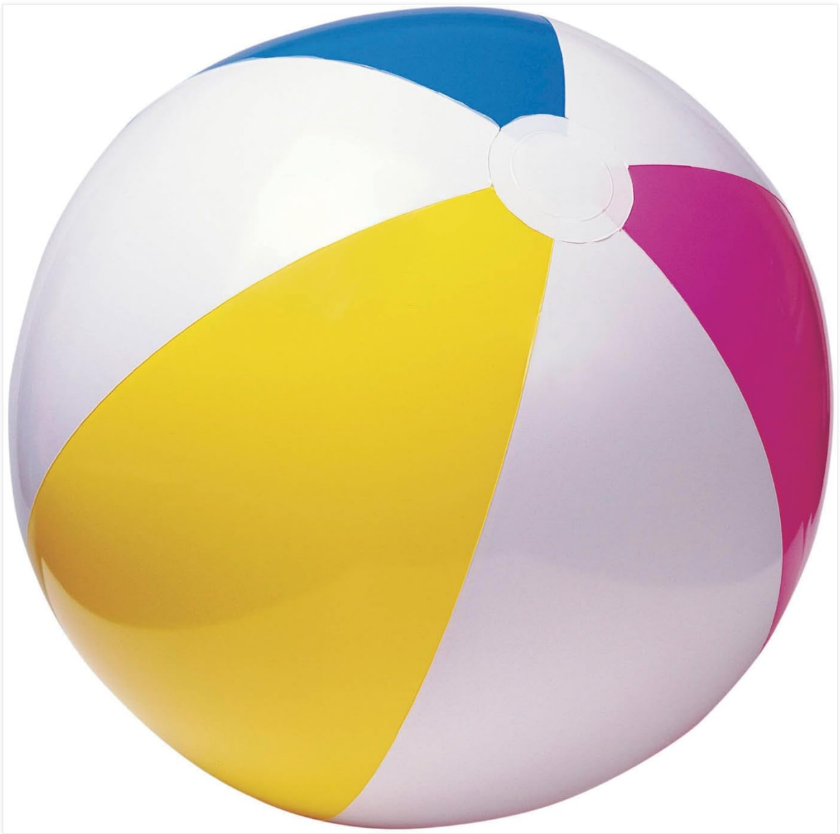
Image 1: A fully inflated Intex Rainbow-glossy Panel Beach Ball, showcasing its vibrant colors.