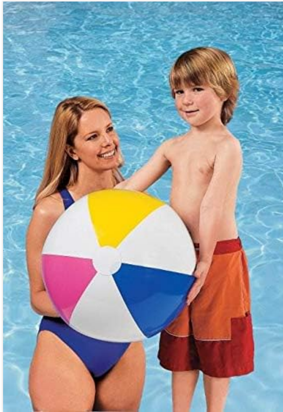
Image 2: An adult and a child enjoying the Intex Beach Ball in a swimming pool, demonstrating its use in water.