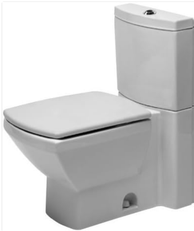
Figure 1: Duravit Caro Toilet with Cistern. This image shows the complete Duravit Caro toilet, including the cistern (tank) and the toilet bowl. The product described in this manual is the cistern component shown at the back.