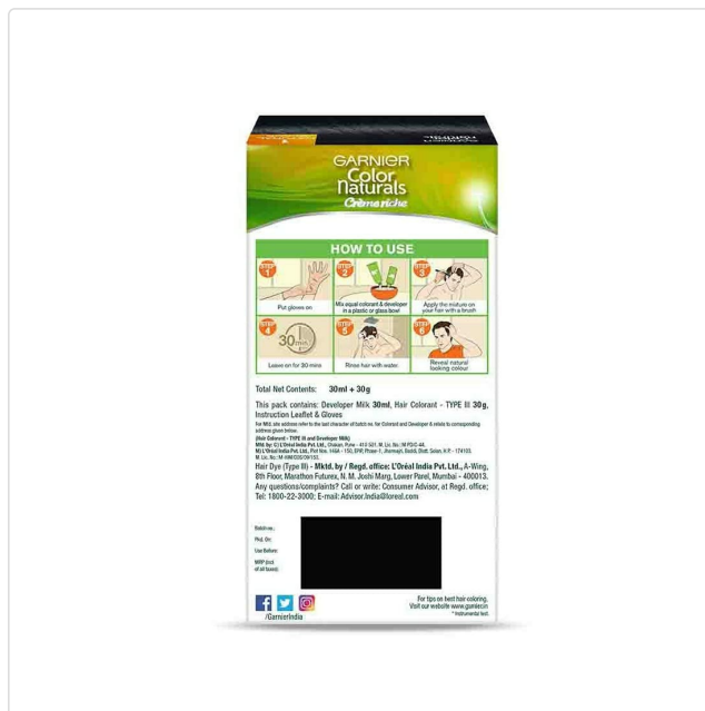
Image: Diagram illustrating the 'How to Use' steps: 1. Put on gloves, 2. Mix colorant & developer, 3. Apply mixture, 4. Leave on for 30 mins, 5. Rinse hair, 6. Reveal natural looking color.