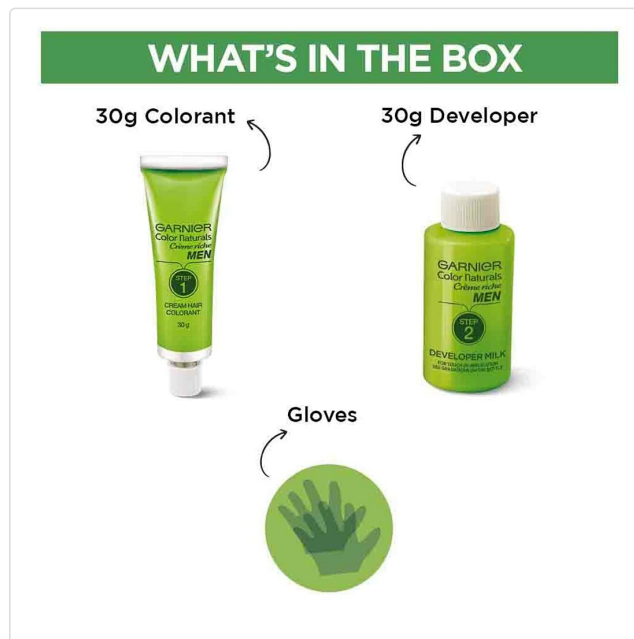
Image: Visual representation of the kit contents, including the 30g Colorant tube, 30g Developer bottle, and a pair of gloves.