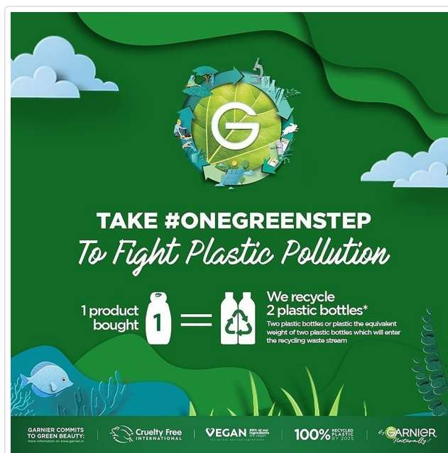
Image: Graphic illustrating Garnier's 'One Green Step' initiative, highlighting that for every 1 product bought, 2 plastic bottles are recycled. It also mentions 'Cruelty Free International', 'Vegan', and '100% Recycled Plastic' commitments. Garnier commits to Green Beauty, is certified Cruelty Free by Cruelty Free International, and uses 100% recycled plastic in its packaging where possible. Please dispose of packaging responsibly according to local recycling guidelines.

Garnier is committed to sustainability. This product packaging supports environmental initiatives: