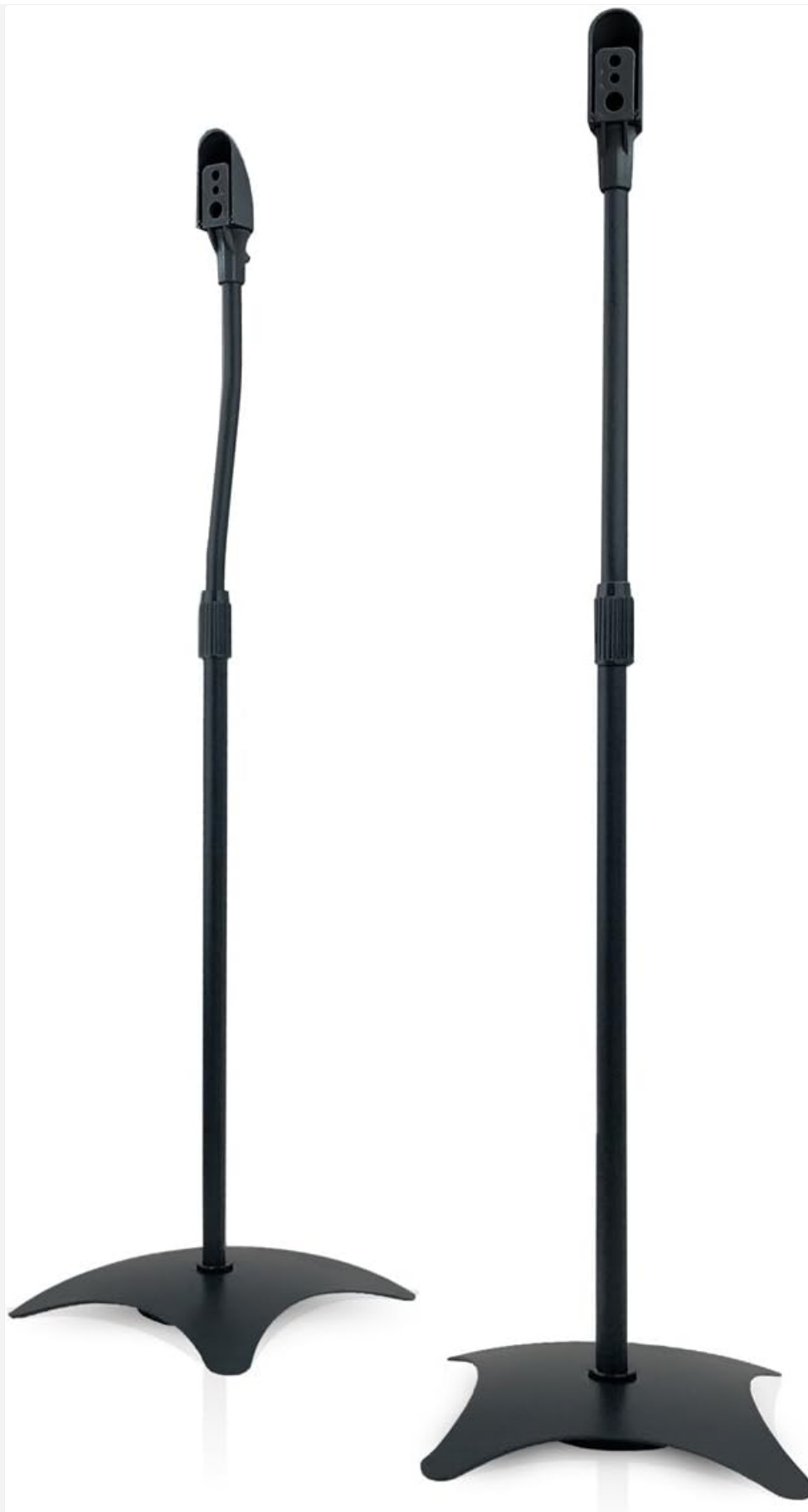
Figure 1.1: Front view of the assembled Minify Universal Speaker Stands.