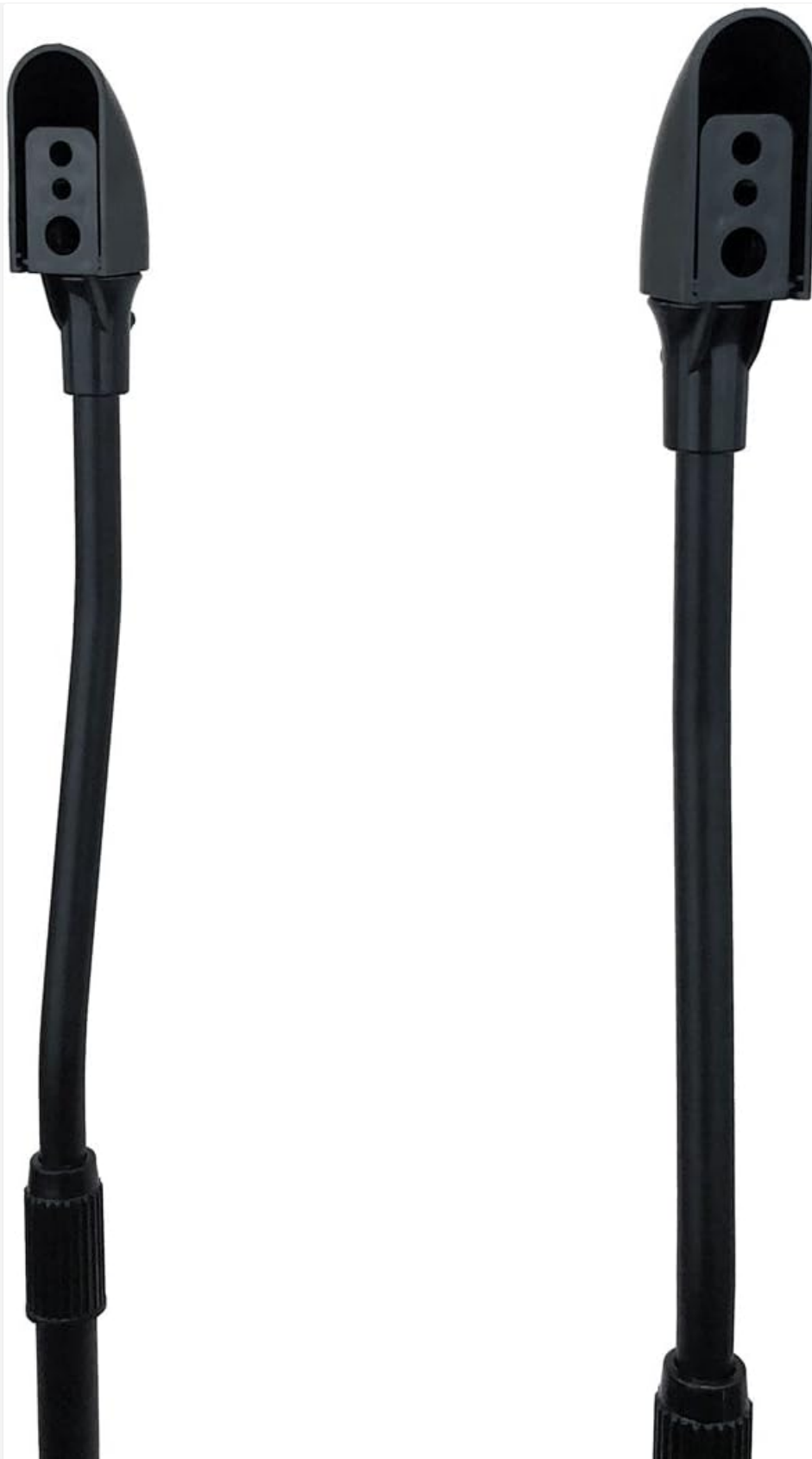
Figure 4.1: Detail of the universal mounting head for speaker attachment.