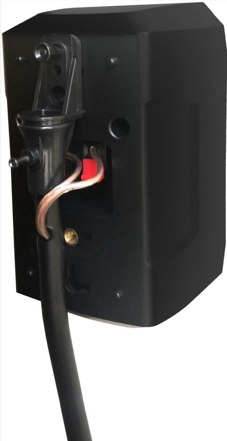
Figure 4.2: Example of a speaker mounted on the stand with cable routing.