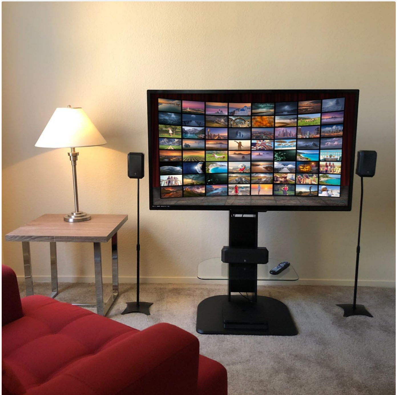
Figure 5.2: Example of speaker stands integrated into a home entertainment setup.

Once speakers are mounted and cables are routed, ensure all connections are secure and the stands are stable before use. Periodically check the stability and tightness of all components.