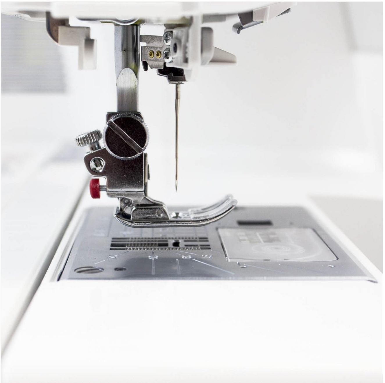
Figure 4: Detailed view of the needle and presser foot, essential for threading.