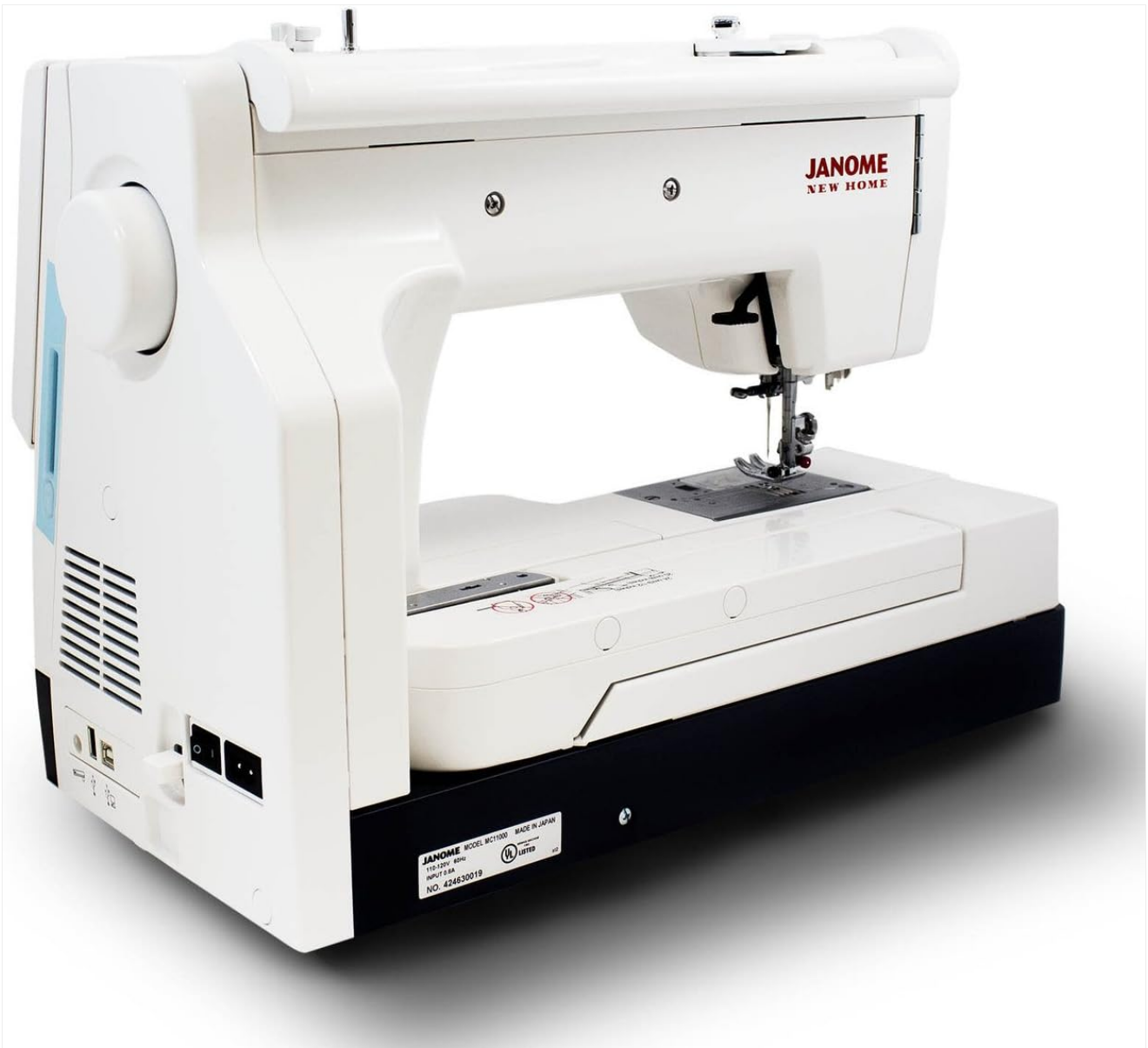
Figure 3: Rear view of the machine, highlighting power connection and USB ports.