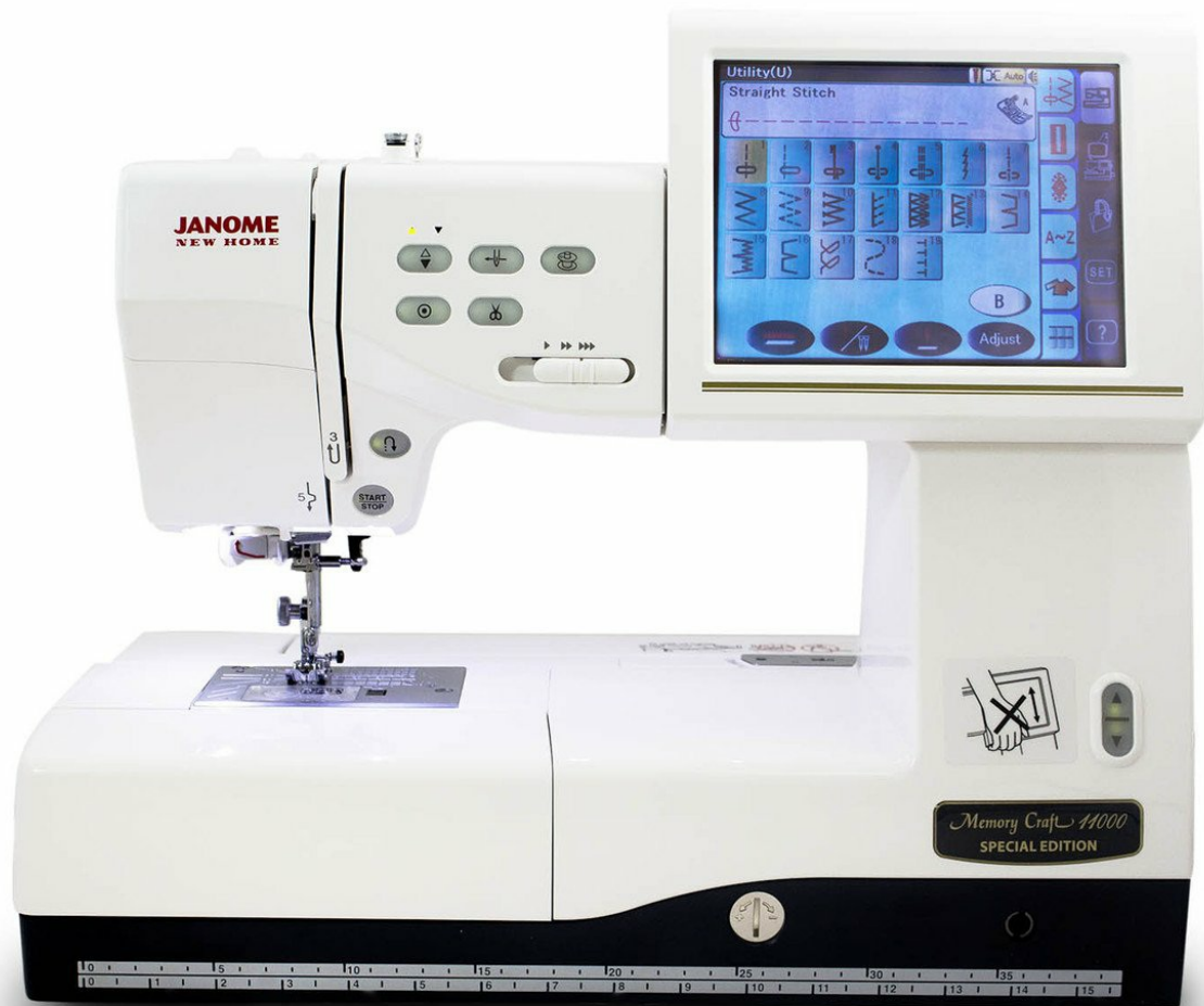
Figure 1: Front view of the Janome Memory Craft 11000 machine.