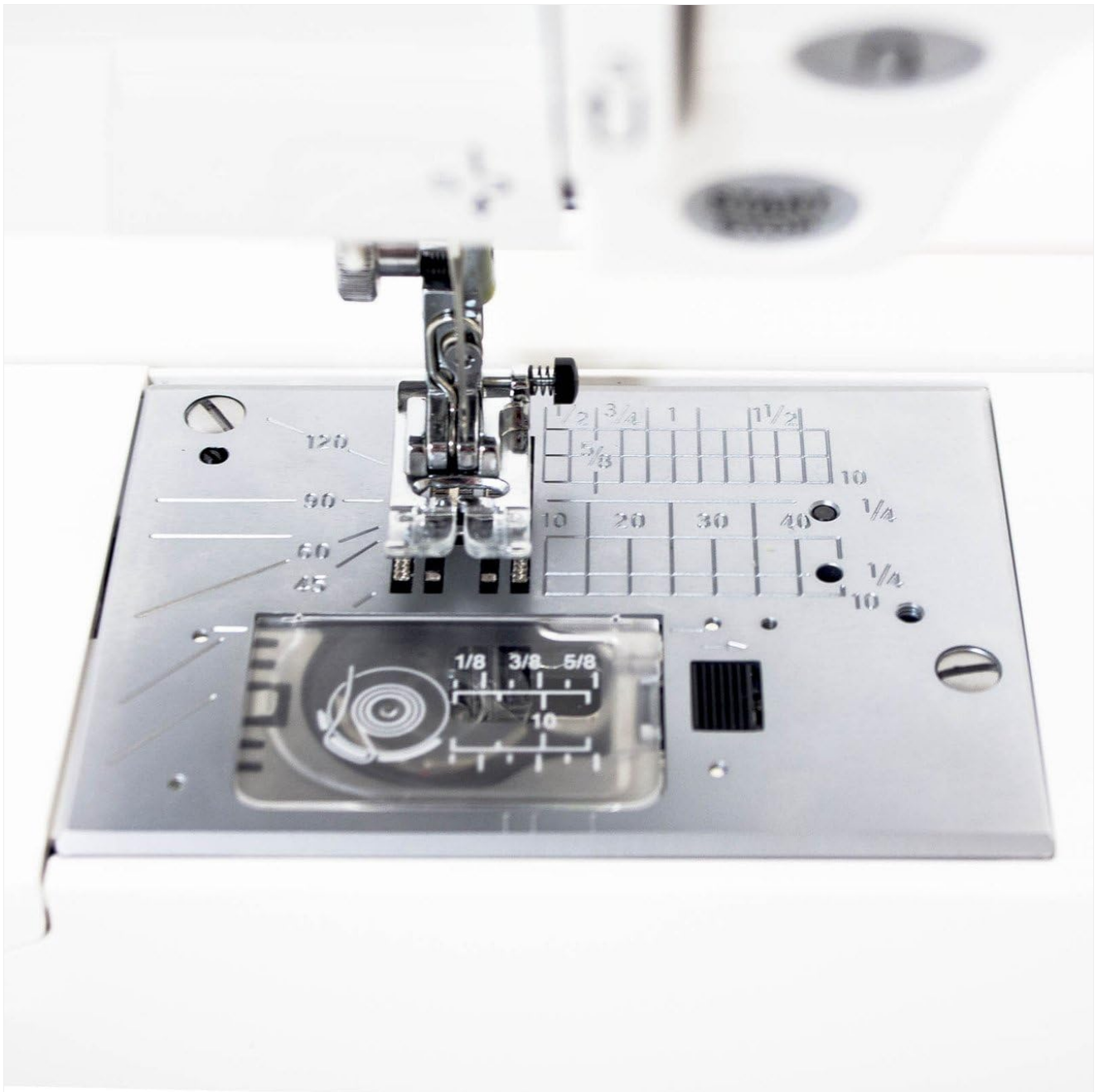
Figure 5: View of the bobbin compartment and needle plate with measurement markings.