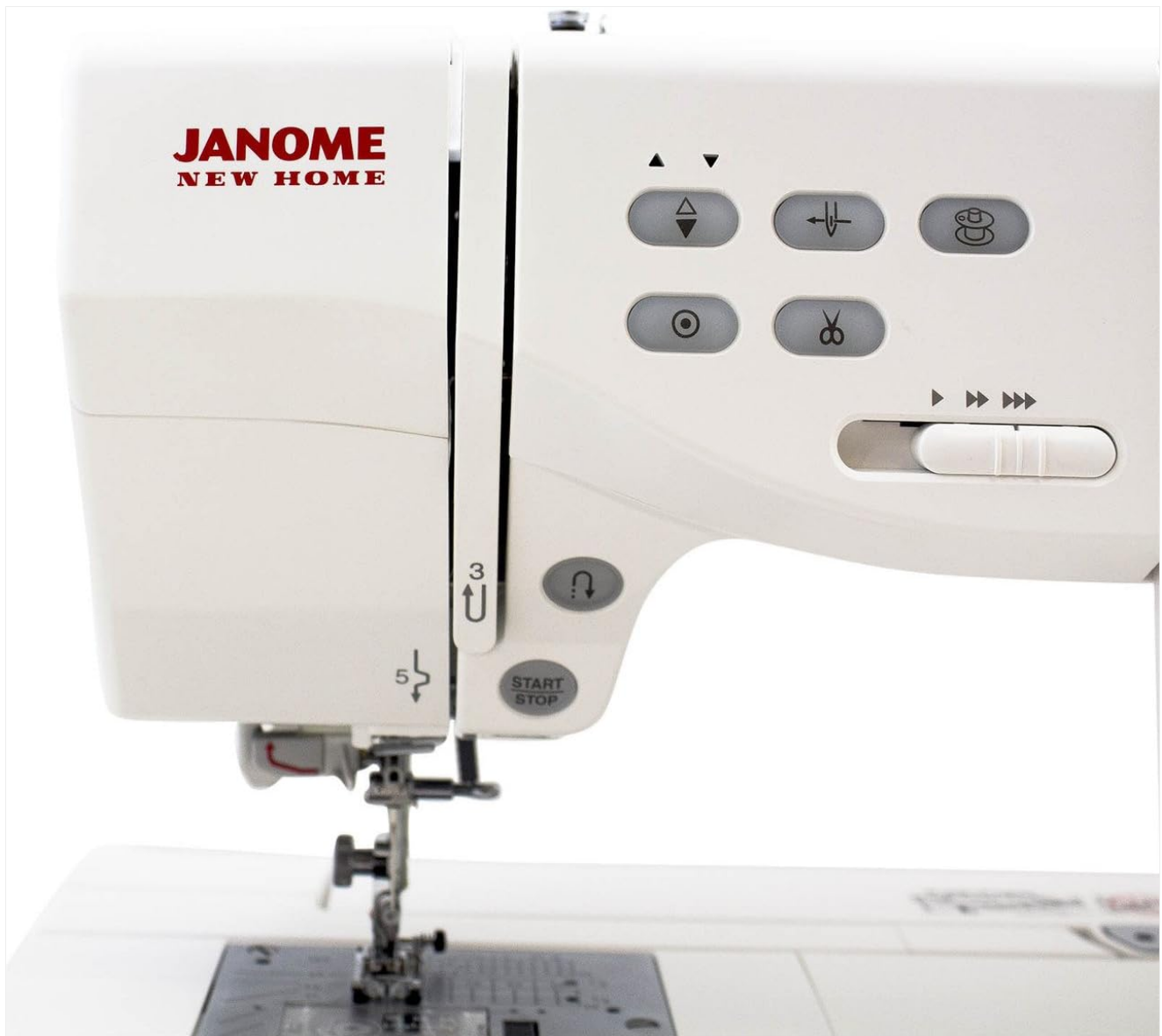
Figure 2: Side view of the machine, showing its compact design.

Carefully remove the machine from its packaging. Place the machine on a stable, level surface. Ensure there is adequate space around the machine for comfortable operation and ventilation.