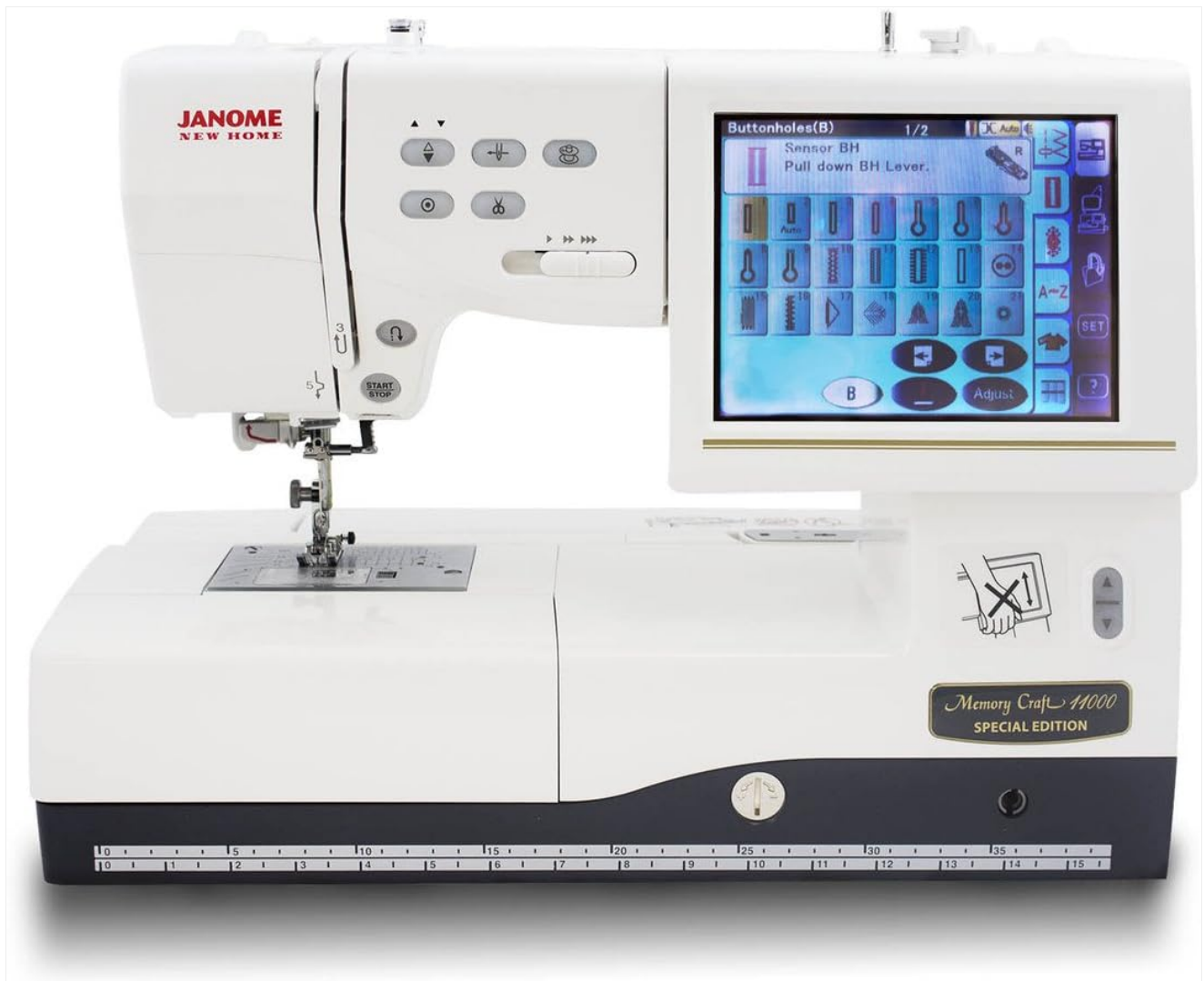
Figure 6: Control panel with buttons for common functions and the LCD touch screen.