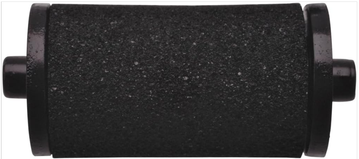
Figure 2: Detailed view of the Kenco Ink Roller, showing the ink-saturated foam surface.