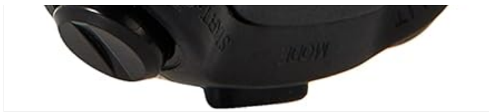
Image 4.1: Side view of the Casio HS-80TW-1DF Stopwatch, highlighting the buttons and their labels.