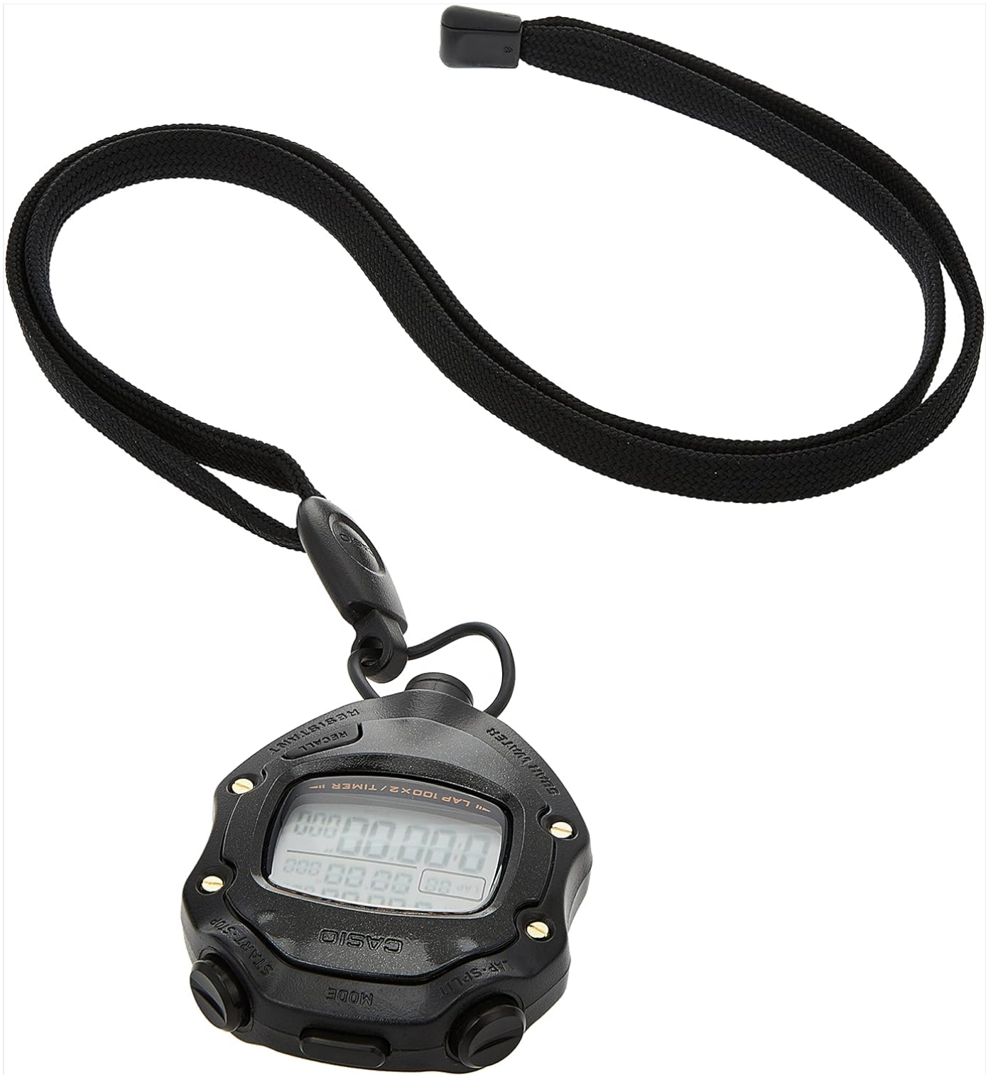
Image 1.1: Front view of the Casio HS-80TW-1DF Stopwatch, showing the display and control buttons, attached to a black lanyard.