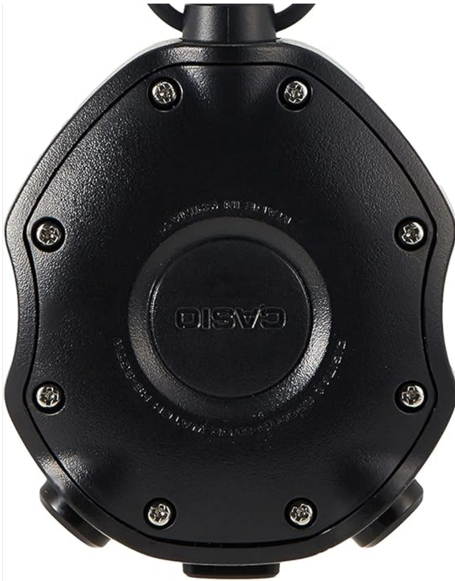
Image 3.1: Rear view of the Casio HS-80TW-1DF Stopwatch, showing the battery compartment cover and screws.