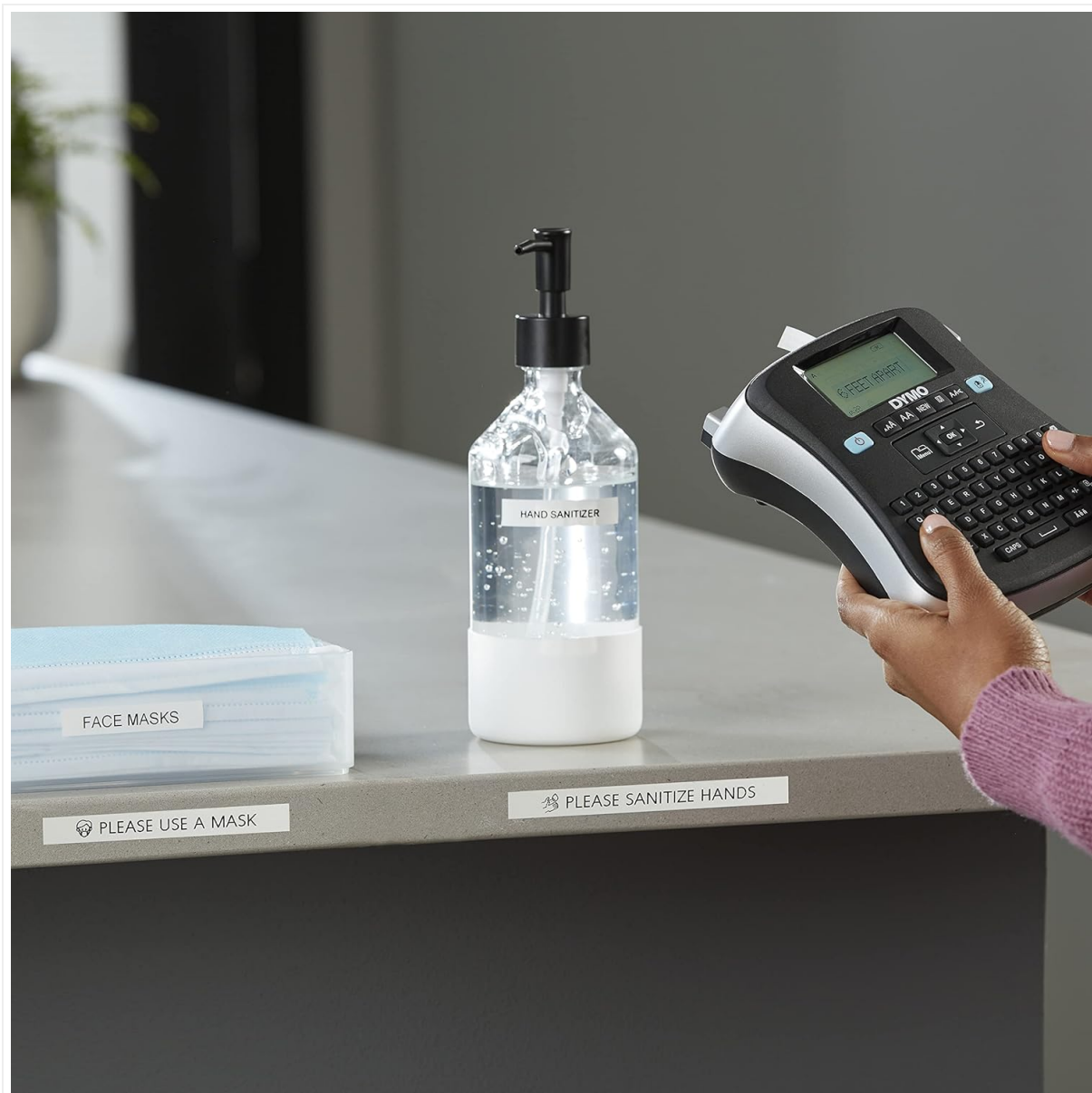
Figure 3: User typing text on the label maker's QWERTZ keyboard.

Your browser does not support the video tag.