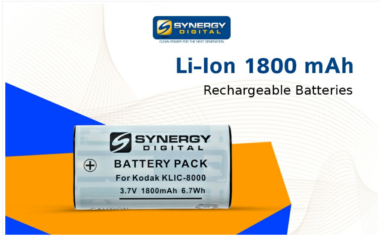
Image: Graphic illustrating the Synergy Digital Li-ion 1800 mAh Rechargeable Batteries, highlighting its capacity.