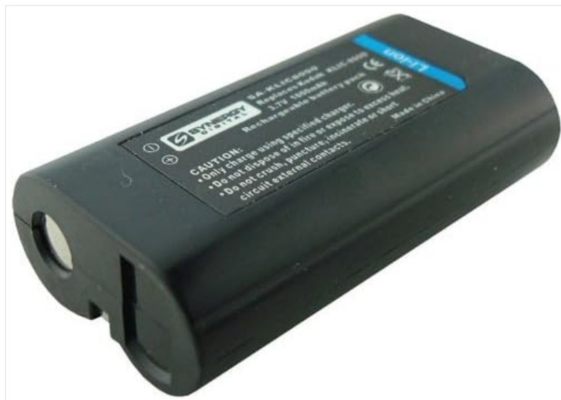
Image: The Synergy Digital KLIC-8000 Lithium-Ion Equivalent Battery, showing its compact black casing with product labels.

The Synergy Digital KLIC-8000 is a high-capacity, rechargeable Lithium-Ion battery designed as an equivalent replacement for the Kodak KLIC-8000 battery. It features a voltage of 3.7V and a capacity of 1800mAh, providing reliable power for compatible camera devices.