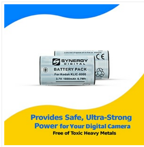
Image: Depiction of the battery providing safe, ultra-strong power for digital cameras, free of toxic heavy metals.