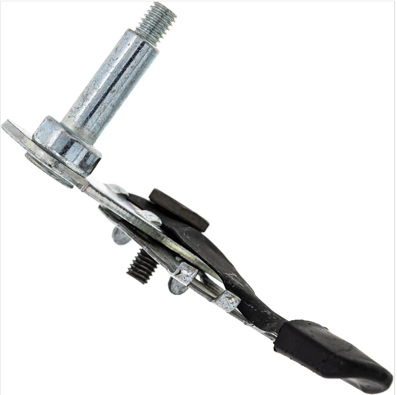
Figure 2: Side view of the assembly, highlighting the long bolt and the lever mechanism. This perspective helps in understanding how the assembly attaches to the mower deck.