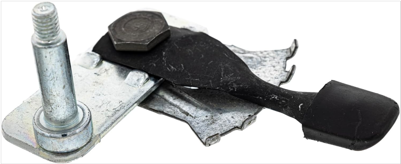
Figure 4: A partially disassembled view of the assembly, showing the individual components like the lever, spring, and mounting hardware. This can be useful for understanding the internal mechanism.