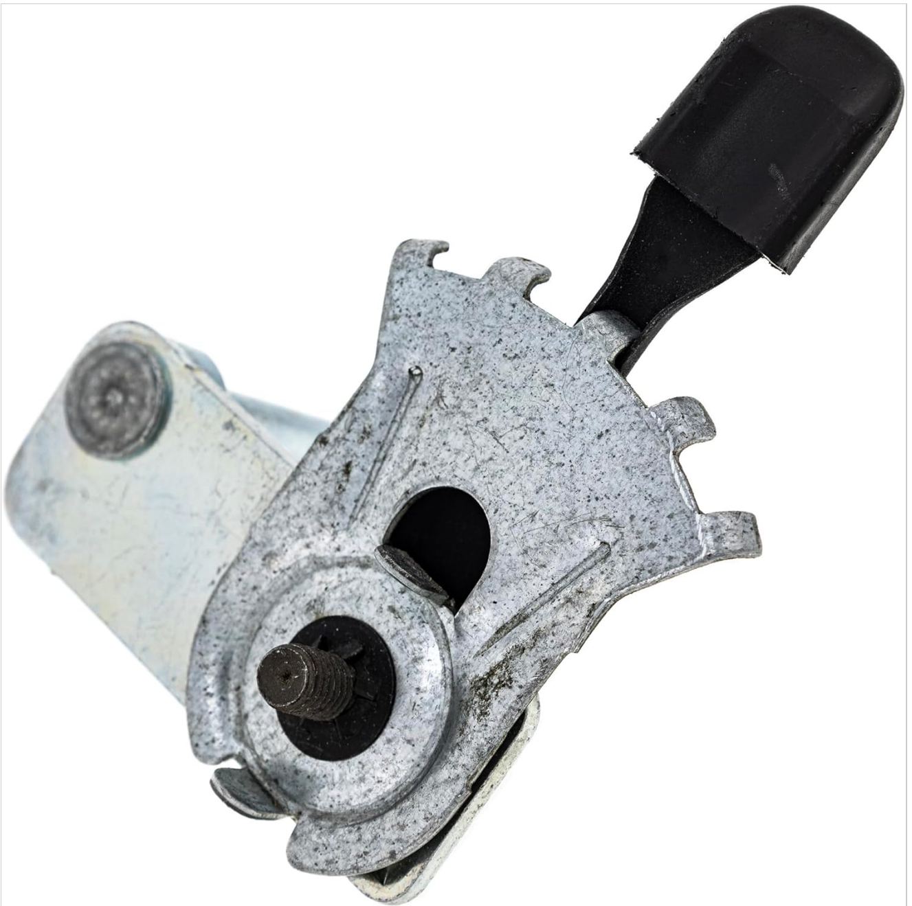
Figure 1: Top view of the MTD 987-02074B Right Hand Height Adjustment Assembly. This image shows the main body of the assembly with the adjustment lever and mounting points.