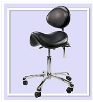
Figure 4: Durable PU Upholstery

A close-up view of the table's durable PU upholstery, showing the quality stitching and soft texture designed for long-lasting professional use.