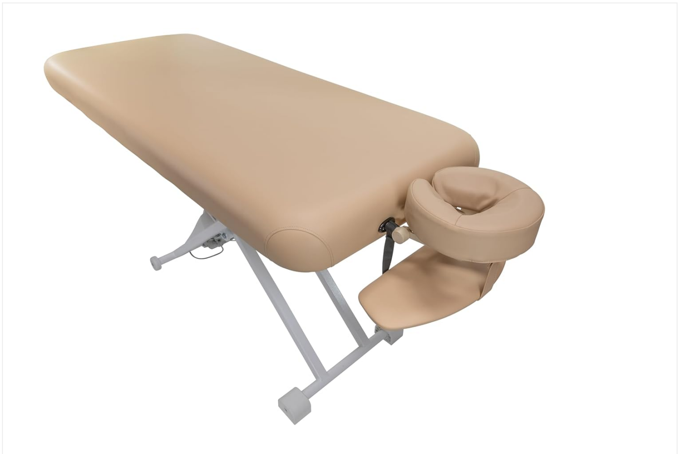
Figure 1: Spa Luxe Electric Massage Table (Flat Top Beige)

This image shows the complete Spa Luxe Electric Massage Table in beige, featuring its flat top design and adjustable face cradle. The sturdy base is visible underneath, highlighting its professional construction.