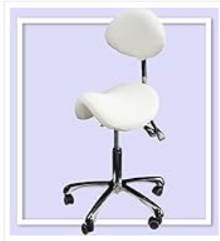
Figure 6: German-Engineered Motor System

A detailed view of the robust German-engineered motor system, which provides reliable and quiet height adjustment for the table.