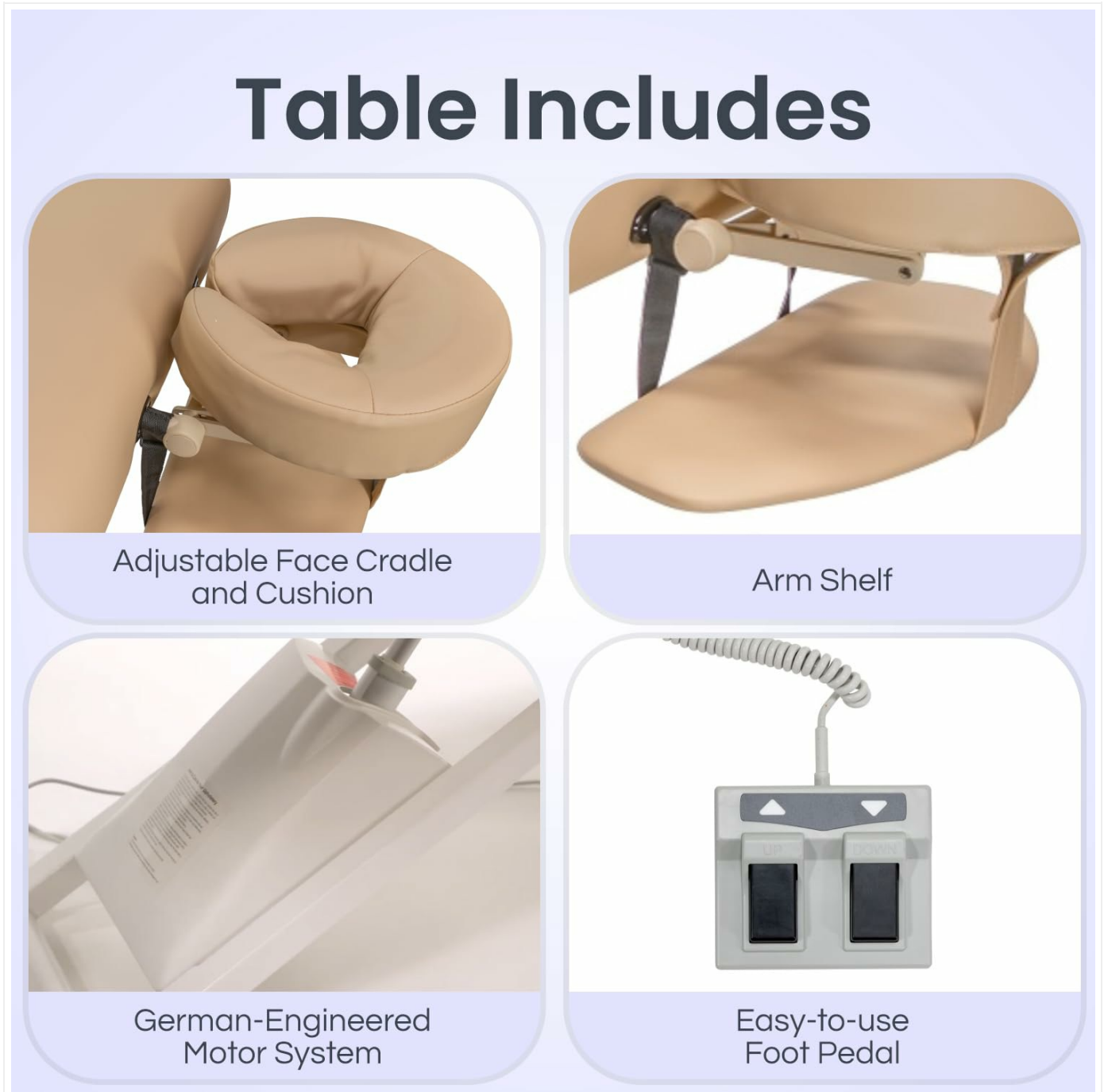
Figure 2: Included Table Components

This image displays the key components of the Spa Luxe table: the adjustable face cradle and cushion, the armshelf, the German-engineered motor system, and the easy-to-use foot pedal. These accessories enhance client comfort and practitioner convenience.