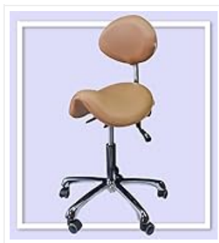
Figure 5: Smooth Mobility Wheels

A close-up view of the table's durable PU upholstery, showing the quality stitching and soft texture designed for long-lasting professional use.