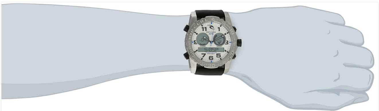
Image: A detailed view of the Rip Curl Cortez 2 XL Tidemaster 2 watch face, showing both analog hands and the digital display.