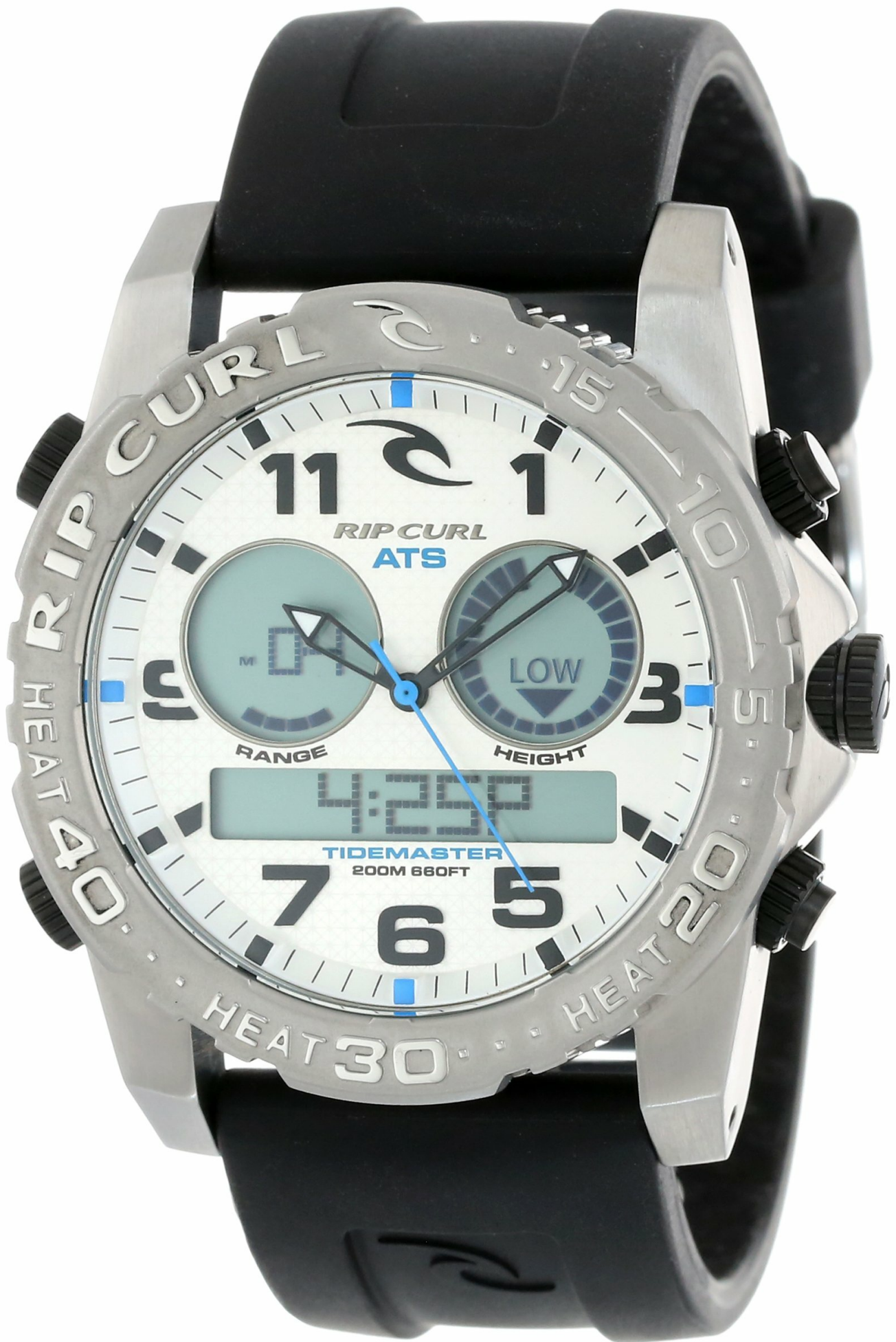
Image: The Rip Curl Cortez 2 XL Tidemaster 2 watch displayed on a wrist, showcasing its size and fit.