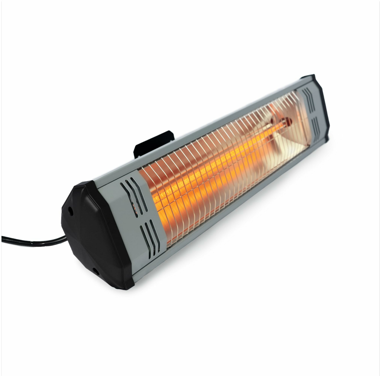
Figure 1: Front view of the Heat Storm HS-1500-OTR Infrared Heater.

The Heat Storm HS-1500-OTR Infrared Heater is a versatile 1500-watt heating solution designed for both indoor and outdoor environments. It provides instant infrared heat, making it ideal for shops, garages, job sites, patios, and hot tub areas. Constructed from durable aluminum, nylon plastic, quartz tube, and copper cord, this heater is built to withstand various conditions.