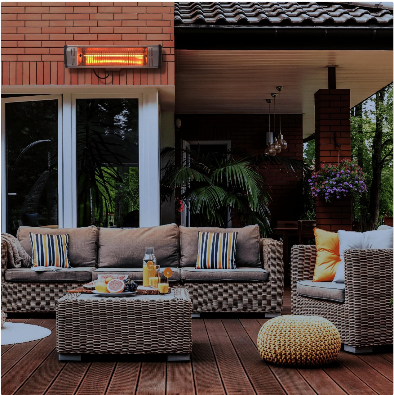
Figure 3: Heat Storm HS-1500-OTR mounted on an outdoor wall.