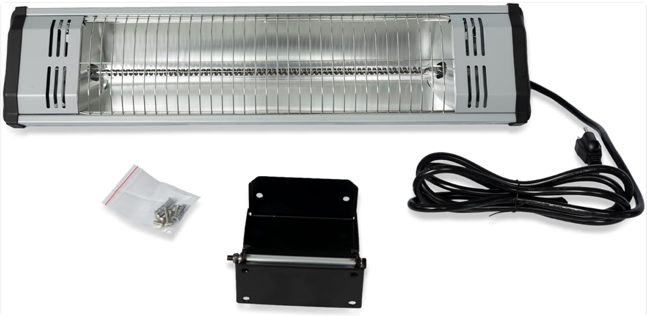
Figure 2: Contents of the Heat Storm HS-1500-OTR package.