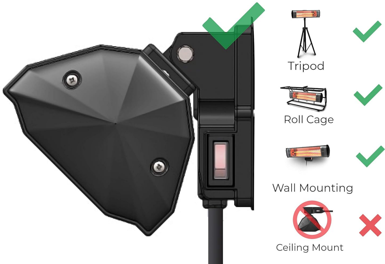
Figure 4: Internal tip-over safety switch and vertical mounting requirement.

Black Housing box must be mounted vertically for heater to turn on