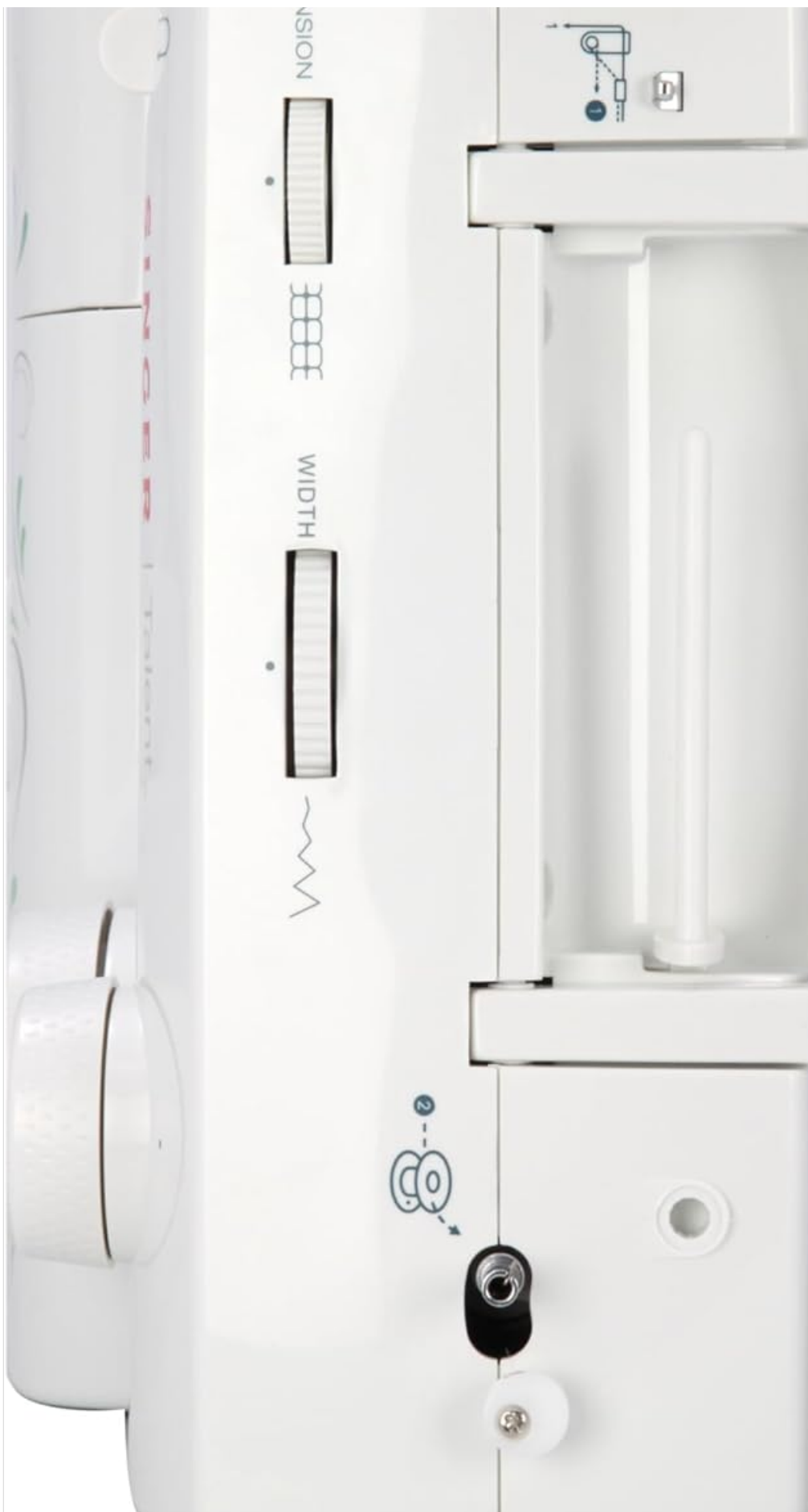
Figure 7: Tension and stitch width adjustment sliders for fine-tuning your stitches.