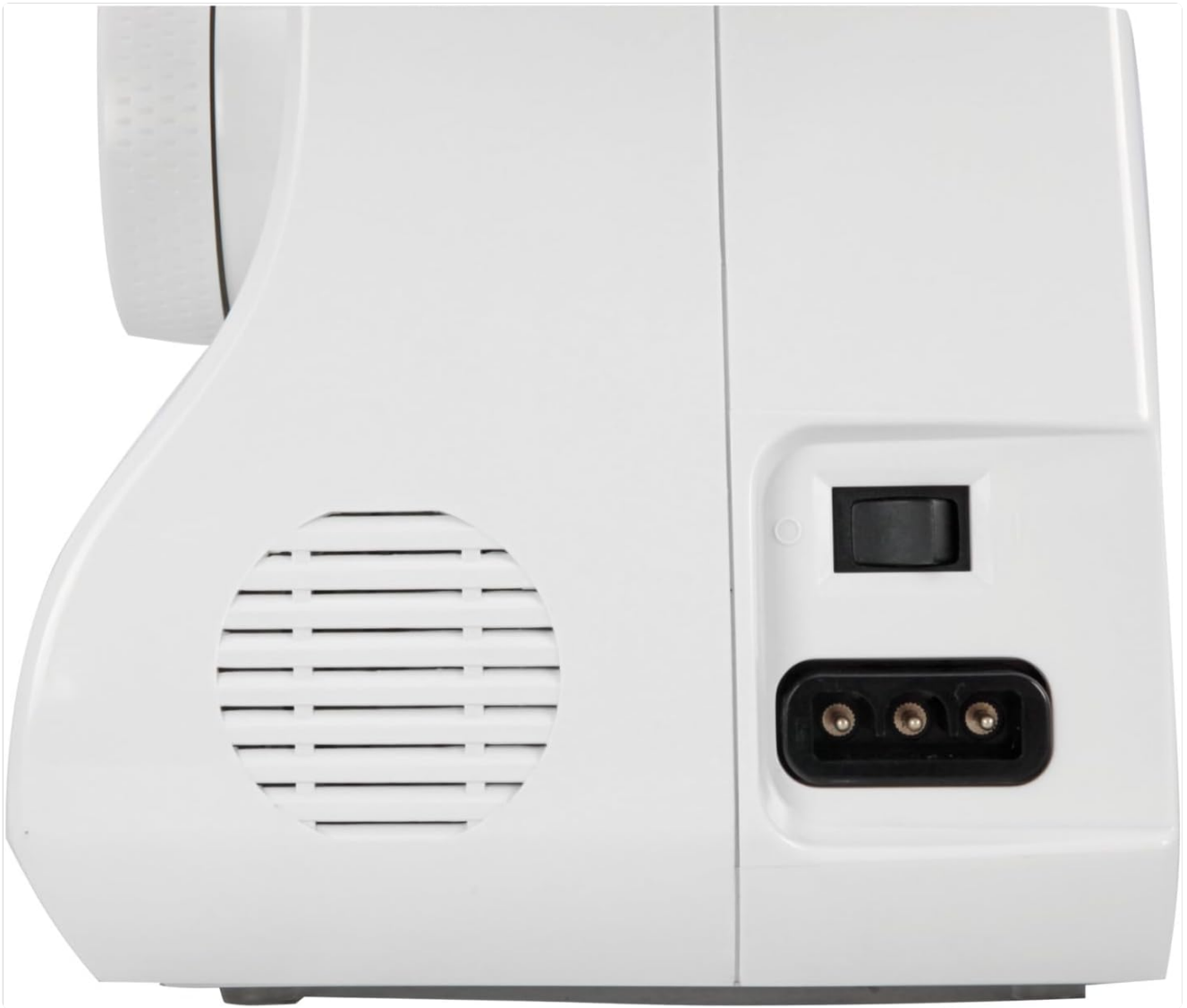
Figure 2: Side view illustrating the power cord connection point and the main power switch.