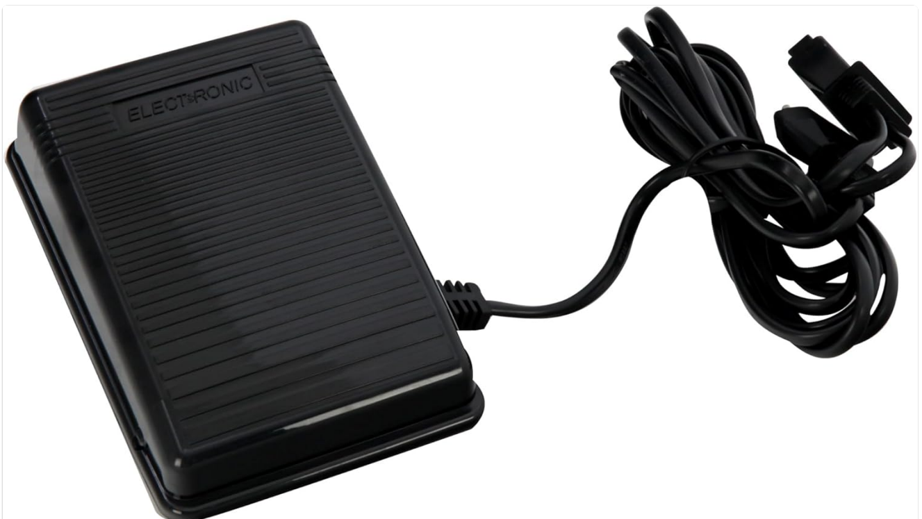
Figure 3: The electronic foot pedal, essential for controlling sewing speed.