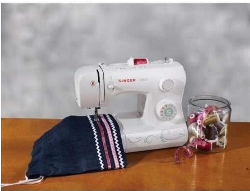
Figure 8: The Singer Talent 3321 in operation, demonstrating its use with fabric.

To sew cylindrical items like sleeves, cuffs, or pant hems, slide off the accessory storage compartment to reveal the free arm. This allows fabric to be easily maneuvered around the narrow arm.