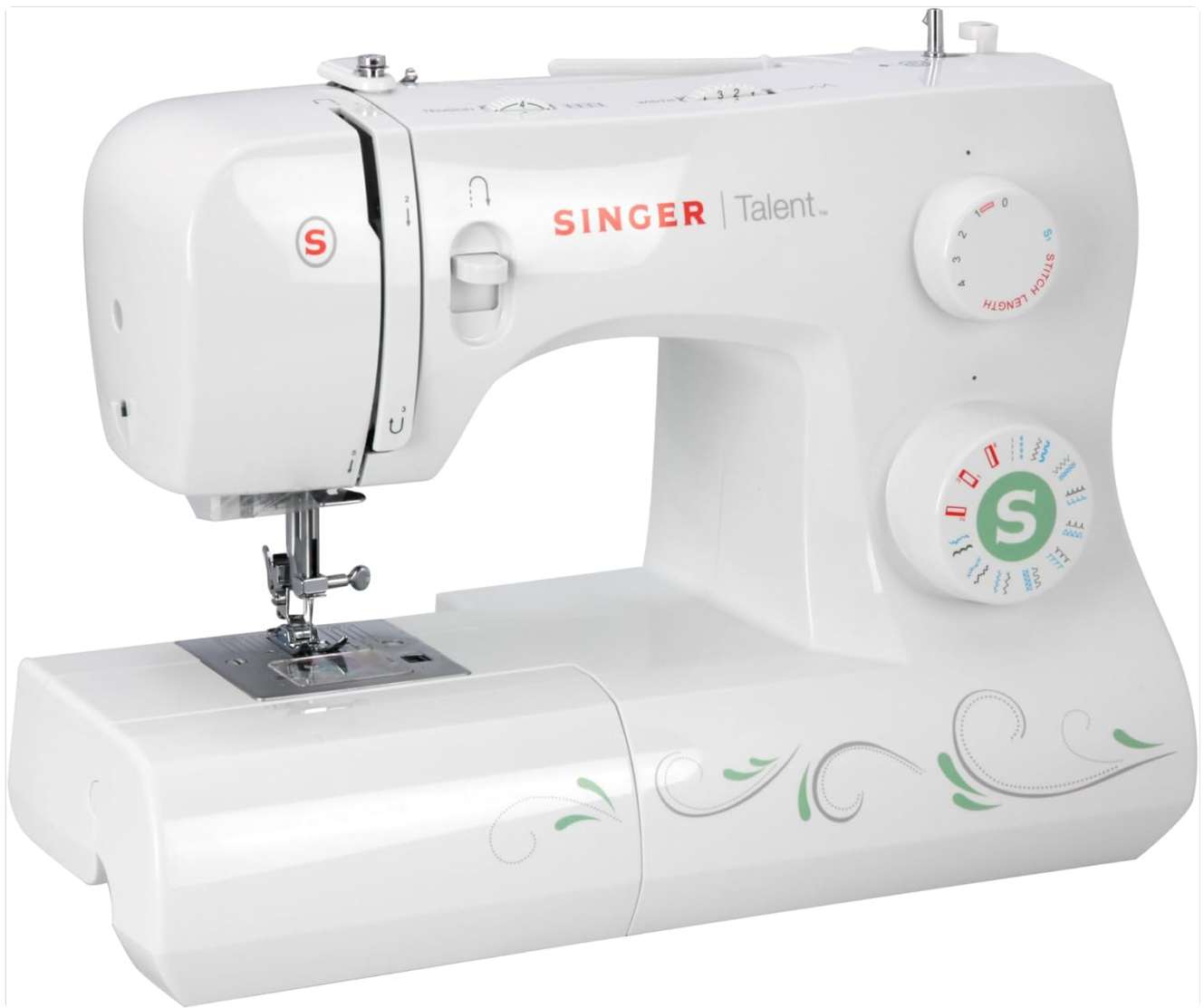
Figure 1: Front view of the Singer Talent 3321 Sewing Machine, showcasing its compact design and control dials.