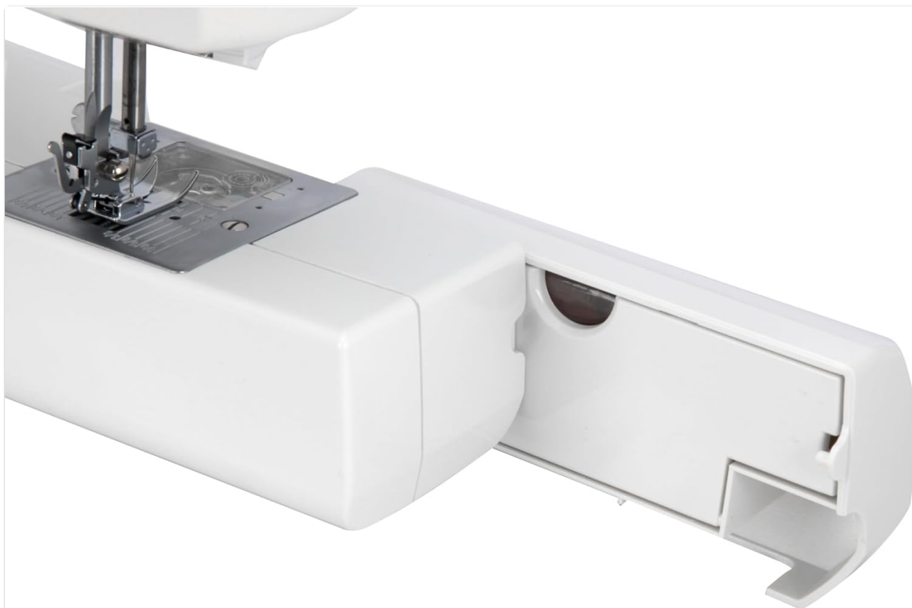
Figure 5: The bobbin compartment, accessible by opening the free arm, for bobbin insertion.