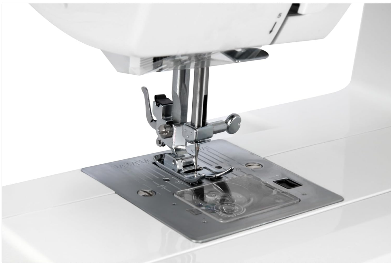
Figure 4: Detailed view of the needle and presser foot area, important for correct threading.

Proper threading is crucial for smooth operation and consistent stitches. Follow the numbered guides on the machine for upper thread path. For the bobbin, ensure it is wound correctly and inserted into the bobbin case as per the machine's instructions, typically located under the needle plate.