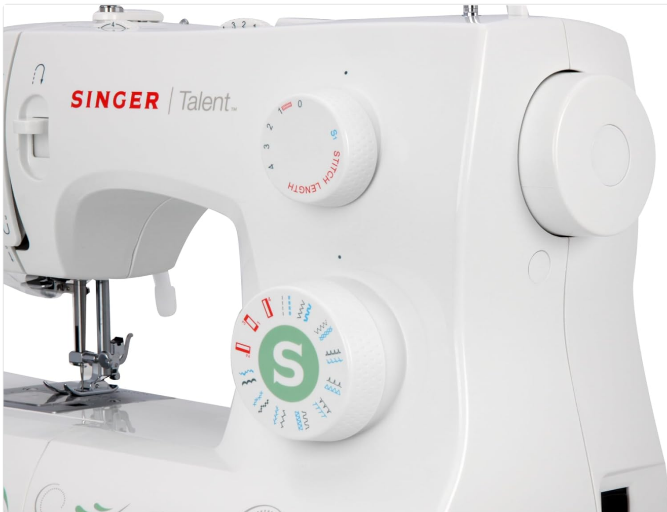
Figure 6: The stitch length and pattern selection dials for choosing your desired stitch.

The Singer Talent 3321 offers 21 built-in stitch programs. To select a stitch, turn the stitch pattern dial to align the desired stitch symbol with the indicator mark. Refer to the stitch chart on the machine for available patterns, including utility, decorative, and stretch stitches.