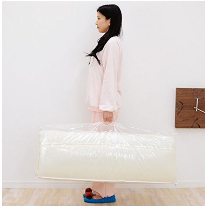
Image 2.1: A person carrying the futon mattress in its compressed packaging, highlighting its portability.