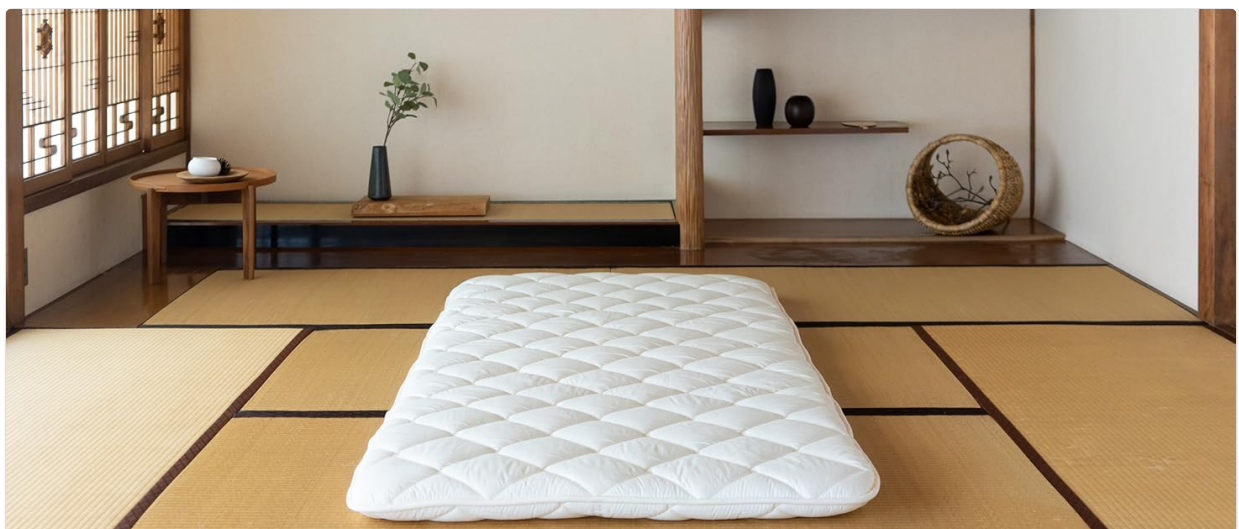
Image 2.2: The futon mattress laid out on a tatami floor, ready for use.

Unfold the futon mattress completely and lay it flat on your desired sleeping surface. For optimal comfort and support, it is highly recommended to use this futon in combination with an under-mattress or a bed mattress. It is not designed to be used directly on the floor as a standalone mattress due to its thickness.