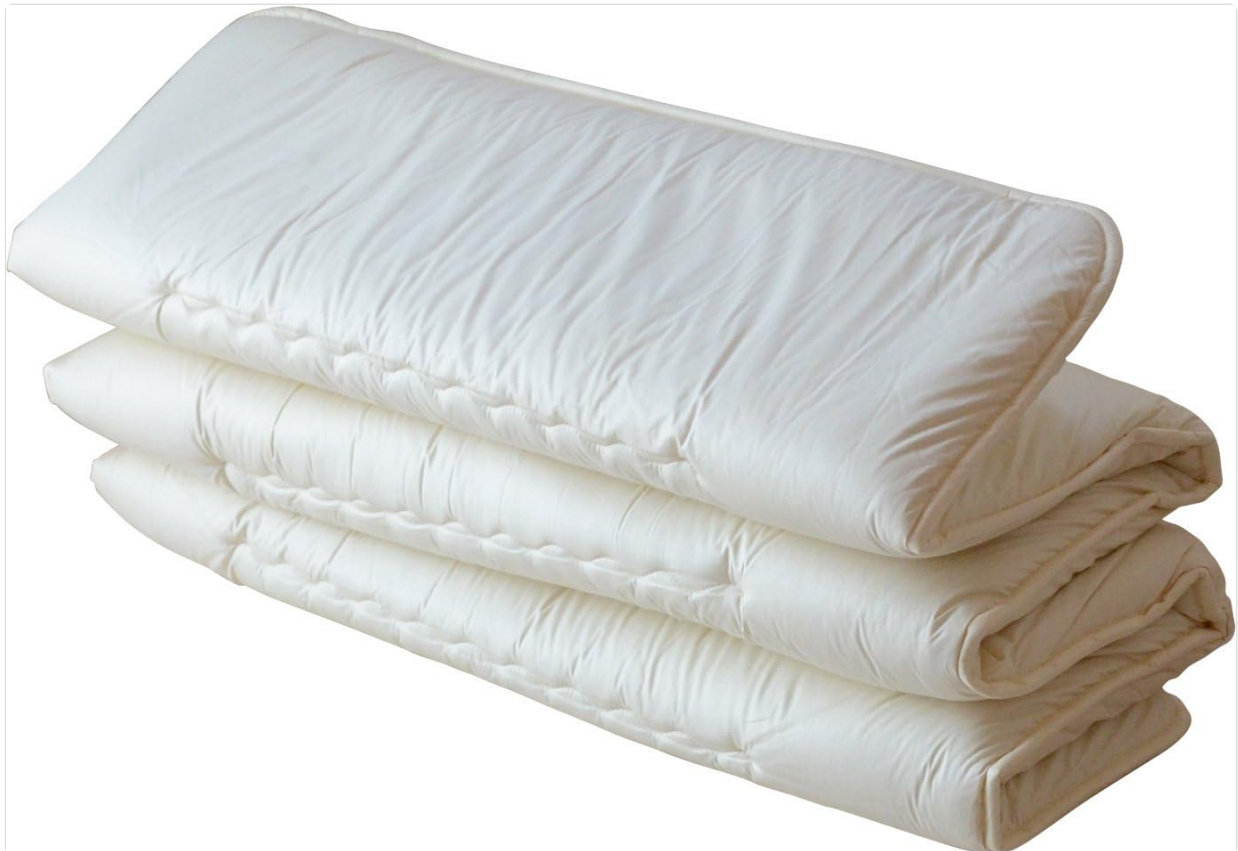
Image 1.1: The EMOOR Japanese Traditional 6-Fold Futon Mattress in its folded state.

This manual provides essential information for the proper setup, usage, care, and maintenance of your EMOOR Japanese Traditional 6-Fold Futon Mattress. Designed for comfort and versatility, this futon offers a unique sleeping experience. Please read these instructions thoroughly before use to ensure optimal performance and longevity of your product.