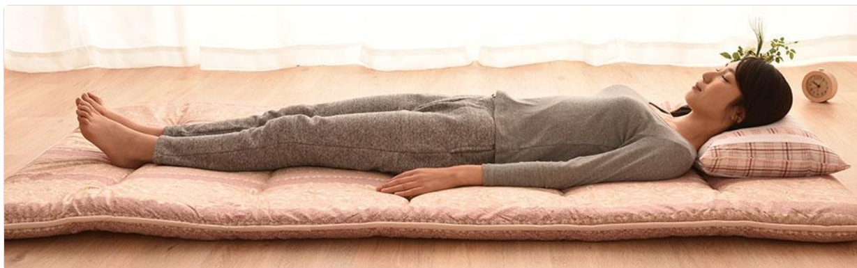
Image 4.1: Key features of the futon, including anti-mite, antibacterial, and durability.