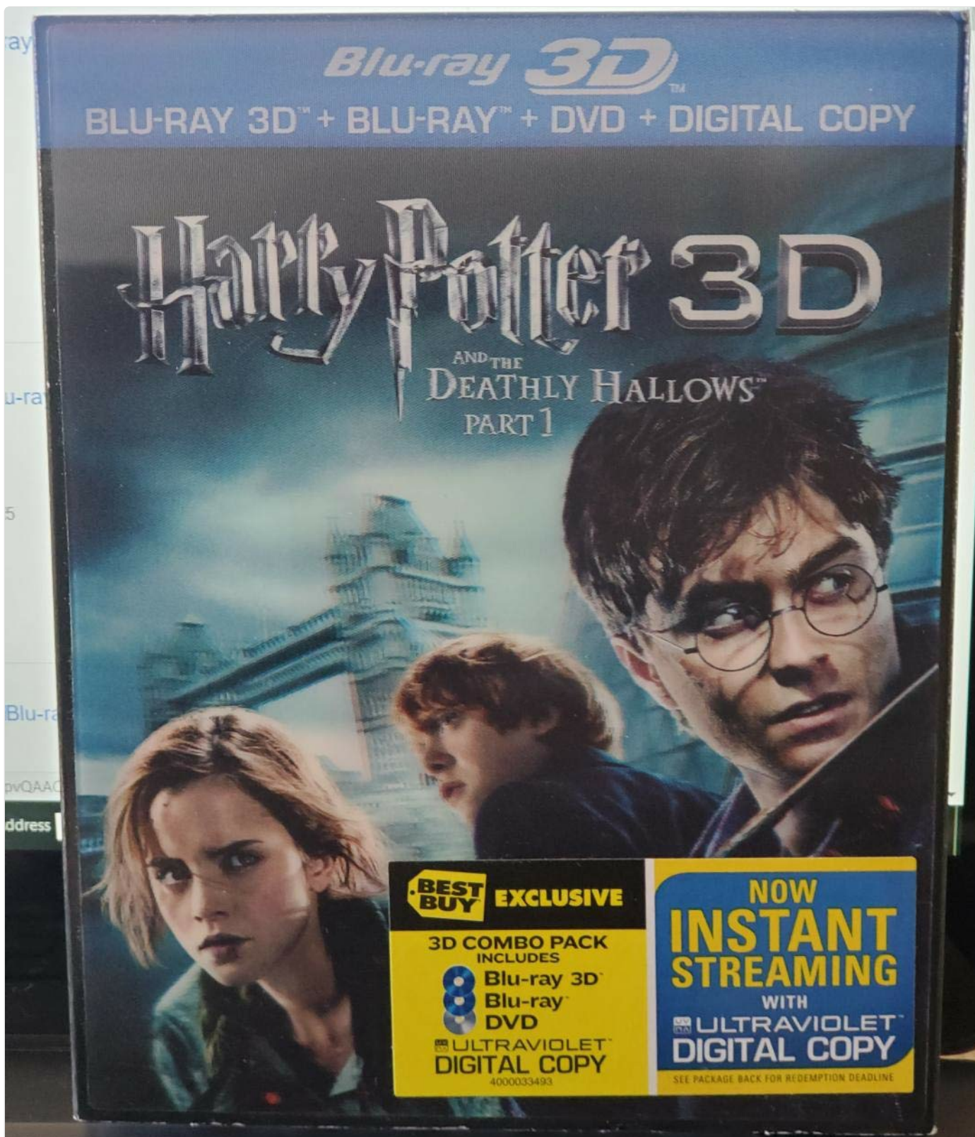
Image: Front cover of the Harry Potter and the Deathly Hallows, Part 1 3D Blu-ray Combo Pack, showing the title, main characters, and format details.