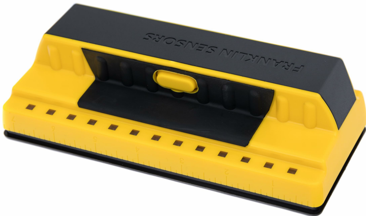
Figure 1: Front view of the Franklin Sensors 710 Professional Stud Finder.

The ProSensor 710 incorporates innovative stud sensing technology that instantly finds hidden studs. No sliding is required. This patent-pending detector senses the wall in thirteen locations simultaneously, then immediately illuminates the display elements that are in front of a stud. The ProSensor 710 is faster, less error prone and more accurate than other products on the market. It is the easy way to find studs.