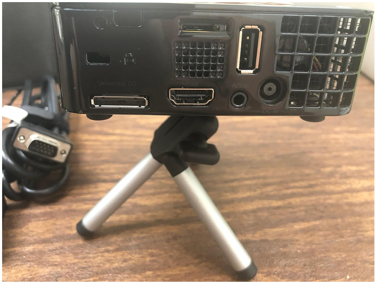
Image: The Dell M110 projector shown with its power adapter, VGA cable, and carrying case, laid out on a wooden surface.