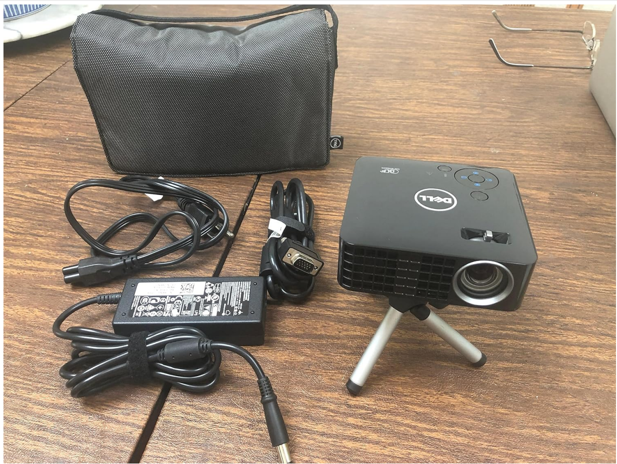
Image: The Dell M110 projector is shown from the front, mounted on a small silver tripod, ready for projection.