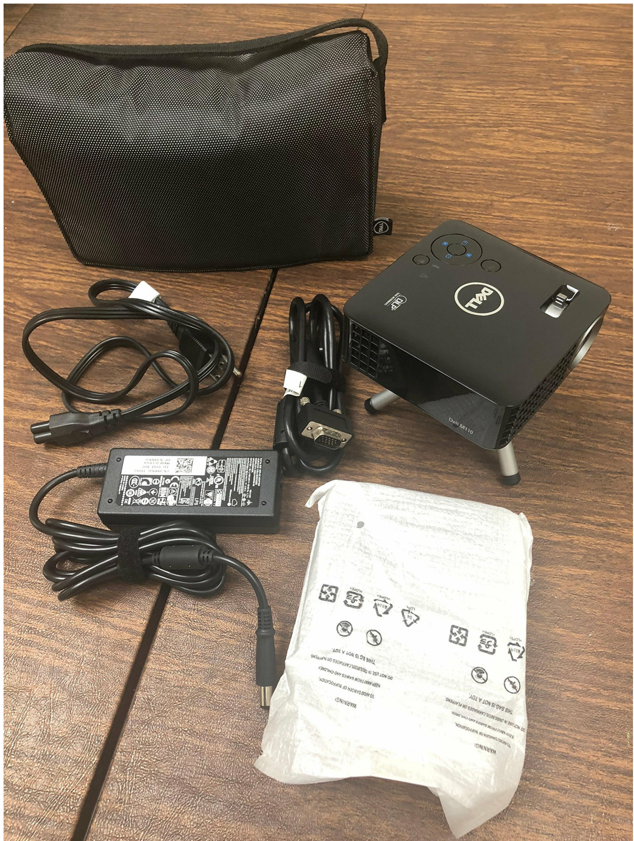
Image: A top-down view of the Dell M110 projector, clearly showing the power button, navigation controls, and other function buttons on its surface.