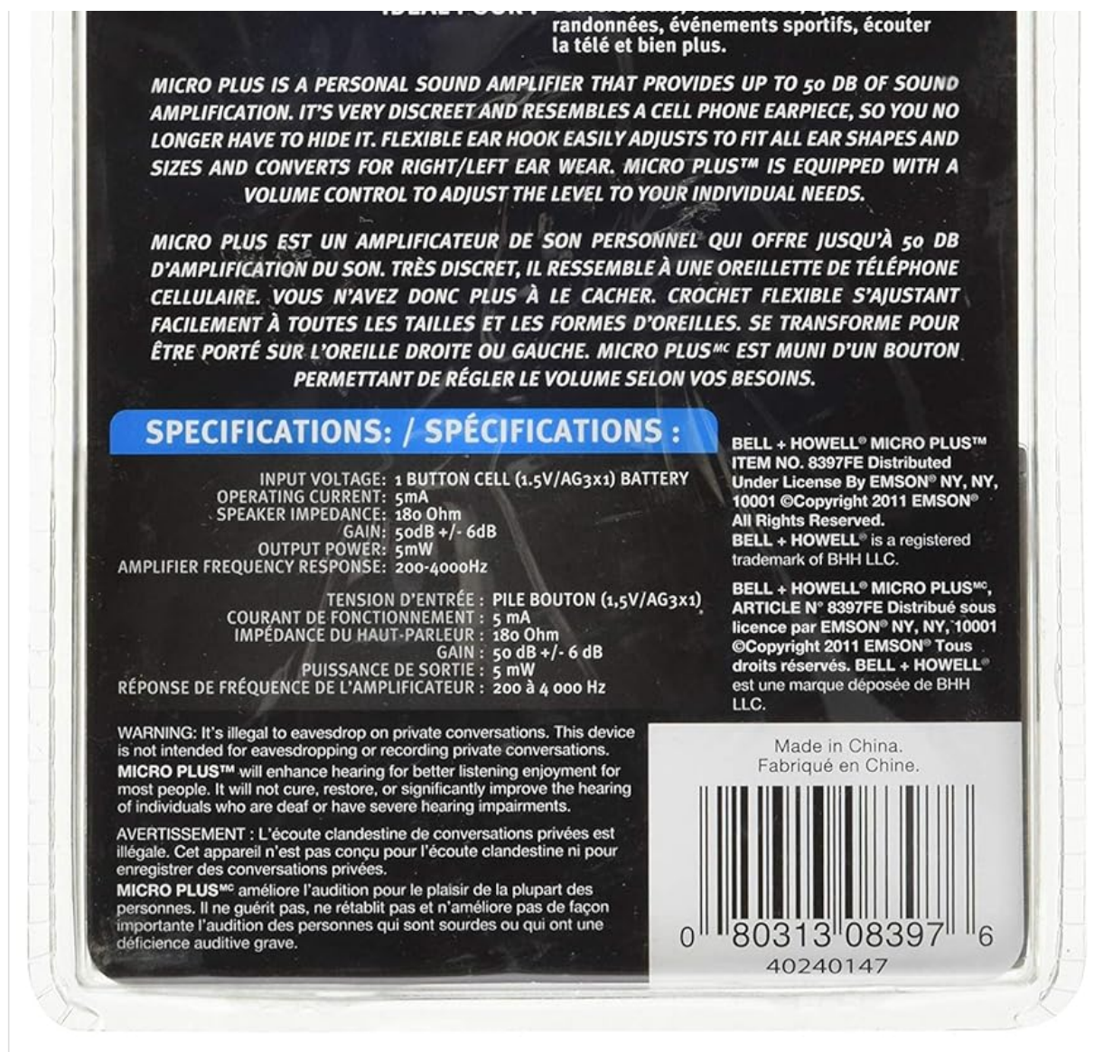
Image 2: Back view of the Bell and Howell Micro Plus Personal Sound Amplifier packaging, detailing features, usage, and technical specifications.