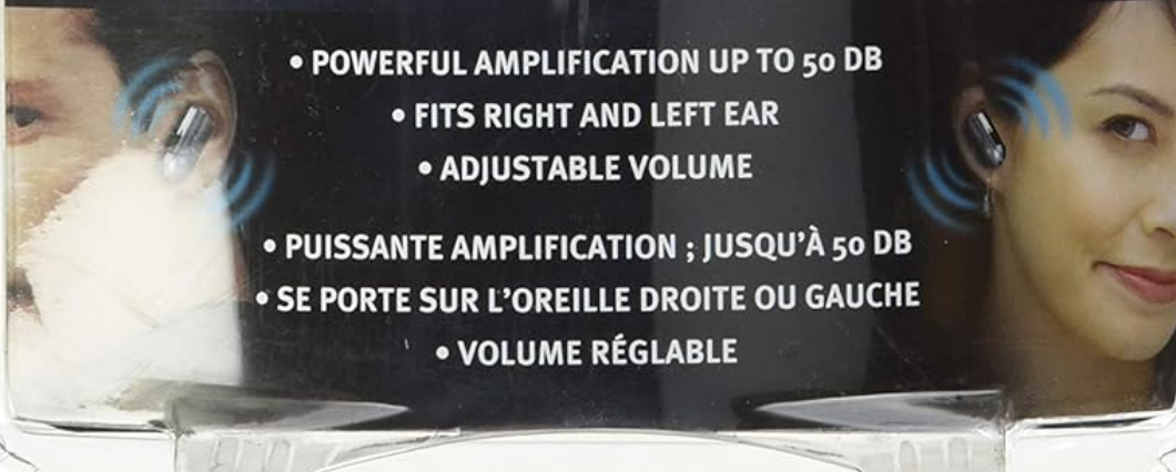
Image 1: Front view of the Bell and Howell Micro Plus Personal Sound Amplifier packaging, showing the device, ear tips,