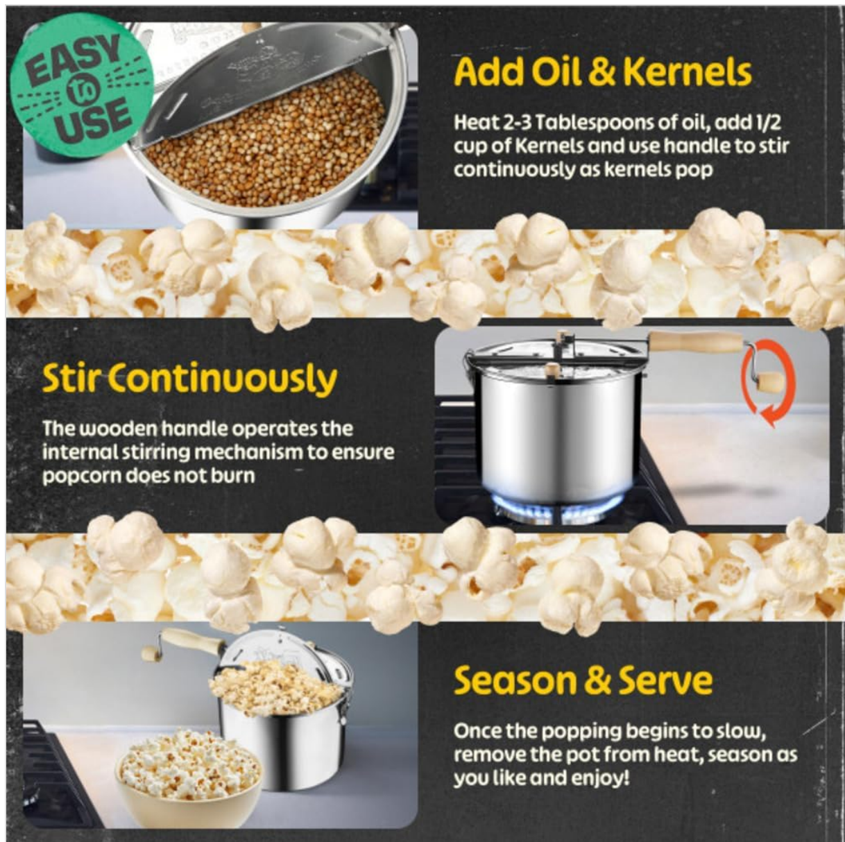
Image: Visual guide to the popcorn making process, from adding ingredients to serving.

Follow these steps to make fresh, delicious popcorn: