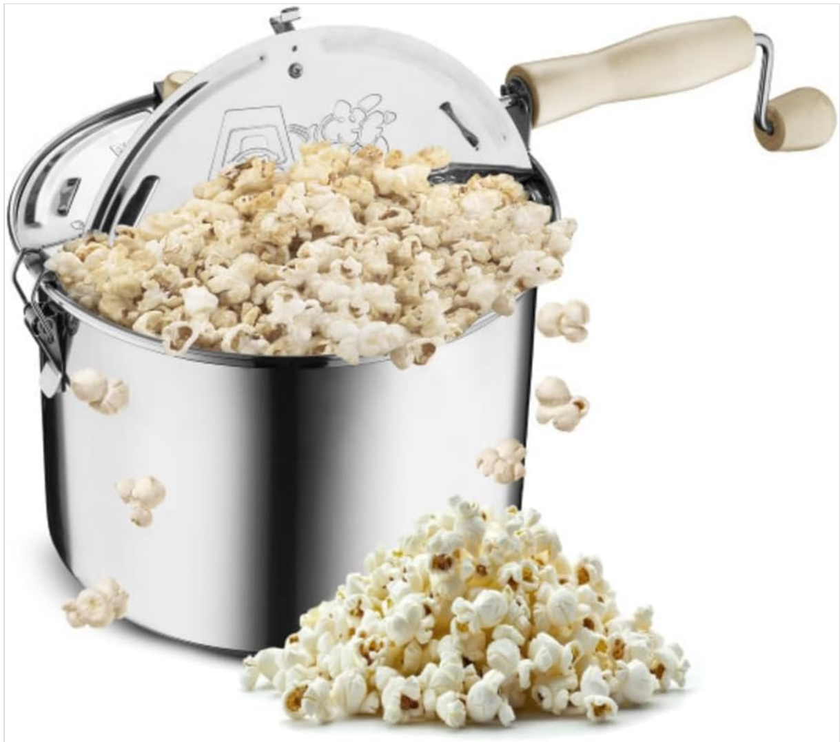
Image: The stovetop popcorn maker filled with freshly popped popcorn, ready for serving.