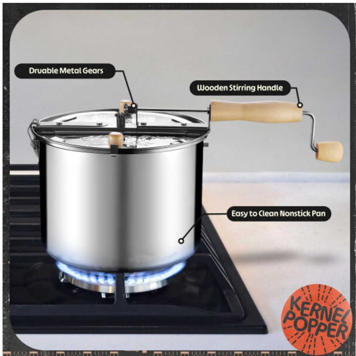
Image: Key components of the stovetop popcorn maker, highlighting the wooden stirring handle, durable metal gears, and the stainless-steel pan.