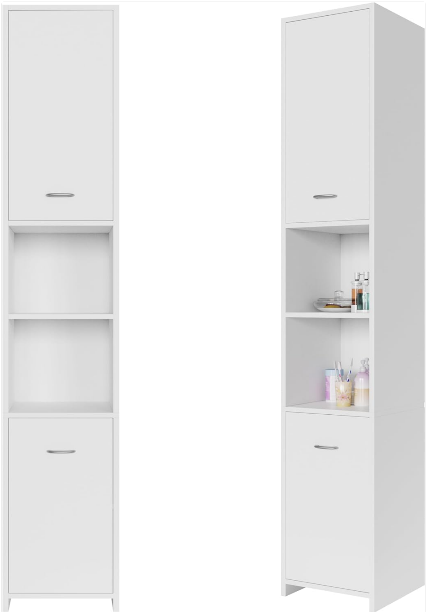
Front view of the Casaria Tall Bathroom Cabinet, showcasing its clean white design and two doors with handles.