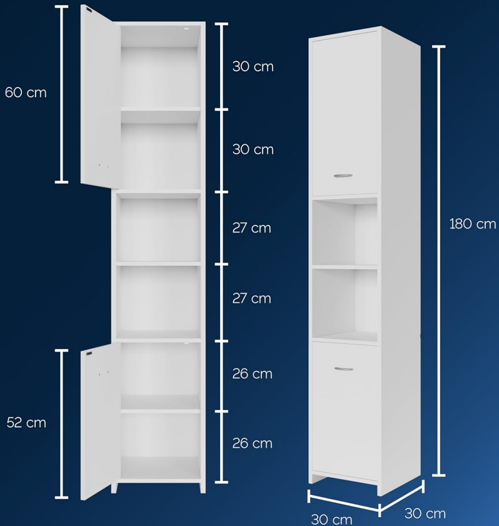
Detailed diagram showing the dimensions of the cabinet: 180 cm height, 30 cm width, and 30 cm depth.